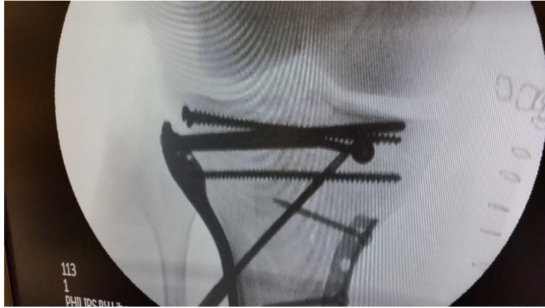
Fig. 4. Intra-operative fluoroscopic image of reconstructed tibial plateau