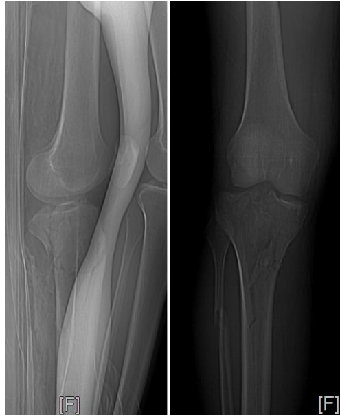
Fig. 1. Preoperative X-ray

CT of the affected joint was obtained. Due to severe swelling of the soft tissues surrounding the fracture site, the patient was immobilised in bed with traction of 8 kg. Based on the CT scans rapid prototyping model was accustomed prior to the surgery in technique described above. The object was printed using Creality CR-10S with a 0,3 mm nozzle, 40% rectilinear infill, with 0,2mm layer thickness and with support material enabled. The filament was 1,75 mm PLA. After the swelling reduction surgery was performed. Day before the planned procedure, the main surgeon was able to practice the fracture reduction of the 3D replica (fig. 2). The The object during the printing process was shown in Figure 3.