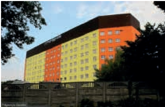
Fig. 4. Center of Oncology in Lublin, 2018.