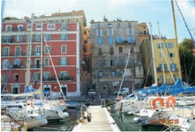
Fig. 3. Residential buildings renovated in colorful tones, Ajaccio, Corsica in France, 2016.