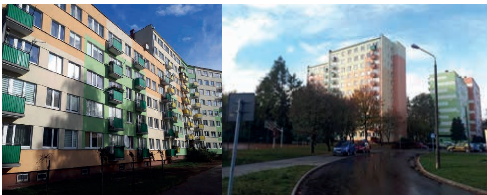
Fig. 1, 2. A residential block of flats on Smyczkova street, 2018, author's photo.

From a psychological point of view, it is well known that optimistic and vivid colours influence people in a positive way, adding energy and willingness to act. This is particularly important for the sick, as they often awaken in them the will to fight the disease, increasing their willingness to live. However, this type of argument does not justify the colour scheme used in the COZL. The therapeutic-therapeutic effect on the patient fulfils its purpose if it is used inside the room where the patient is staying. On the other hand, if colour is used on the external façade of the building, it loses its therapeutic effect and has a purely decorative or, as in this case, „destructive” function. The bright yellow-orange colour scheme of the building is criticised by tourists, residents and architects, who call it „a nightmare”, „gargamela” and „cancer”. The building also took second place in the „Macabryła 2015” competition for the biggest architectural fail of the year.