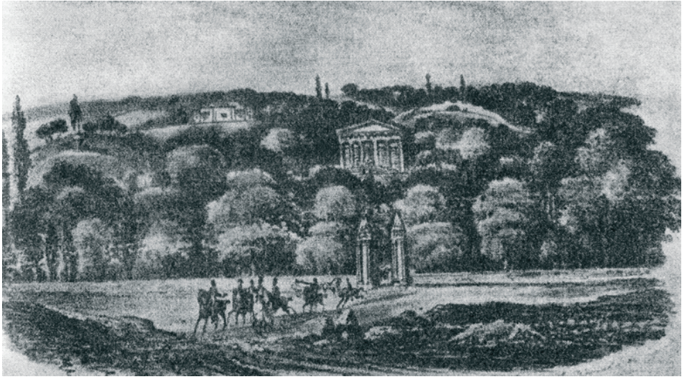
Fig. 5. Dukovskiy garden. Dacha of Rishell'e.