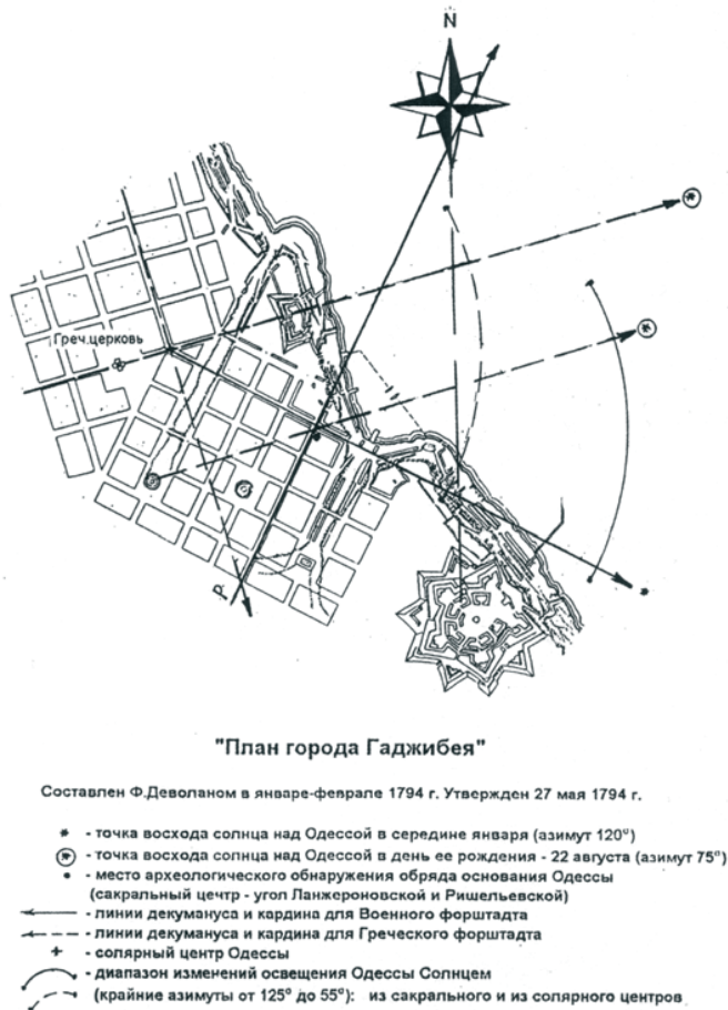
Fig. 4. Odessa - city of the Sun.

The first correct planting of the trees was provided by Felix De Ribas. He had carried out the dream of his brother - founder of Odessa - Admiral Joseph De Ribas, who favoured a summer residence 5 kilometers away from Odessa. The first trees in Odessa were planted by the brothers on an empty site of the city, in so-called Greek quarter. Count Felix Pototsky sent species for this garden from his famous Sofia park. The large garden (more than 2 hectares) in 1806 was gifted to the city and bears the name of City Garden.