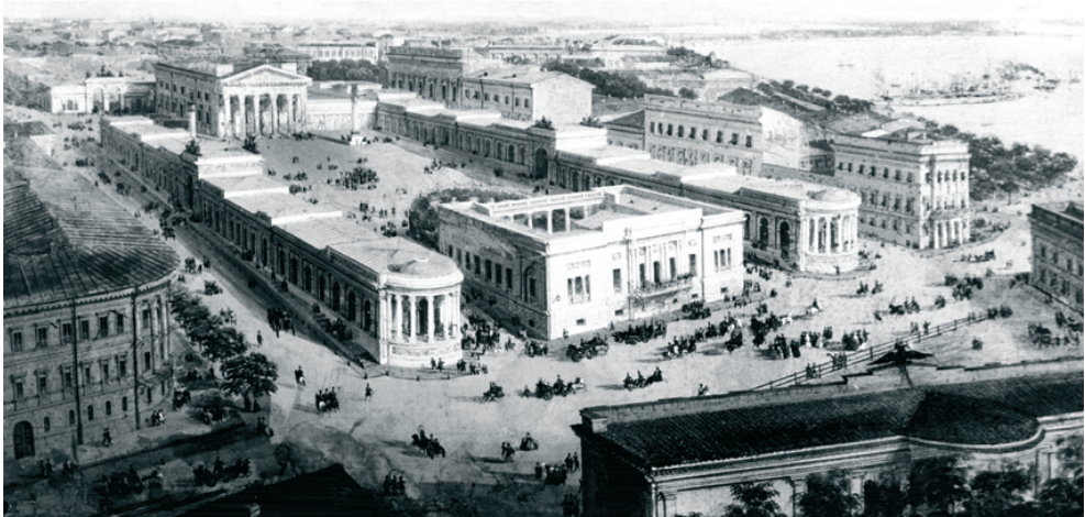
Fig. 6. Project of the Theatrical square G. Torichelli.