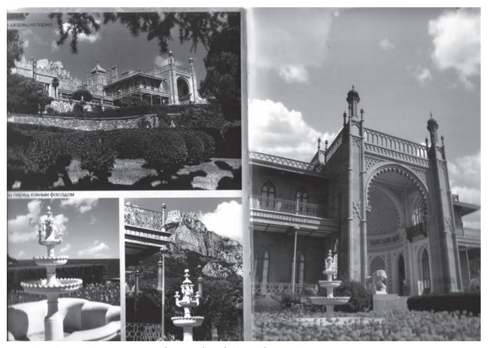
Fig. 10. ALUPKA, Voroncov Palace and Park Complex in Crimea.