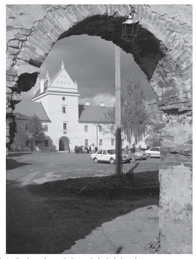
Fig. 5. The castle in Zovkva.