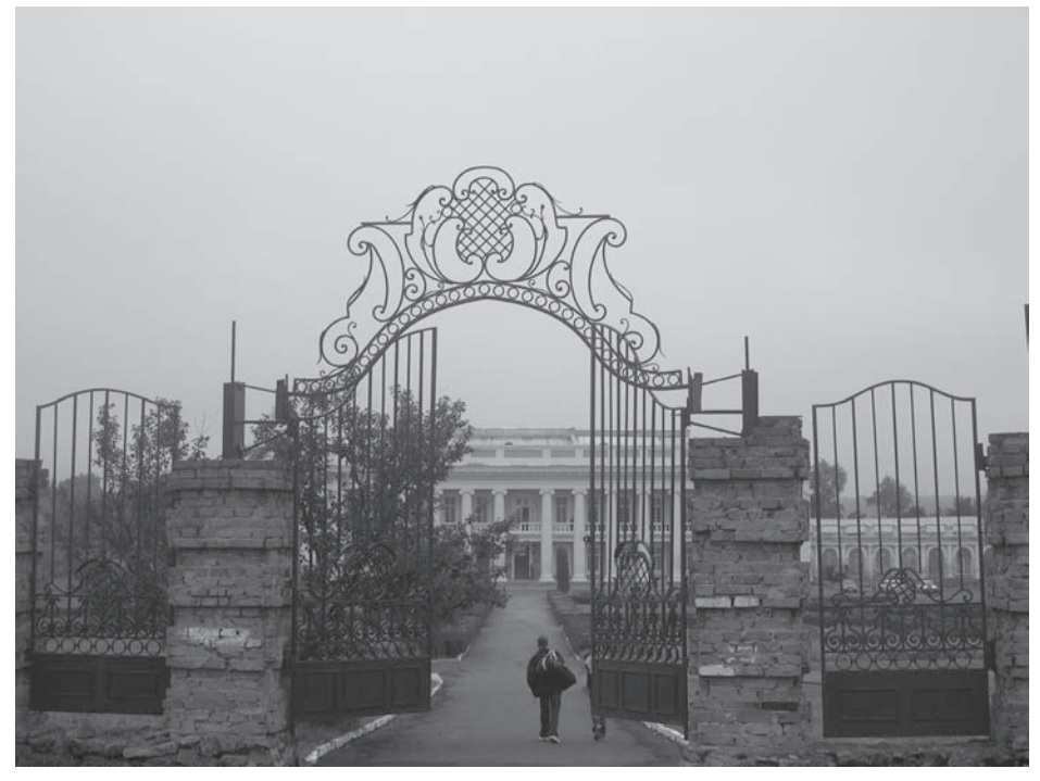
Fig. 4. Tulchyn palace.