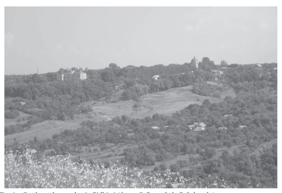
Fig. 6. Castle-park complex in Pidhirci.