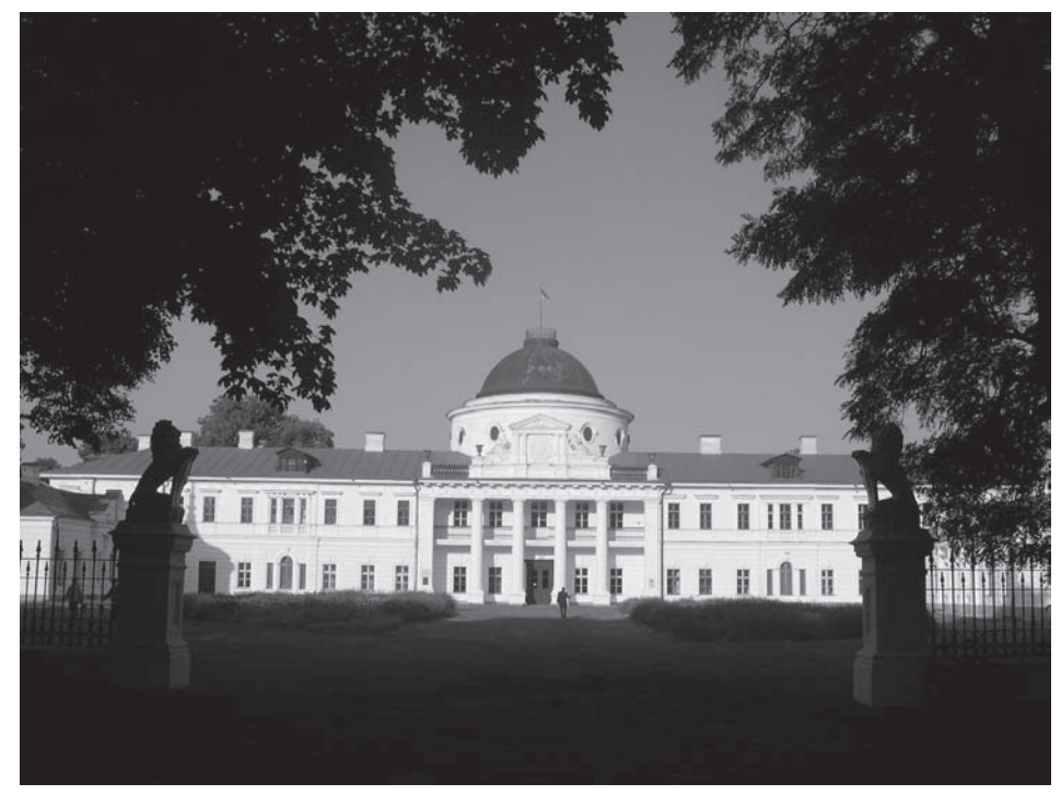
Fig. 1. Kachanivka palace.