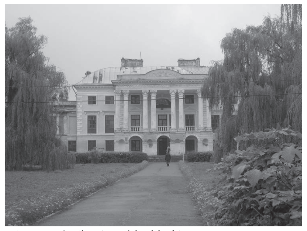
Fig. 2. Nemyriv Palace (foto – O. Remeshylo-Rybchynska).