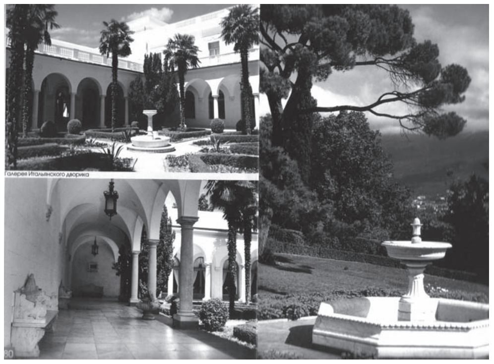
Fig. 11. Livadija Palace and Park Complex in Crimea.