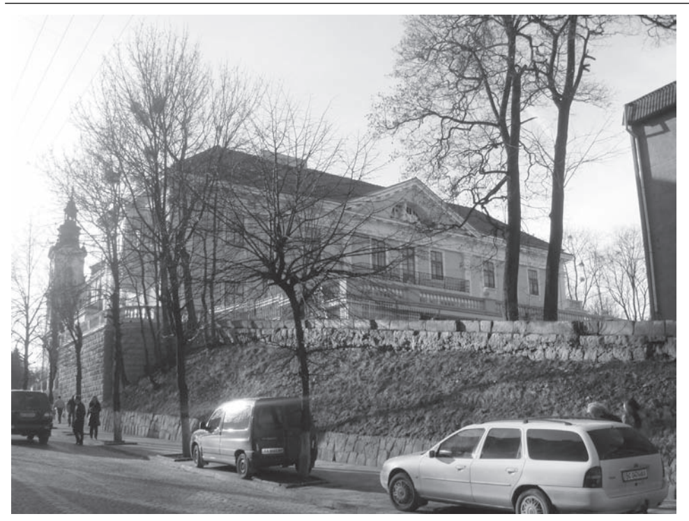
Fig. 7. Lviv, Seniavski palace.