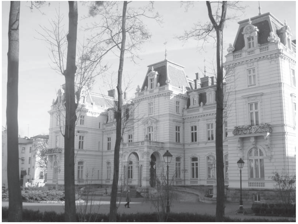
Fig. 9. Lviv, Potocky palace (foto – O. Remeshylo-Rybchynska).