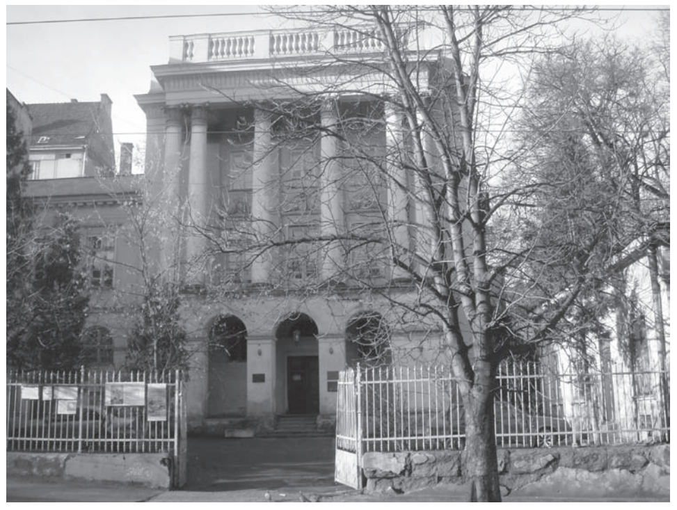
Fig. 8. Lviv, Palace of Belsky family.