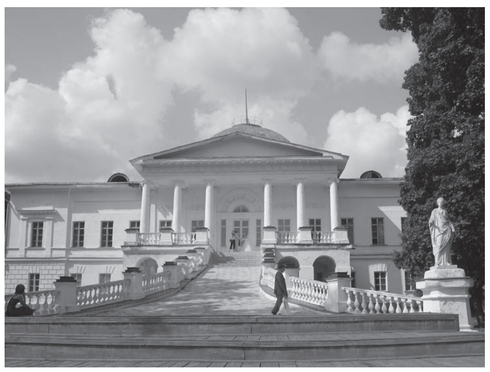
Fig. 3. Sorochynci palace.