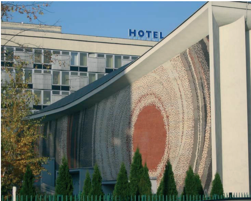
Photo 1, 2. Witold Cęckiewicz – “Cracovia” hotel and “Kijev” cinema in Cracow.