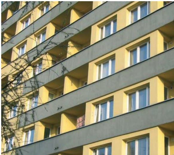
Photo 5, 6. Władysław Bryzek – The Female Students Residence Hall „Pias” of the Jagiellonian University, Piastowska str. in Cracow.