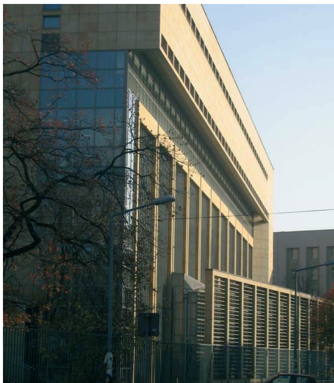
Photo. 11, 12. Romuald Loegler – The Jagiellonian Library – the new wing

The year 1981 was yet another breakthrough in post-war Poland, the year of the spurt of civil freedoms. Together with the following years - coming back to the free profession of an architect - it led to the return to the very roots of modernism