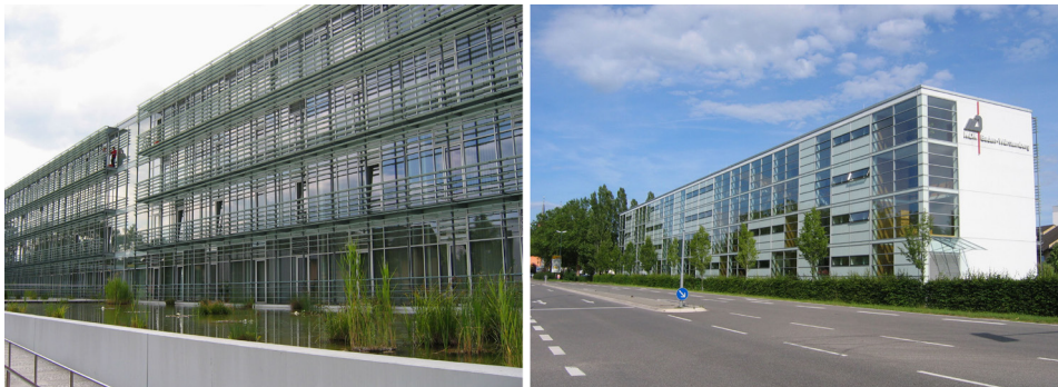
Fig. 3. Administrative building MDK: solar facade (left) and northern elevation (right).

However, this elevation is not equipped with the main entrance and is less decorative. The southern wall can only be viewed from the parking lot of the building. There is no way for it to be observed from a greater distance. The urban context decreases the role of this particular wall as a facade [9].