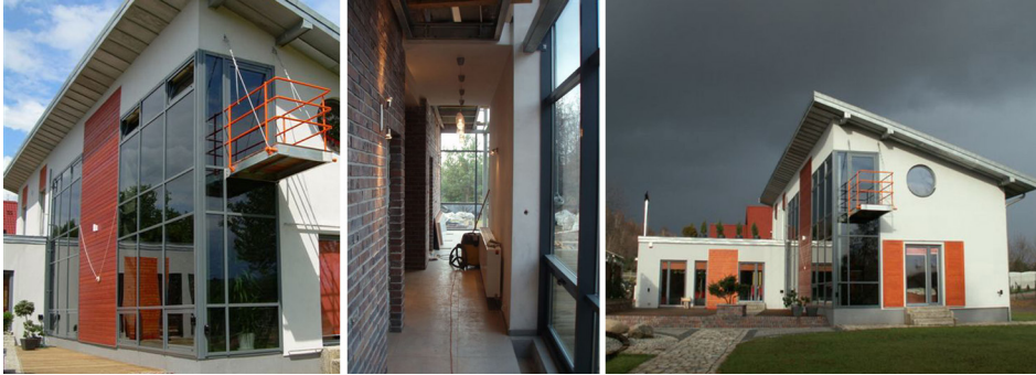
Fig. 2. Single-family building in Bytom: solar facade as an element of a passive solar system.

a positive effect on the aesthetics of the building. The architectural expression was enhanced by the colour contrast between the glazing and the bright body of the building. This solution, however, is less favourable than originally anticipated, due to the reduction of thermal gains from insolation during the heating period, although it represents a passive measure to prevent the building from overheating [8].