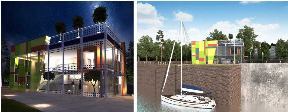
Fig. 1. “Solar-copper house” in Wrocław (concept): solar facade with PV modules of various colors and translucency.

The design of the PV facade, created largely by the aesthetic factor and constituting a kind of “showpiece” of the building, did not provide sufficient energy gains, as expected in line with a plus energy building concept. The implementation of this aesthetic goal forced the introduction of the aforementioned spatial and architectural solutions (passive systems) and other installation solutions (including a heat pump) in combination with energy-saving technical and construction solutions. One of the features of the building is its high thermal insulation properties of the remaining external walls combined with a radical reduction in the share of glazing, especially in the northern elevation. This influenced a simplified aesthetic vision of these walls, which emphasized the leading importance of the described southern facade as a solar facade.