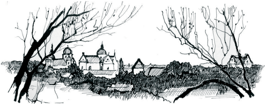
(c) Panorama of Zhovkva. Viewpoint 3.