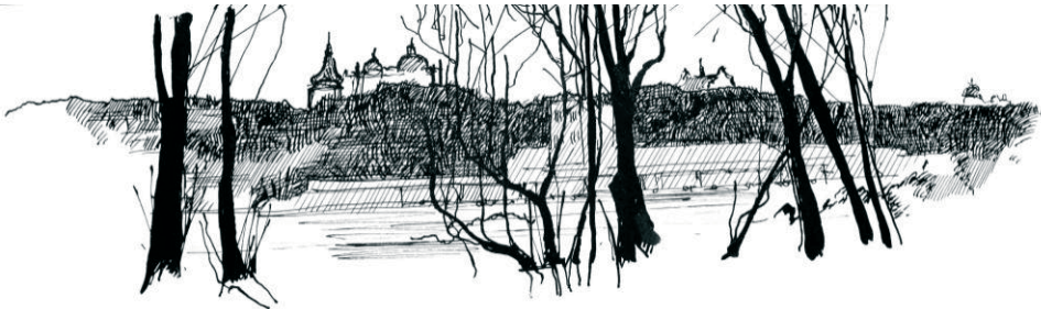
(d) Panorama of Zhovkva. Viewpoint 4.