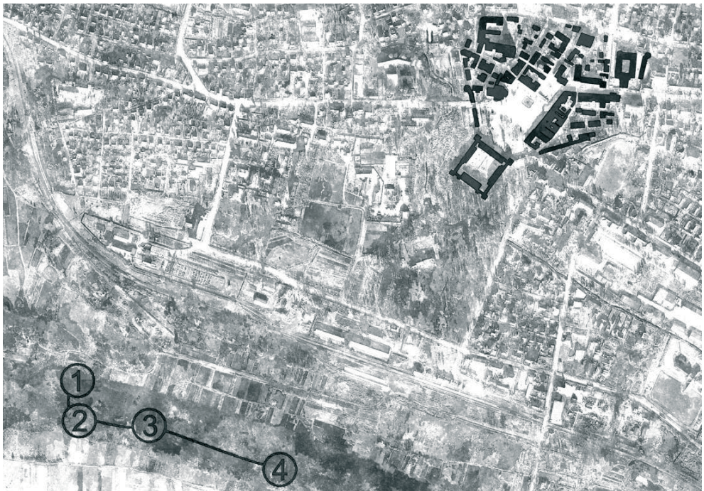
Fig. 3. Footprint of Zhovkva's historic core and viewpoints 1-4

Distance from the object of contemplation allows for a comparative analysis of natural environment and landscape character (proportion of greenery in the city, its dispersion in space, juxtaposition with the infinite horizon). To illustrate the significance of distance observation, the author produced drawings of a small historic city of Zhovkva (Ukraine). An analysis of its panorama shows that nearly all of the sacral buildings are dominating landmarks with minute differentiation of value among them (Figs. 3,4). If we turn to the history of the city, we discover that all religious parishes were given equal privileges. Another observation brought to light through topographic analysis is that those nearly all sacred buildings are situated on the ridge of the hill (Fig. 5).