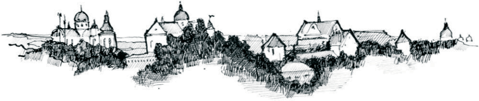
(a) Panorama of Zhovkva. Viewpoint 1.