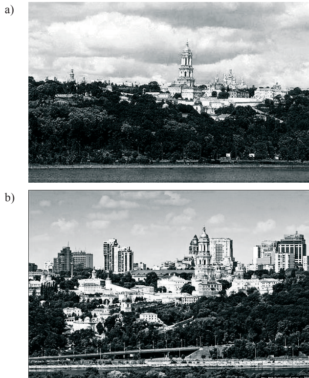
Fig. 6. Kiev cityscape . Change of city panorama: a) 1990th; b) 2014 (author Oleg Totiski)

The city's current urbanization irremediably affects historic cityscapes, changing their character and aesthetic value. Deprived of distinct visual domination and attraction, the historic cityscape is lost in dissonant rhythmic movement of spatial tags, evaluation of historic elements is levelled and replaced by background. Temporal changes in the Kyiv cityscape may serve as an example of the result of such a replacement of visual valuation (Fig. 6). Such an uncontrolled process could cause irreparable damage to small historic areas.