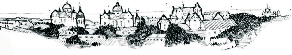
(b) Panorama of Zhovkva. Viewpoint 2.