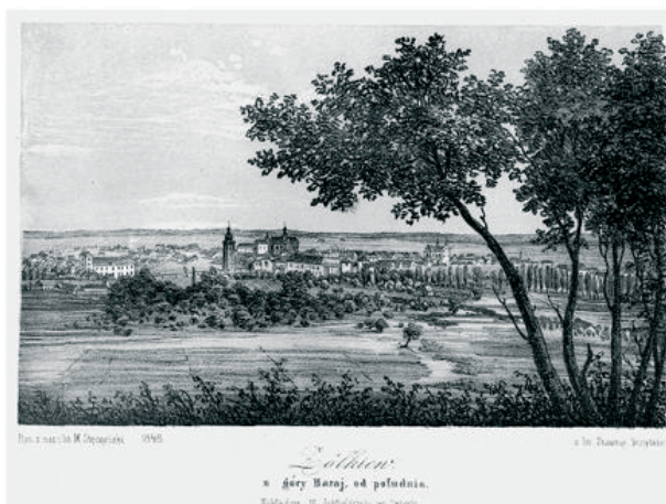
Fig. 1. Lithography of Zhovkva, Ukraine (1848)

Contemplation of urban space from a distance creates a special impression and is capable of revealing the essence of the city's identity. Silhouettes of buildings, the correlation of the dominant and subdominant landmarks, and the outline of the cityscape's rhythmic changes, fore- and backgrounds picturesqueness - culminate artistic expression into one image. Travellers' diaries describe the city's panorama very accurately, attending to each of its parts with the purpose of forming a distinct image of a place and providing the reader with the "elements of "site reading" (Fig. 1, 2).