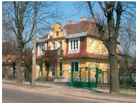
Fig. 3. Cottages for the middle class, the colony “Vlasna Strzecha” (Own Roof) (1931).