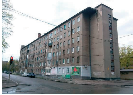
Fig. 5. House of the “socialist city New Kharkiv”.