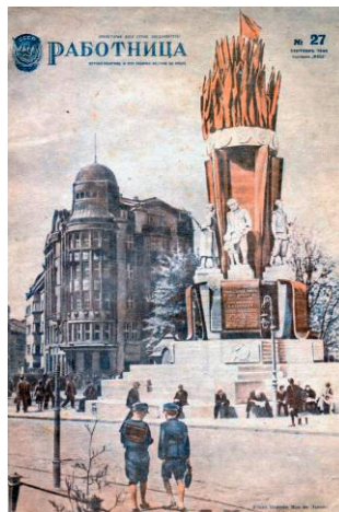
Fig. 10. The monument to the Stalin Constitution in Lviv (1939). The cover of magazine “Rabotnitsa”, 1940, #27.

Since 1939, Lviv has also become red (Fig. 10). In October 1939 the communist ideology spread over the whole city. At the initiative of the Communist Party a large Monument to the Stalin’s constitution was constructed. It consisted of a column surrounded by red flags. Particularly important part of this memorial was in its bottom, where figures of a soldier, a worker, a mother with a child, a girl student and a peasant with a boy symbolized social unity and the base had three plates with the inscription “Friendship of peoples” in different languages (Ukrainian, Polish, and Jewish).