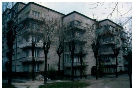
Fig. 4. Tenement house at Stryjska 32/38 Street (1930s).