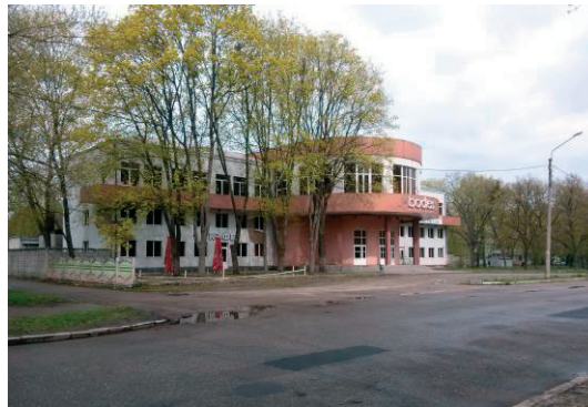
Fig. 6. Dining hall of “socialist city New Kharkiv”.