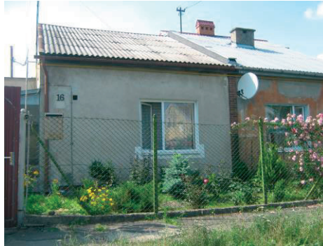
Fig. 2. Economic workers cottages, Sygnivka (1930s ).

This approach formed the basis for a new typology of buildings, best example for which could be found in housing for workers and the middle class – the brightest expression of Polish social policy (economic workers cottages (Syhnivka, Bogdanivka) (Fig. 2), cottages for the middle class (Professor's colony, “Vlasna Strikha” [Own Roof]) (Fig. 3). At this time, tenement houses were built for workers and employees (Fig. 4). All these buildings had common characteristic features: typical designing, creating minimal but fully private housing (with kitchens, bathrooms, bedrooms), formation of small blocks of individual cottages. Multifamily complexes used similar trends: economic, but traditional houses.