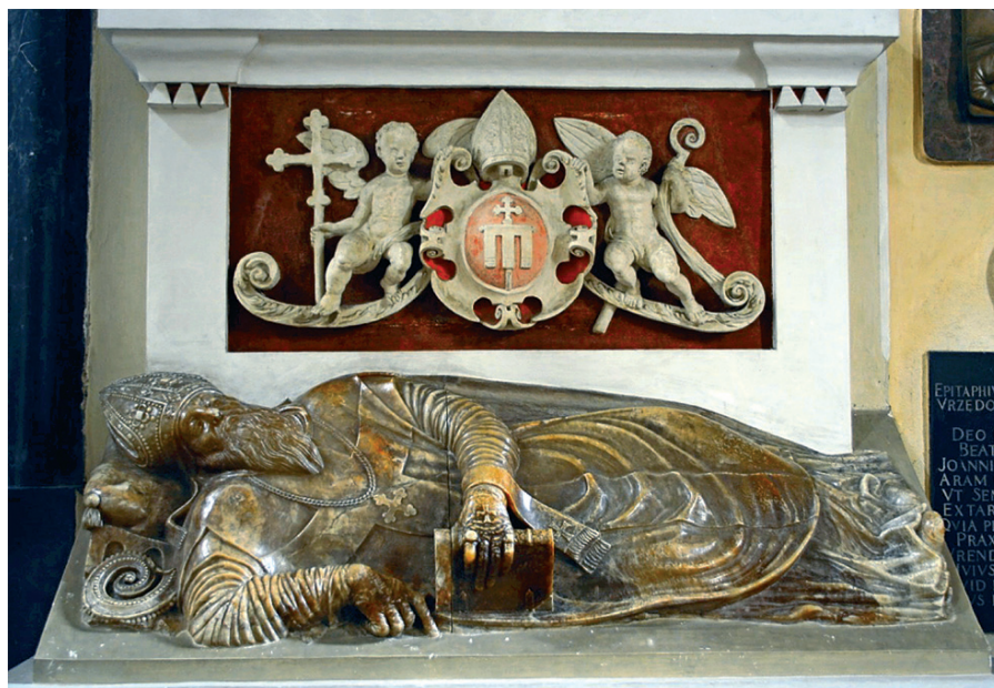
Pic. 19. Tombstone of bishop Uchański in Łowicz. Due to rehabilitation works conducted in the Łowicz cathedral and inability to photograph the work, the photo was published by courtesy of canon Stanisław Majkut STL, resident of the Assumption of the Blessed Virgin Mary church in Łowicz on 15 December 2017

Michałowicz combined two blocks of alabaster to carve the figure of bishop Uchański, as it was difficult to acquire a properly large block of the material. The remaining white elements were carved in Pińczów limestone.