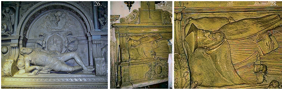
Pic. 26. The central part of Stanisław Tarnowski's tombstone.

Inside the parish church in Chroberz, there are two Renaissance tombstones sculpted by Jan Michałowicz: the first monument was made to Stanisław Tarnowski – founder of the church, whereas the second one, much less richly carved (15 years earlier) to Zbigniew Ziółkowski – the then parson. Easy processing and availability of the sculpting material appears to reflect the artist's style. Both monuments have similar ornaments. The colour and not polishing susceptibility, permanence and relatively homogeneous structure of the stone suggest that the basic building material was the Pińczów limestone. Distance of 15 kilometres between Chroberz and Pińczów would account for the use of this raw material.