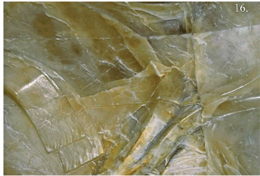
Pic. 16. Fragment of the material used to sculpt the figure.