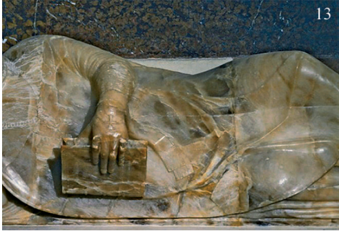
Pic. 13. Figure of bishop Padniewski.