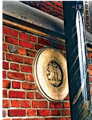
Pic. 18. Medallion with the artist's house mark.