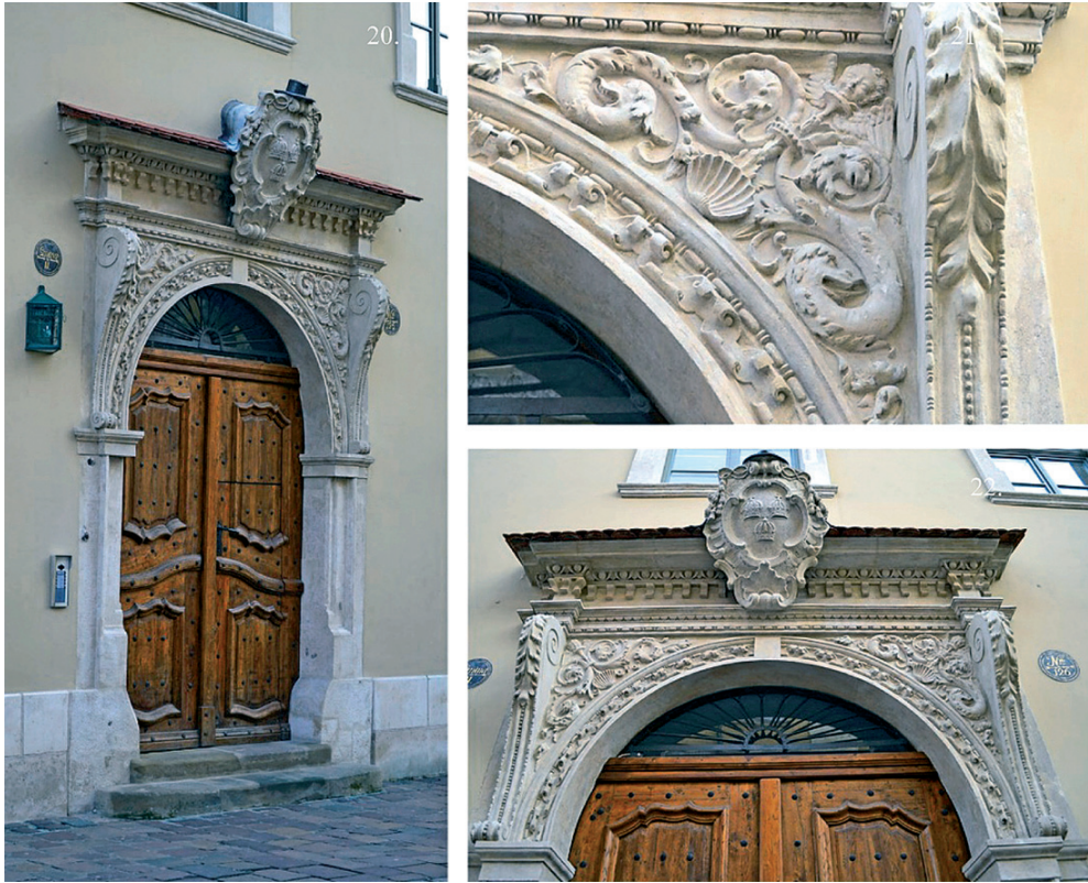
Lintel of a historic tenement house at 18 Kanonicza Street in Cracow

Pic. 20. View of the entire lintel.