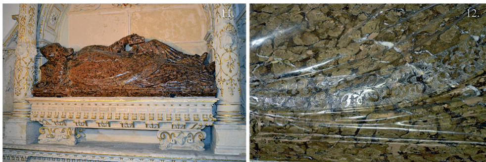
Pic. 11. Figure of bishop Zebrzydowski with the setting carved in Pinczów limestone. (Pic. P. Rzęsa) Pic. 12. Close-up on the rock structure and a richly ornamented fragment of the robe. (Pic. P. Rzęsa)

The main figure in the tombstone of bishop Andrzej Zebrzydowski was carved in red Bolechowice marble (Pic. 12). The setting surrounding the figure was made of Pinczów limestone (Pic. 11), whereas the plaque is most probably the Bolechowice marble; figure of the bishop is presented below in picture 4.