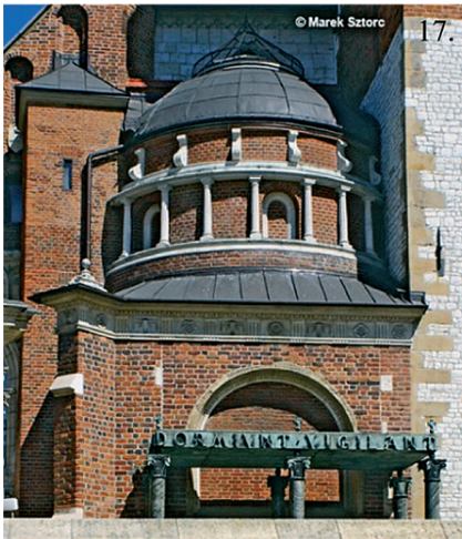
Pic. 17. Bishop Padniewski's chapel – view from the outside.