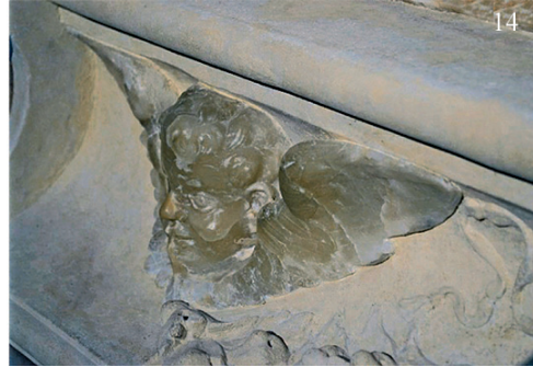
Pic. 14. An angel – an ornamental element.