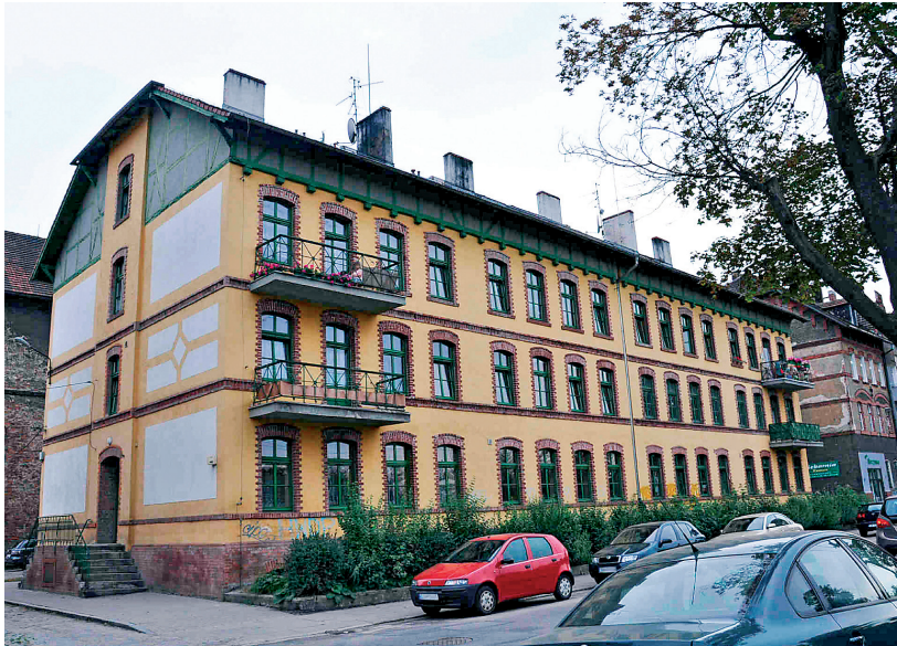
Fig. 4. Multi-family semi-detached house of the former “Kolonія” housing estate for the employees of the railway at Chińska street no. 14 – the example of acceptable modernization, (Pic. the author, 2016)