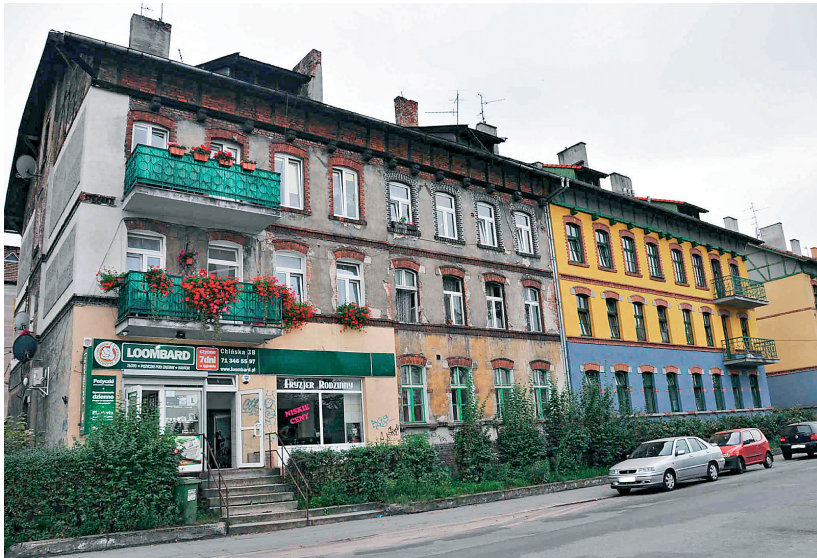
Fig. 3. Multi-family semi-detached house of the former “Kolonía” housing estate for the employees of the railway at Chińska street no. 4 – the example of incorrect half-modernization, (Pic. the author, 2016)

Nowadays the buildings don't belong to the railway anymore, and the residents of the apartments connected by one staircase create housing communities. Parts of historical buildings are subject to thermal retrofitting without coordination of this action with other communities. It means that half of the building is renovated, while second half might be untouched, still remaining in very bad shape (Fig. 3). The choice of colours and the doubtful preservation of the former plaster applications on the gable walls of the buildings are also debatable (Fig. 4).