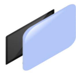
Fig. 1. Reference drawing of the screen

The mirror is composed of a NTT Corrino 617 SU laptop running Ubuntu 14.04, with a IIyama LED 22" E2283 as external screen and an external microphone. Additionally, a 4 millimeter one-way mirror is put in front of the screen for the desired effect as seen in figure 1. The IIyama E2283 was chosen as screen due to its built-in speakers and connector layout - they are on the side, allowing for more compact cable management when connecting to the laptop, or any future processing unit.