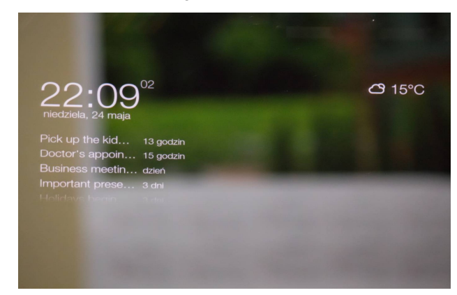
Fig. 2. Upper part of mirror, depicts date, time, weather and calendar

The mirror provides some features by default, without the need for widgets or modifications. These include displaying the date and time, upcoming calendar events, local weather, post it functionality and maps. The interface itself is designed in an elegant, minimalistic manner, featuring soft fonts such as Helvetica Neue and light colors. Additionally, any of the base elements can be hidden by issuing the command hide (pl. schowaj ) <component name>. A combination of these elements can be seen in figure 2.