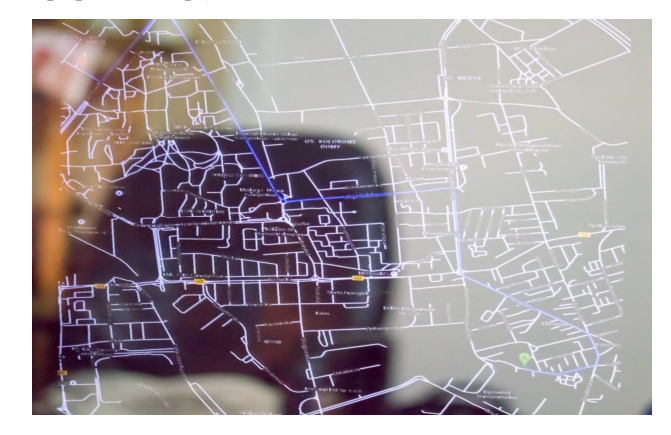
Fig. 3. The entire interface is overlaid with the requested map

The map functionality is provided using Geolocation and a custom styled map provided by the Google Maps. The user may ask the mirror for any location – the map in figure 3 was produced by asking: how to find to Mikolajczyka street in Opole (pl. jak dojadę do Mikołajczyka Opole ) – with a correct result. Alternatively, the from location can be set in the settings, and the style of the map can be changed to the default one provided by Google Maps. The map can be dismissed by issuing the command: delete map (pl. usuń mapę ).