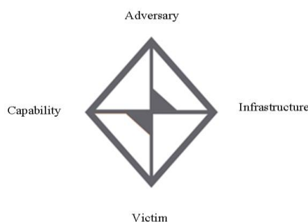
Fig. 2. Diamond model

This model also defines additional functions to support higher-level constructs, such as combining events together in activity streams and their subsequent integration. The model establishes a formal method that applies scientific principles to intrusion analysis, including measurement, testing, and repeatability. This scientific approach and simplicity can improve analytical efficiency and accuracy. Finally, this model provides the ability to integrate real-time threat intelligence to protect the network, automatically correlate and classify events. In its simplest form (Fig. 2), the model describes the enemy's ability to attack the victim's infrastructure. These elements are called events and are filled in by the analyst in case they are detected during threat investigation or cyberattack investigation. The vertices are connected by edges and distinguish connections between functions. Going along the edges and vertices, analysts find more information about the operations of the attacker and discover new capabilities (capabilities), infrastructure and victims. The event determines only one step in the series that the opponent must perform to achieve his goal.