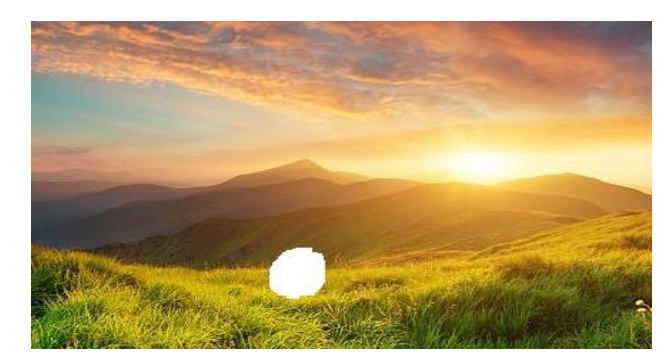
Fig. 4. Damaged Image