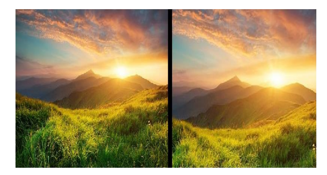
Fig. 5. Output of Proposed method (SURF algorithm)

Table 1. Performance Analysis of different Image inpainting Techniques