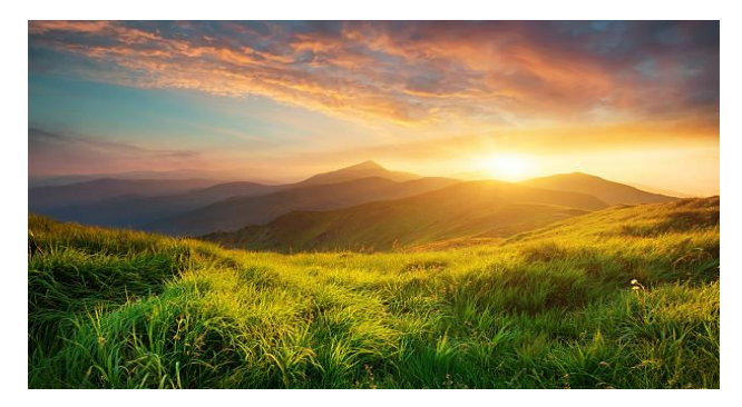
Fig. 3. Relevant Image

In the aforementioned cases, distinct values such as the PSNR, MSE were computed. The exemplar-based method and SURF algorithm are two prominent techniques utilized in the field of image inpainting. The values of Signal-to-Noise Ratio and mean square error are 62.8 dB and 0.03 respectively. In this proposed inpainting method, signal ratio is enhanced by 2.5 times. Figure 6 display the input image with visible scratches, followed by the image following the process of exemplar based inpainting.