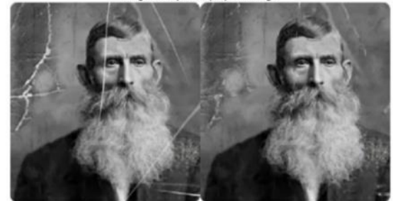
Fig. 6. Exemplar based image inpainting [13]