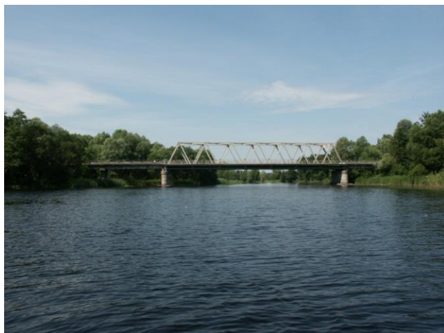
Fig. 3. Bridge with a metal truss

By using the ANSYS software, engineers were able to conduct detailed analyses of the bridge structure, taking into account its geometry, material properties, and boundary conditions. The software allowed for the simulation of various loading scenarios, such as static loads, dynamic loads, and environmental conditions, to assess the structural behavior and performance of the bridge.