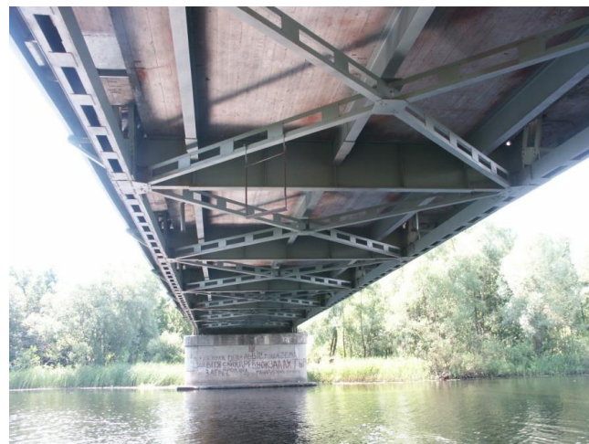
Fig. 4. The general view of the beam cage of channel span 3-4 s

at the bottom, metal connections, a beam grid with a monolithic reinforced concrete slab for the roadway section, and prefabricated sidewalks. The metal beam grid of the river section is composed of transverse and longitudinal beams with I-shaped cross-sections. The transverse beams are located at the lower nodes of the truss with a spacing of 7.5 m. Three longitudinal beams are installed at the level of the upper flange of the transverse beams with a spacing of 2.76 m. The cross-section of the upper and lower flanges of the trusses consists of two channel sections (No. 30) joined together by top and bottom welded cover plates ( 320 \times 240 \times 8.1 mm) with a spacing of 0.84–0.87 m along the axes. The trusses are connected by horizontal diagonal bracing members, whose cross-section consists of two angle sections ( 126 \times 80 mm) joined by cover plates. The length of the metal river span is 53.50 m.