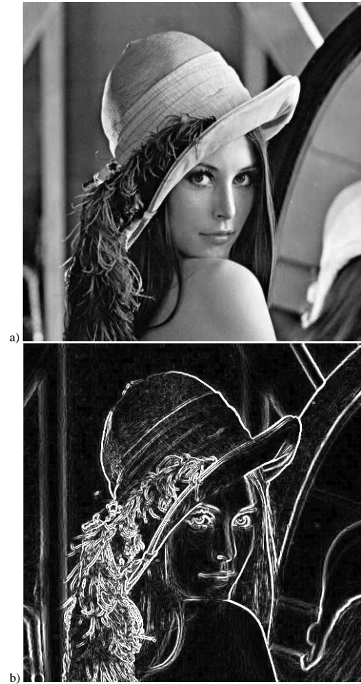
Fig. 1. Result of work of the modified Sobel operator: a) input image; b) output

function [y x metric] = CalculateMotionBlur- rCurve(image) image = ApplySobelOperator(image, true, true); image = mat2gray(image); [n, m] = size(image); gropWidth = 5; image = image(gropWidth:(n-gropWidth), gropWidth:(m-gropWidth)); len = 9; step = 1; x = zeros(1, 180/step + 1); y = zeros(1, 180/step + 1); for i = 0:(180/step) degree = i * step; h = fspecial('motion', len, degree); conv2im = conv2(image, h, 'same'); y(i + 1) = -log(mean2((image - conv2im).^2)); x(i + 1) = degree; end t = median(y); metric = abs((max(y) - t) / (t - min(y))) * var(y); end