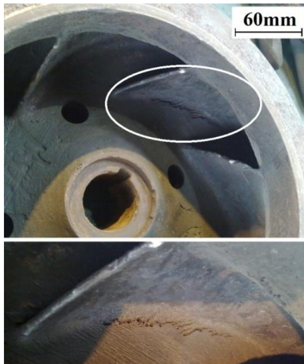
Fig. 3. Cavitation damage of the rotor disk located near the intake edge of the blades. The magnified area shows a typical, rough surface area of cavitation erosion [16]