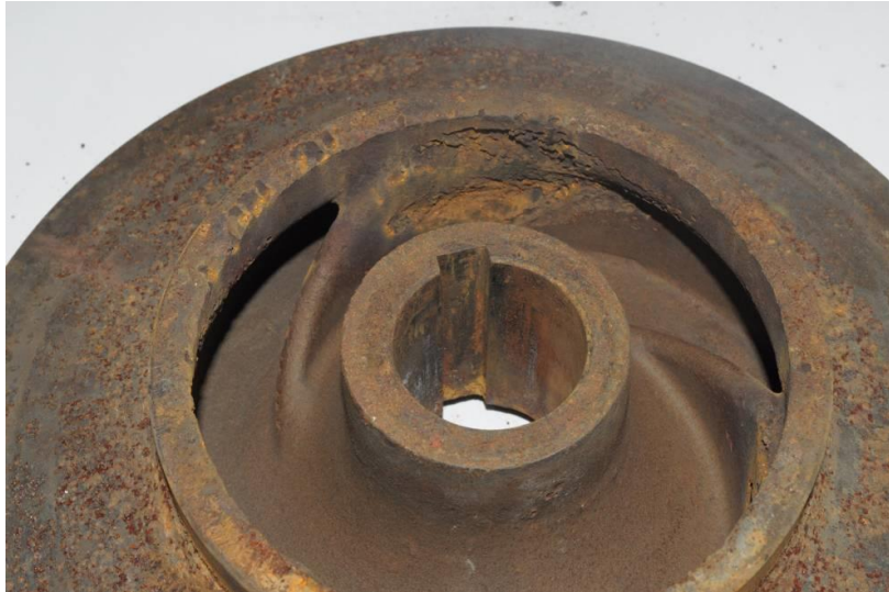
Fig. 2. Centrifugal impeller with a single curvature of the blades. Cavitation damage: rear wall of the blade near the edge of the inlet, cast iron [3]