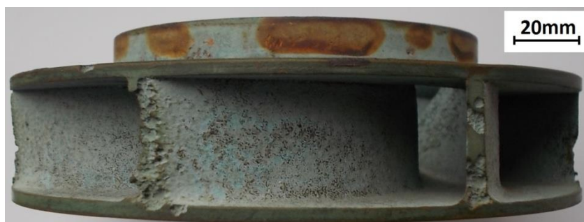
Fig. 4. Centrifugal impeller with a single curvature of the blades. Cavitation wear of the inlet edges of the impeller blades, silicon bronze [17]