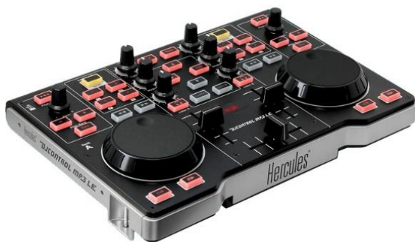
Fig. 1. Hercules DJControl MP3 LE (source: [23])

The second device, the proposed middleware was made to work with, is a MPK mini musical keyboard from Akai, allowing for input multiple keys, but also equipped with 8 knobs, presented in the Figure 2.