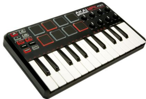
Fig. 2. Akai MPK Mini

The middleware, dubbed “DjToKey”, is a software suite designed for a simple mapping of MIDI messages from the input devices into scripts performed in the operation system [7].