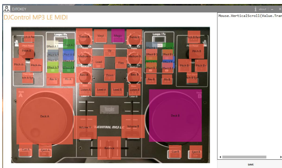
Fig. 4. DjToKey application interface

In the Fig. 4. the screen of DjToKey application with connected DJControl MP3 LE controller is shown, while in the Fig. 5. – the screen of the raster software editing platform with a set of controls, which may be manipulated using provided physical controls, instead of only virtual ones.