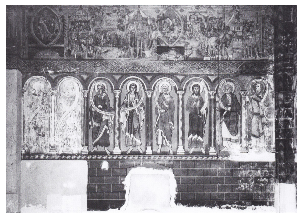
Fig. 2 Brunswick, St. Blasius, View from the nave to the crossing and the chancel, after the rerestoration of the wall paintings by Adolf Quensen 1895–98. Photo 1899.