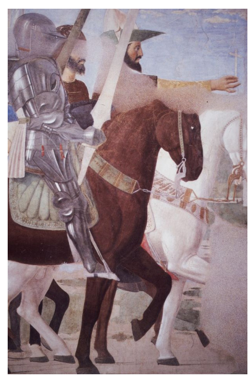
Fig. 11-12 Piero della Francesca, Wall painting cycle "The Legend of the True Cross"; Detail of the scene with the "Victory of Constantine over Maxentius at Pons Milvius", on the left with "neutral" reintegrations of 1965, on the right with reintegrations in "Astrazione cromatica" and "Selezione cromatica" of the 1990s

The conservation-restoration of the 1990s respected the historical and aesthetic values of the wall painting cycle in terms of a scholarly investigation and critical evaluation of its handed-on conditions. The treatment of lacunae in the scene depicting the "Exaltation of the True Cross" shows that a value judgement can argue for the preservation of an "impressionistic" retouching carried out in the midnineteenth century by Gaetano Bianchi, because at that time, such a reintegration was a very avantgarde concept influenced by the already mentioned Giovanni Battista Cavalcaselle. This retouching was uncovered, removing the "neutral" reintegration of the 1960s, and preserved as a valuable historical testimony. [Fig.13] Thus, the critical evaluation of a series of historical restorations and their material remains does not at all mean "either preserve them or remove them"; instead, a detailed analysis and interpretation of all findings is required, step by step. In fact, in Arezzo a sophisticated concept of conservation-restoration could be realised, able to preserve this meaningful work "in the full richness of its authenticity". We can suppose that Brandi would have been very pleased with this result!