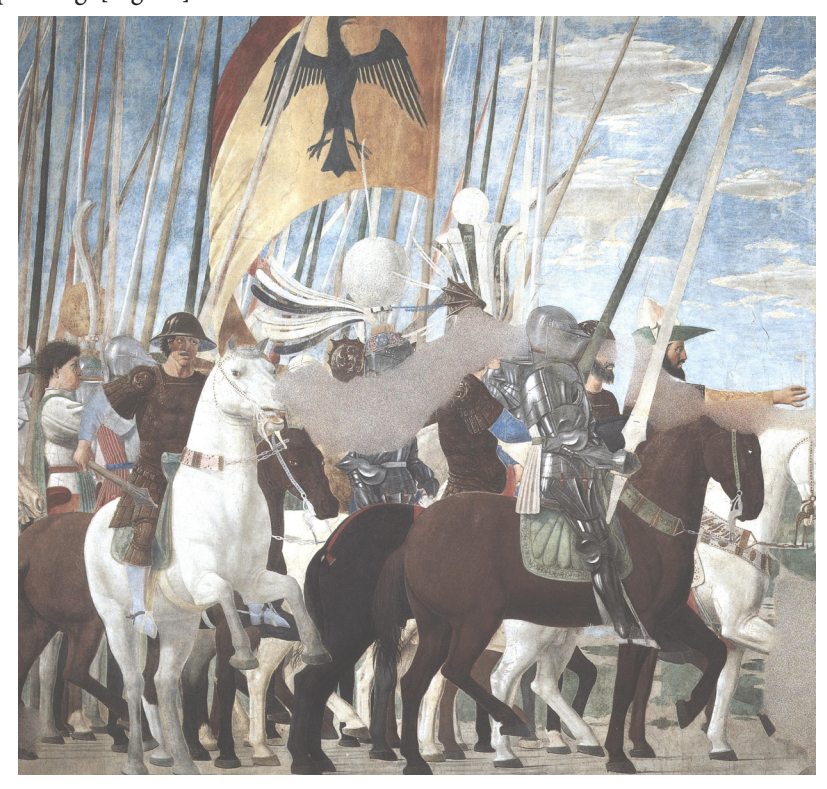
Fig. 10 Piero della Francesca, Wall painting cycle "The Legend of the True Cross", Scene with the "Victory of Constantine over Maxentius at Pons Milvius", after the conservation-restoration of the 1990s, with reintegration of the lacunae in "Astrazione Cromatica" and "Selezione Cromatica".

A comparison of a detail from the scene "Victory of Constantine over Maxentius at Pons Milvius" depicting Emperor Constantine, before and after the last conservation-restoration, i.e. with the former and the actual reintegration of lacunae (Fig. 11-12), emphasizes a theme of Brandi's concept of the "historical instance" with its multi-layered facets. Without any doubt, even the worst reintegration does document human activity and therefore it should not be removed. This position seems historically perfect, but in fact it leads to a conviction of non-authenticity or falsification of the entire work of art. (Brandi, 1963; Brandi, 1977, p. 37) Thus, in evaluating historical reintegration, we cannot avoid a value judgement if we want to preserve the historical authenticity of a work, in terms of a philological critique of the handed-on interventions of the past. <sup>20</sup> Furthermore, with reference to Brandi's "aesthetic