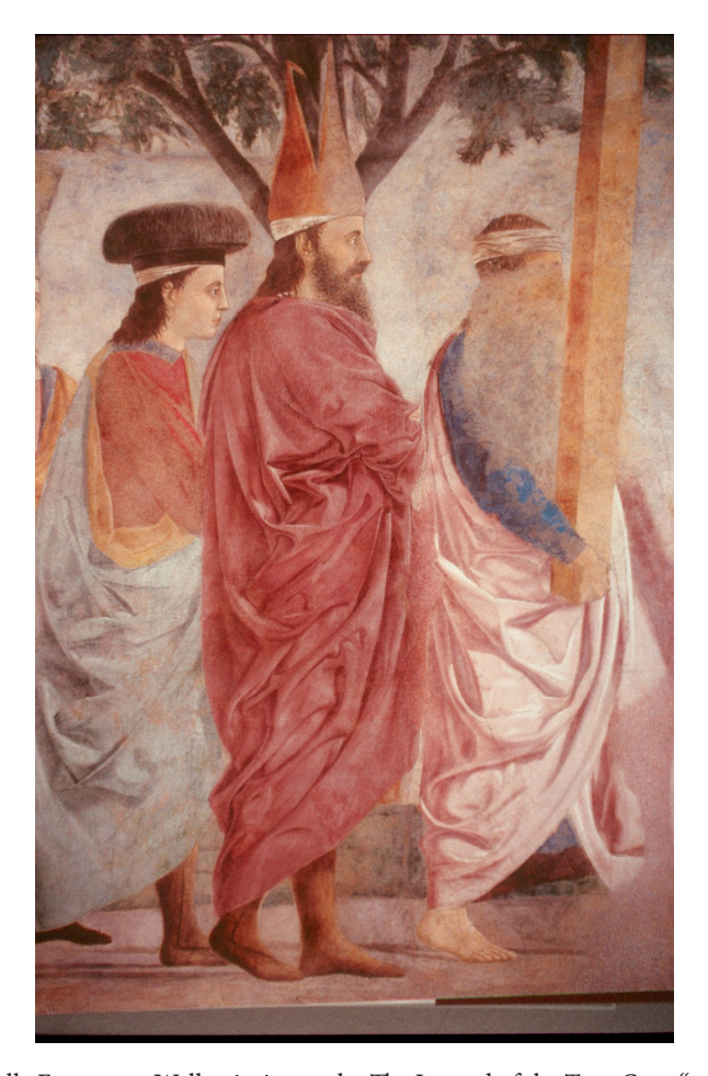
Fig. 13 Piero della Francesca, Wall painting cycle "The Legend of the True Cross", partial view of the scene with the "Exaltation of the True Cross", after the conservation-restoration of the 1990s, with uncovering and presentation of the "impressionistic" retouching by Gaetano Bianchi, carried out in 1858–61.