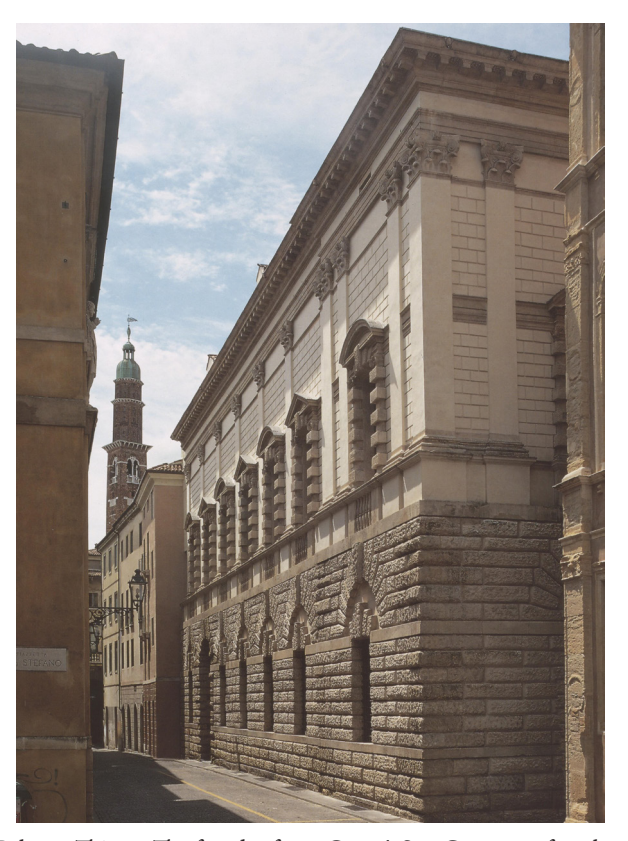
Fig. 19 Vicenza, Palazzo Thiene, The façades from Contrà San Gaetano, after the conservation and reconstruction of the plaster layers of the 1990s

Now we wonder: where is the authenticity of Palazzo Thiene's façades, with all these differences? Without any doubt, we can find authenticity in the preserved material fragments as truthful sources of information, <sup>26</sup> as well as in the reactivation of traditional craftmanship, with proven and long-time forgotten materials and techniques of plastering, e. g. the surface refining with a marmorino. Finally, with all given restraint, the reconstruction is an approach for visualizing the aesthetic intentions of Palladio. Thus, we have meaningful elements of authenticity in these façades, even though today they look quite different from the original.