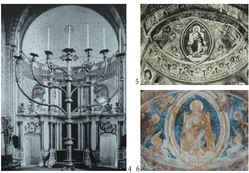
Fig. 4, 5, 6 Brunswick, St. Blasius, Wall paintings in the main apse: fig. 4 after the restoration of Heinrich Brandes 1845–1854, with a decorative painting in neo-medieval style; fig. 5 after the rerestoration of Adolf Quensen 1895–1898, with a freely reconstructed neo-medieval depiction of Christ in Majesty; fig. 6 after the de- and re-restoration of Fritz Herzig in the 1950s, with a reinterpretation of the neo-medieval depiction.

generation of conservator-restorers. The most curious example of a continuously evolving reception and interpretation is the transformation of the wall paintings in the conch of the main apse, from 1845 to the 1950s. [Fig. 4, 5, 6] Due to the very few original findings in the conch after the uncovering in 1845, Brandes opted for a simple decorative painting in neo-medieval style, instead of an impossible reconstruction of the Romanesque depiction. Adolf Quensen in 1895 rejected this solution as not conform with the spirit and the iconography of a Romanesque painting cycle. He decided to freely reconstruct the depiction of Christ in Majesty among figures of Saints. His painting was probably not based on the very poor findings still preserved in situ but referred to similar Romanesque depictions. In the 1950s, Fritz Herzig decided to perform a de-restoration of the wall paintings in the apse, not carried out in the 1930s, with a following re-restoration. In fact, Herzig reduced Quensen's painting layer and re-interpreted the underpaint layer, as well part of Quensen's work, in a sober style, thus reflecting a "more Romanesque" and "more authentic" design typical for the taste of the 1950s (Schädler-Saub, 2008, pp. 145-146).