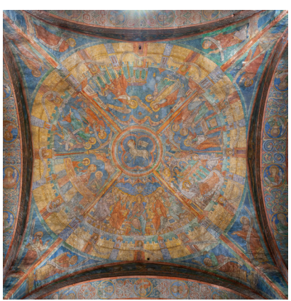
Fig. 1 Brunswick, St. Blasius, Wall Painting Cycle of 1240/50: View on the vault of the crossing, with the depiction of the Heavenly Jerusalem

Upon entering the monumental interior of the Romanesque Collegiate Church in Brunswick (Lower Saxony), founded by duke Henry the Lion in 1173, believers and visitors look out on the presbyterium, with the wall painting cycle in the chancel, the crossing and the transept, dated in the 1240s and signed by Johannes Wale (Gallicus).<sup>3</sup> It is impressive to observe the figurative scenes with their rich colouring and their ornamental framework covering walls and vaults, in harmonious interaction with the architecture. [Fig. 1]