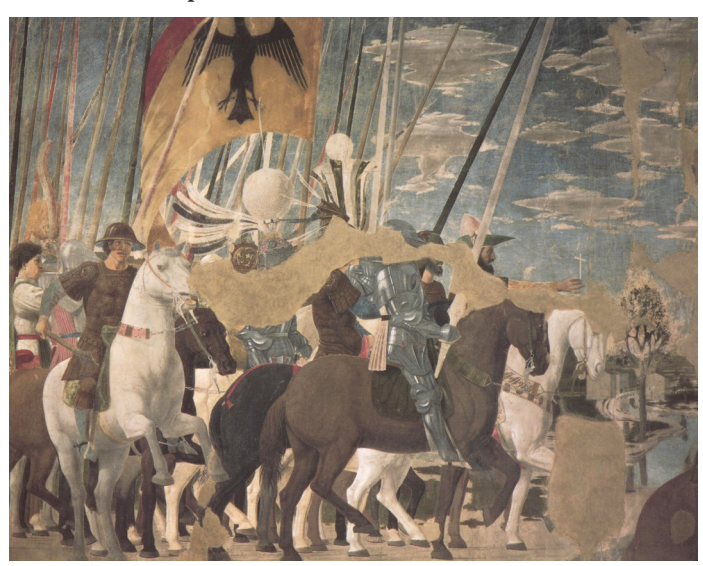
Fig. 9 Piero della Francesca, Wall painting cycle "The Legend of the True Cross", Scene with the "Victory of Constantine over Maxentius at Pons Milvius", after the restoration of Leonetto Tintori 1961–65, with "neutral" reintegration of the lacunae.

As this case study exemplifies, the research on restoration history should also consider former debates about the quality of a coeval intervention, especially concerning its aesthetic results because in contrast to conservation treatments, they are well visible not only for experts but also for the public. Thus, we can make the case that the claim for preserving historical restorations in the name of authenticity cannot be generalised but needs critical evaluation with respect to ethical and aesthetic principles as well as to scientific and technical aspects and to the social context of its time.