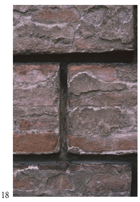
Fig. 16, 17, 18 Vicenza, Palazzo Thiene, a partial view and details of the east façade, with fragments of the intonaci and marmorini of the sixteenth and nineteenth century.

Fig. 17 Finding of a marmorino of the sixteenth century.