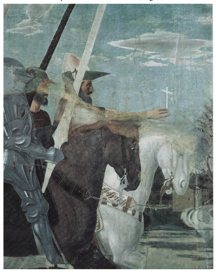
Fig. 8 Arezzo, St. Francis, Piero della Francesca, Wall painting cycle "The Legend of the True Cross"; Detail of the scene with the "Victory of Constantine over Maxentius at Pons Milvius", with the reintegration of lacunae carried out before 1961 (by Gaetano Bianchi or Domenico Fiscali).

fragmentary paintings. He emphasized the advantages of this method, probably inspired by the principles of Cavalcaselle, by claiming that pastel colours are easily removable and clearly discernible from the original (Centauro, 1989, p. 132). <sup>14</sup> Fiscali criticised Bianchi's reintegration with "erroneous tempera colours" and removed many of them, but not all. <sup>15</sup> [Fig. 8]