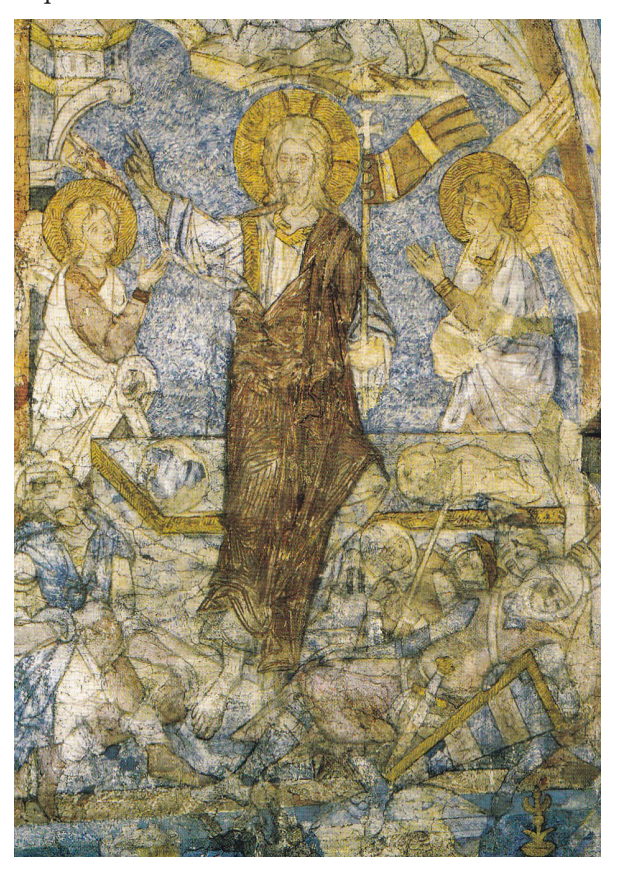
Fig. 7 Brunswick, St. Blasius, Wall Painting Cycle of 1240/50: Depiction of Christ's Resurrection in the southern transept, after the re-restoration by Fritz Herzig, in the 1950s

Returning to the direct observation of the wall paintings, at close range, i.e. from the scaffoldings, it is clearly visible that the paintings today are characterized by the intervention of the 1950s, with a cross hatching reintegration carried out in secco-technique that mostly covers the heterogeneous and heavily damaged historical painting layers. [Fig. 7] Because of this, the reintegration does not respect the demands of modern conservation ethics at that time because it is not limited to the lacunae but rather spreads out like a mesh. For Fritz Herzig, this was the only way to regain the image, i. e. the visual value of the painting cycle in interrelation with the architecture, but with some misunderstandings and misinterpretations. Due to the modest investigation techniques at that time, he was not able to clearly identify the few fragments of the very delicate original tempera paintings and to distinguish them from the subsequent over-paintings. From the normal viewer distance, of course, these problems that are essential for a scholarly conservation-restoration and a well-founded analysis of history of art, are optically of no consequence.