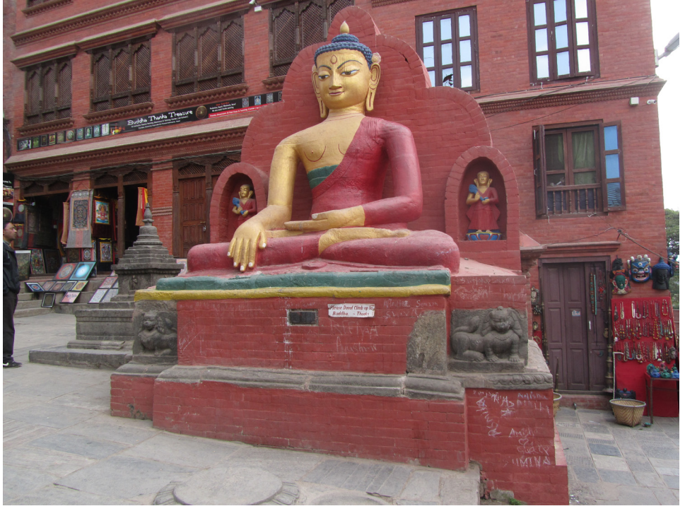
Fig. 5 Swayambhunaht, The statue of Buddha near the Shantipura Temple

people. In this case, it seems that a more comprehensible reference might have been to the opening of the " Discourse on knowing the better way to live alone " of the Bhaddekaratta Suttam, in which we read: " Do not pursue the past. Do not lose yourself in the future. The past no longer is. The future has not yet come. " And this might suggest to those addressing the reconstruction that they adopt solutions of entirely "resurfacing" the lost temples, or substituting the lost pictorial or sculptural decoration, rather than attempting recovery and restoration. In fact, our Nepalese colleagues had begun by energetically undertaking the reconstruction of their buildings ex novo, forcefully affirming the cultural requirement of new sacred symbols, in brilliant colours and perfect condition. The value of authenticity lay in the reconstruction of ancient forms "where they were and as they were". In this, our colleagues were supported by the conclusions from an international symposium titled "Revisiting Kathmandu", held in that very city only two years earlier, which had read the Nara Document of 20 years earlier as expressing the validity of this same principle.