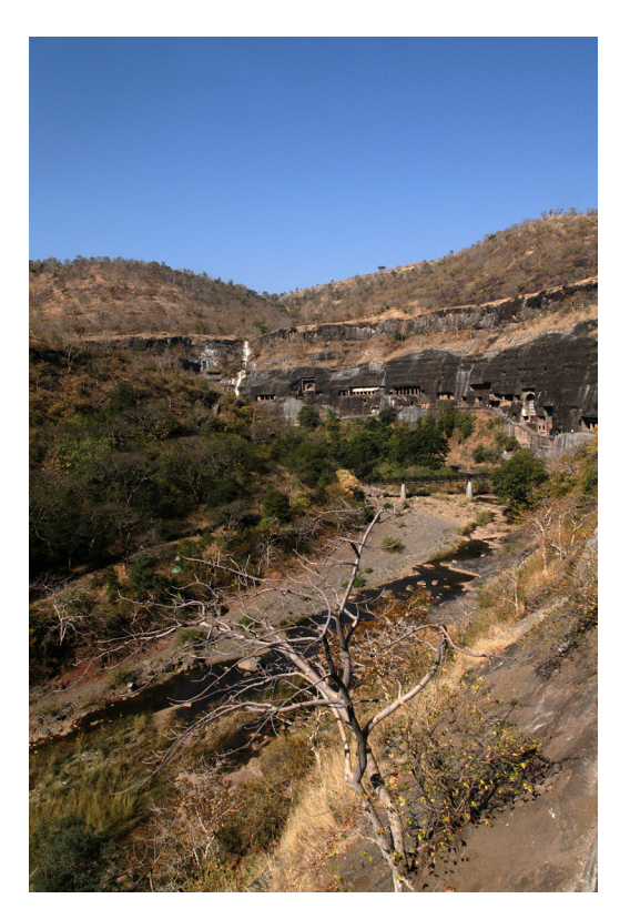
Fig. 1 The rock-cut complex of Ajanta