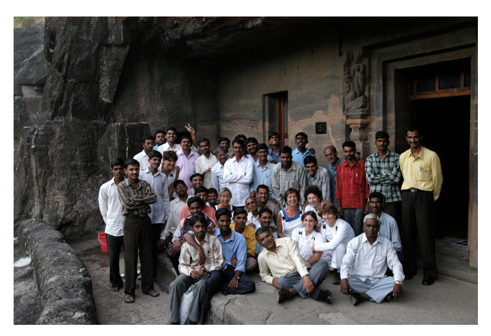
Fig. 2 Ajanta, the Italian team with the Indian technicians, ISCR Photo by Edoardo Loliva