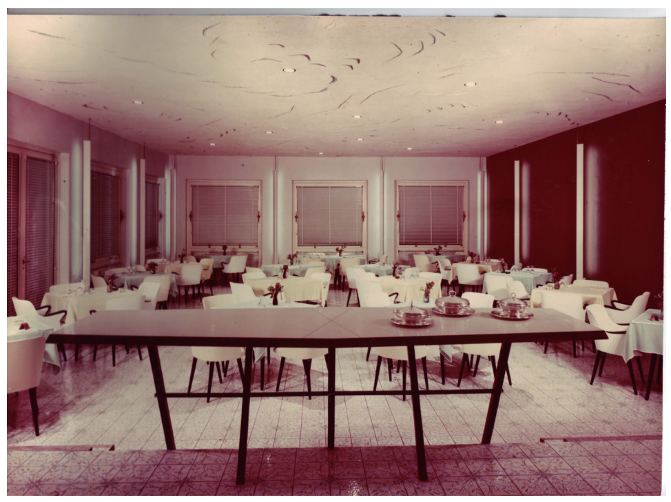
Fig. 6 Lucio Fontana, Soffitto, 1956, Hotel del Golfo, Procchio, Isola d'Elba, historical photograph

presented by the original reinforcement of the supporting structure as well as the dimensions and weight of the panels required in order to facilitate their future transport. In the initial phase of planning, during which restorers, architects and structural engineers were all involved, graphic reliefs, both photographic and photogrammetric, were carried out so as to create a computerised model that could be used in the simulation of the various stages of the detachment process.