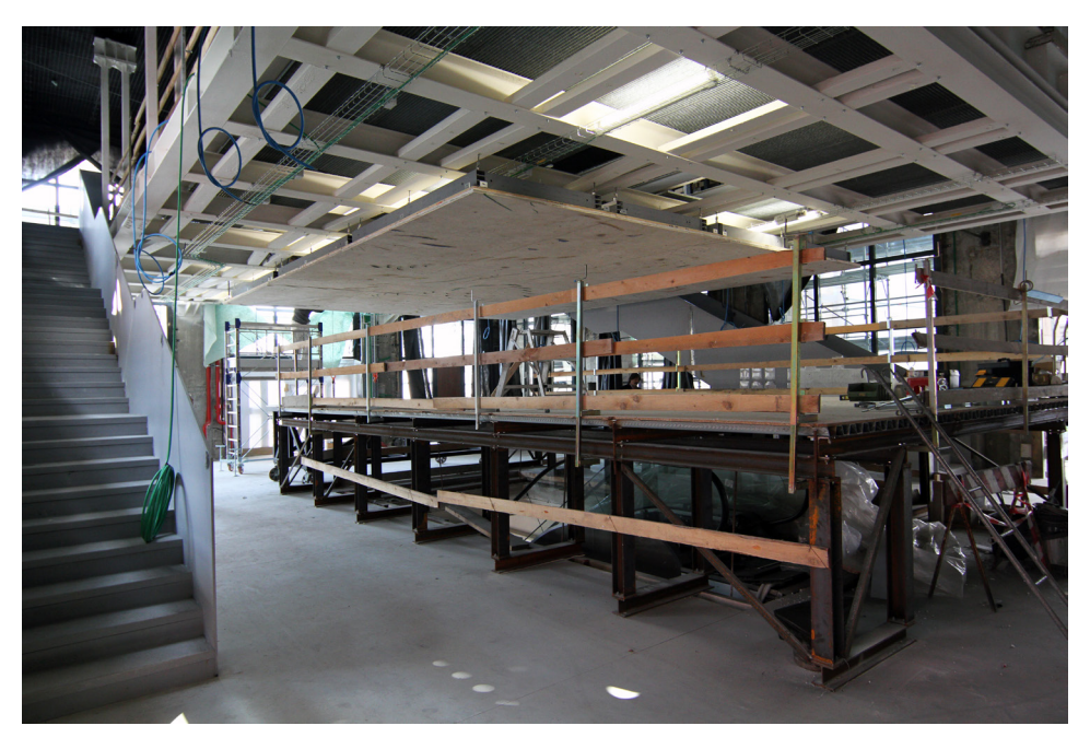
Fig. 8 De Lonti Daniele, Lucio Fontana, Soffitto , Museo del 900, Milan, 2010, photographed during assembly, Courtesy of Fondazione Lucio Fontana