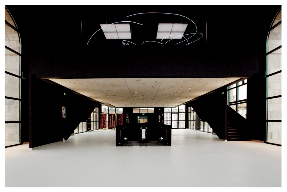
Fig. 7 Lucio Fontana, Soffitto, Museo del 900, Milan, 2010.

Once loaded onto trailers, in which scaffolding structures had been purposely erected in order to sustain the panel supports, the panels were transported to Milan where they were placed in a temporary laboratory in Palazzo Litta, the Regional headquarters of the Department for Cultural Heritage. Here, the restoration of the surfaces was started. Each panel was turned over and positioned on a mobile structure that facilitated not only the removal of the facing gauze, and the cleaning, consolidation and reintegration of the superficial paint layer, but also the realignment of the panels in order to simulate the final reconstruction of the work. In order to avoid physical stress on the panels during their repositioning, appropriate metal structures were created, allowing for the panels' rotation to be carried out in a suspended position.