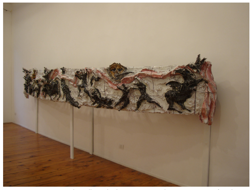
Fig. 4 Lucio Fontana, Battaglia , Galleria Claudia Gian Ferrari, Milan, 2010

The bas-relief, purchased by Fondazione Prada, is now displayed at the foundation cinema, but not in the screening room. Furthermore, the supporting structure that followed the original curve of the wall behind the cinema screen was replaced with a new structure that anchors the bas-relief parallel to the wall. Thus, although once again in a cinema, it has lost its original function. During the cleaning phase, we unexpectedly discovered that some sections were originally painted with fluorescent colour, such that when the lights went out, "Battle" was lit up by Wood's lamps interacting with the fluorescence. (Fig.5) Thus the work carried out on this environment gives witness to the fact that Fontana, a year before his famous environment with black light at the Naviglio Gallery, had already used this new medium in an artistic sphere. Unfortunately, there are few remaining traces of this fluorescent colour, both due to their natural deterioration and probably to cleaning operations carried out on the surfaces, due to ignorance of the presence of these very delicate areas painted after the firing.