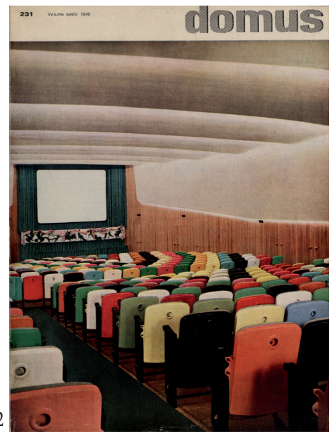
Fig. 1 Cinema Arlecchino. In: Domus , no. 231, vol. VI, 1948, p.18, Courtesy Domus Fig. 2 Projection room at Cinema Arlecchino. In: Domus , no.231, vol. VI, 1948, cover, Courtesy Domus