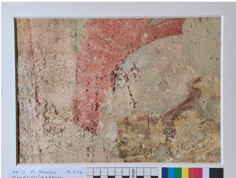
Fig. 5 Frankfurt, St. Mary's Church, Apocalyptic Virgin, reference photo, 2016; Photo: Mechthild Noll-Minor