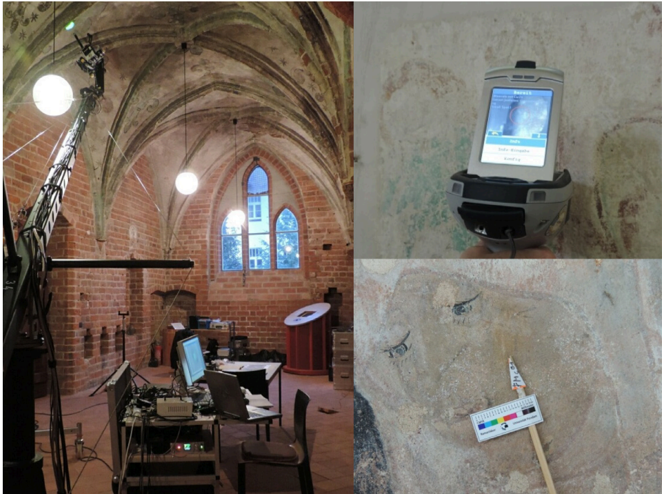
Fig. 7 Angermuende, sacristy; Chorin, monastery and Frankfurt (Oder), St. Mary's church, investigation by Raman spectroscopy and mobile XRF, 2016; Photo: Martin Ziemann

Using this relatively complex and somewhat time-consuming method to build a basis serves to ensure high quality monitoring, thereby facilitating resource-saving and sustainable cultural heritage conservation. Instead of striving for large-scale, far-reaching conservation interventions, the aim is to perform regular controls and implement small-scale conservation measures to minimize material, financial and professional costs and reduce the strain on cultural heritage as much as possible.