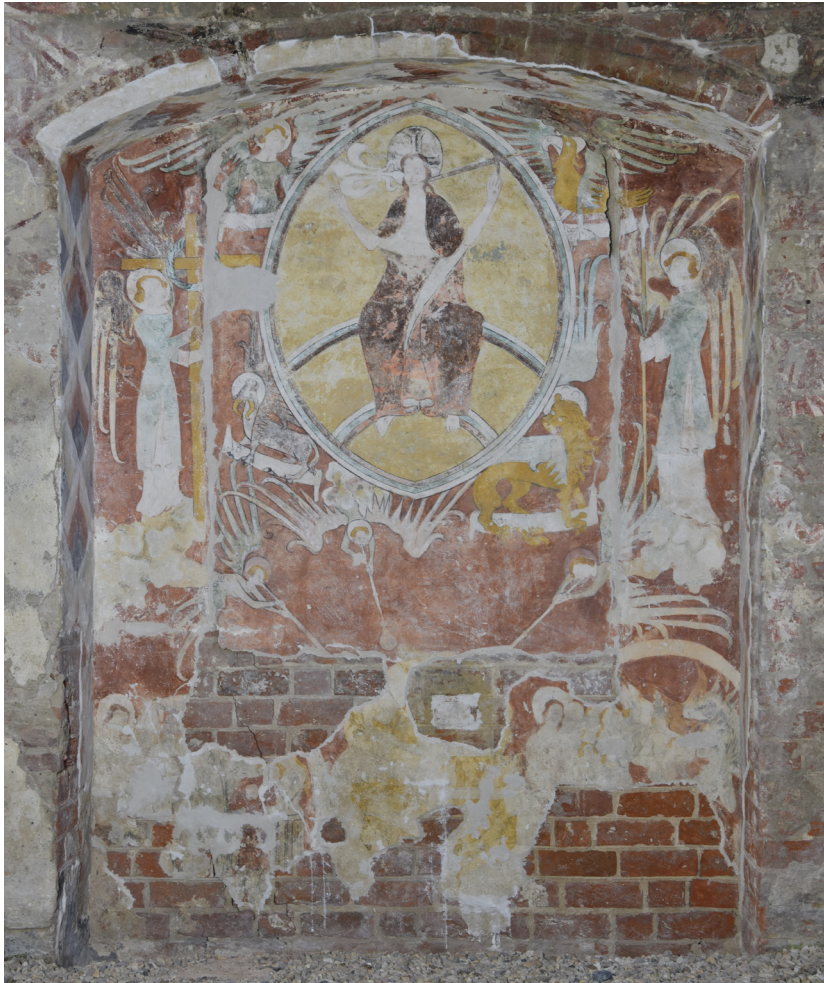
Fig. 6 Brandenburg, St. Johannis, Christ as the Pantocrator (judge of the world), 2016

These studies are carried out in cooperation with the Potsdam University of Applied Sciences , the University of Potsdam and the Bremen Institute for Materials Testing (MPA) using complementary analytical techniques including X-ray Fluorescence (XRF), polarization microscopy, Scanning Electron Microscope coupled with Energy-dispersive X-ray spectroscopy (SEM/EDX) and Raman spectroscopy (Fig.7). Such background knowledge is a prerequisite for a more in-depth characterization of changes in paint and plaster layers, providing insights into possible mechanisms of deterioration and enabling the evaluation of risks to the wall paintings and architectural fabric as part of a monitoring program. These studies also helped to identify a range of reference areas selected for long-term monitoring, which can be used for repeated condition assessment over time. For selected objects, it was possible to carry out in-depth graphic documentation of extent and condition in connection with conservation measures, at times with the support of research undertaken by students.