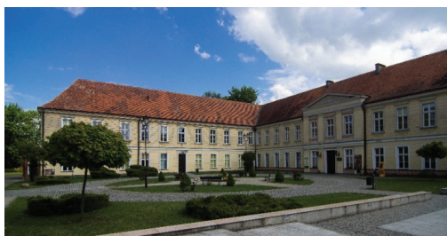
Fig. 3 Trzebiatów. The palace, originally a monastery, now the seat of the Trzebiatów Cultural Center