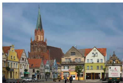
Fig. 4 Old Town Square in Trzebiatów, in the back of the church of the Motherhood of the Blessed Virgin Mary

Within the boundaries of the proposed entry there are 40 monuments entered individually into the register, among which there are: the Church of the Motherhood of the Blessed Virgin Mary (Fig. 4), city fortifications, chapel of the Holy Spirit, town hall, palace, bourgeois houses and tenement houses, seventeenth-century graffiti on the facade of the tenement house at the market, monuments of technology: hydroelectric power plant and farm mill. In addition, there are more than 100 objects protected by the municipal register of monuments.