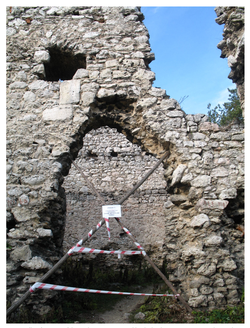
Fig. 5 Bydlin, fragment of the castle ruins - perceived by the landowners as a security threat