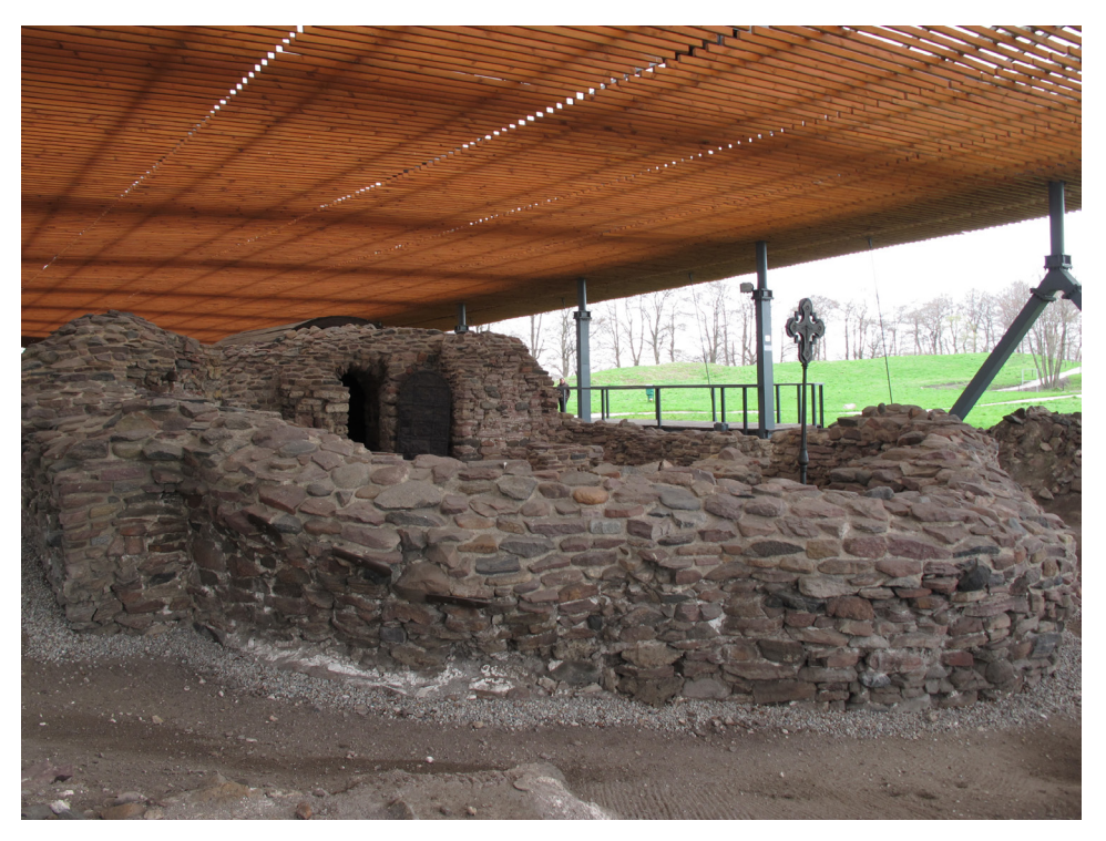
Fig. 2 Ostrów Lednicki - a testimony of history - ruins associated with the beginning of Polish statehood

From the doctrinal take, ruin is perceived as a full-fledged historical monument representing autonomous values<sup>9</sup>. The Romanticist tradition has yielded a positive aesthetic evaluation of ruin and a thoughtful attitude to its form or shape. It can be said that the sources of respect towards ruins are even deeper: they are grounded on what is essential about the Mediterranean culture which sprang out of the ruins of the Greek and Roman civilisation. It is already in the ancient Rome that we can point to instances of appreciation of Greek edifices impaired by time – like, for instance, in Pliny's letters from the first century AD<sup>10</sup>. The subsequent reveals of the Renaissance and the Classicism would not have been possible without the fondness on the beauty and might of ancient ruins. Hence, we can unhesitatingly conclude that positive perception of ruins is backed with a long cultural tradition and is confirmed by the development of the restoration doctrine. All the same, the issues of protection and handling of monuments referred to as 'permanent ruin' still remains one of the leading topics in the ongoing doctrinal discussion. On the Polish soil, the scale and thematic scope of the discussion has been determined by the publication series of the Polish ICOMOS National Committee<sup>11</sup>. A role of importance in this