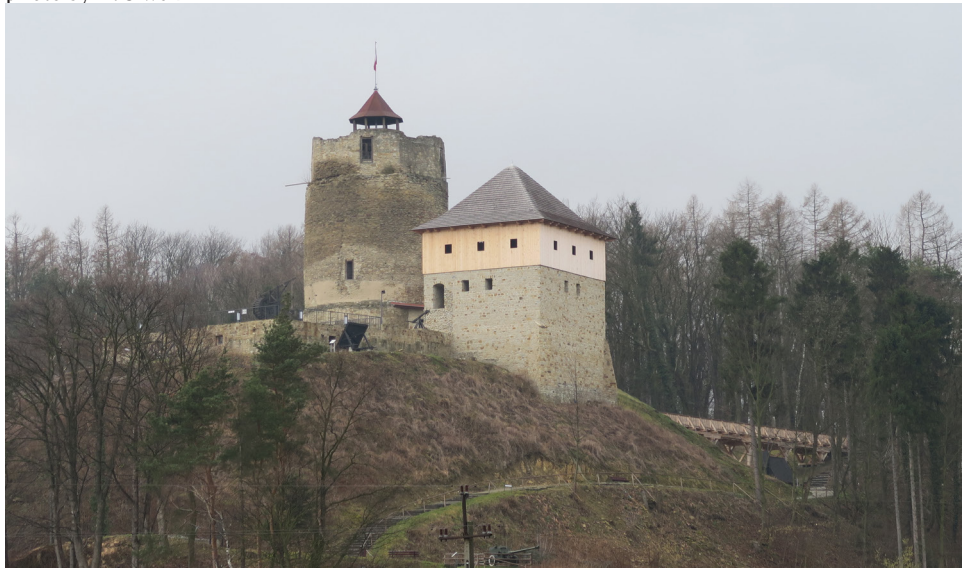
Fig. 4 Czchów - doubling of the castle's cubature as a result of reconstruction initiated by the local government, photo: A. Siwek