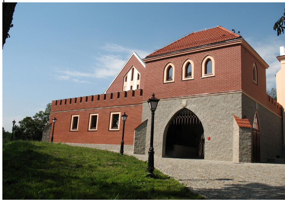
Fig. 3 Gostynin - a historical reconstruction of the castle on the initiative of the local government

(or, should) endeavour to eliminate such response; namely, to replace the ruin with a 'real and complete monument' that would assume useful or useable functions of importance to the local community. (Fig. 5) In case that the local community can see no public interest in the maintaining a permanent ruin, the conservator is put in a weak position and has to seek gaps in the imposed doctrinal restrictions.