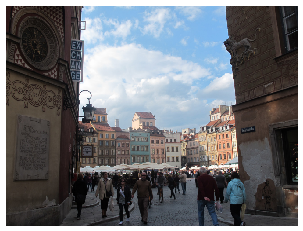
Fig. 6 Warsaw, Old Town - an example of reconstruction of exceptional social and historical significance

It can thus be stated that the entire post-war period was one of affirmation and praise of the Rebuilding/Reconstruction/Restoration project. There was no room at the time to subtly semantically differentiate between 'historical ruin' and 'wartime ruin'. Reconstruction or restoration was the state's driving force. Monuments or structures remaining in ruin put the area's hosts in a bad light, causing shame to them<sup>25</sup>. After the year 1989, in the period referred to as transition, the role of the state as the initiator of restoration/conservation projects temporarily weakened. The initiative was taken over, in a number of cases, by the new – now, private – proprietors of historical areas, buildings and edifices. Negative attitude towards ruins became combined with commercial and use-oriented needs in respect of individual buildings/ structures.