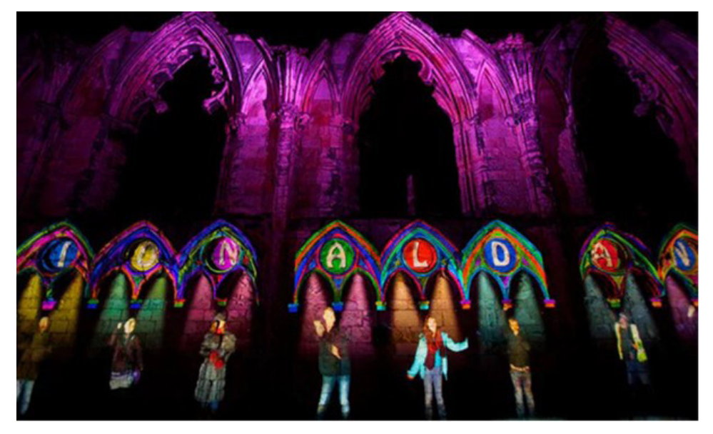
Fig. 4 Light show projected onto the ruins of Saint Mary's Abbey, York (England)

project, guided by a historical-critical and aesthetic analysis, as well as by the principles of conservation, should provide solutions respectful of the values, both tangible and intangible, of places. The restoration and re-use intervention must be distinguishable, in a discrete and controlled manner, with respect to the previous construction phases of the historical ruined site. Furthermore, the materials used for the restoration and re-use intervention should preferably be eco-sustainable and possess physical-chemical and aesthetic requirements compatible with the existing materials, as well as being durable over time. Plant and technological adaptation must be included in the rigorous national regulatory framework and tend to pursue the current standards of comfort and safety. Solutions that are possibly non-intrusive should be found, considering the use of modern technology too.