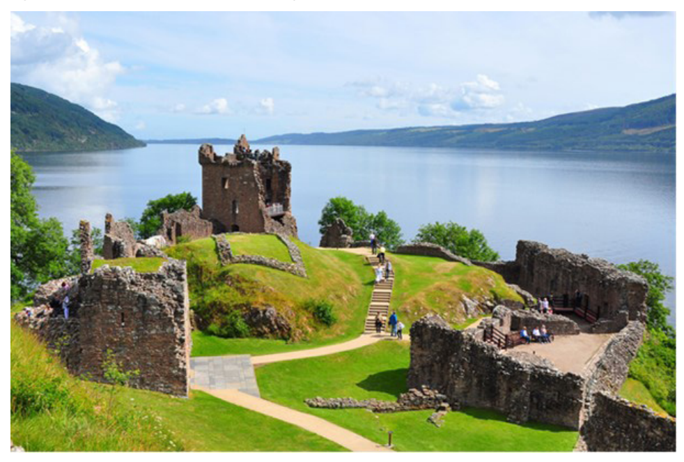
Fig. 2 Castle of Urquhart in Scotland, currently used as site-museum

Finally, some general examples of potential new uses are provided which are compatible with the main typologies of medieval ruins spread throughout Europe (fortified buildings, religious buildings, town walls, residential buildings, etc.).