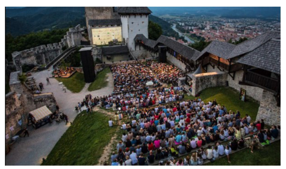
Fig. 3 Stage performance, Old castle Celje, Slovenia

Sustainable re-use, preservation and modern management of historical ruins. RUINS' tools & guidelines 121