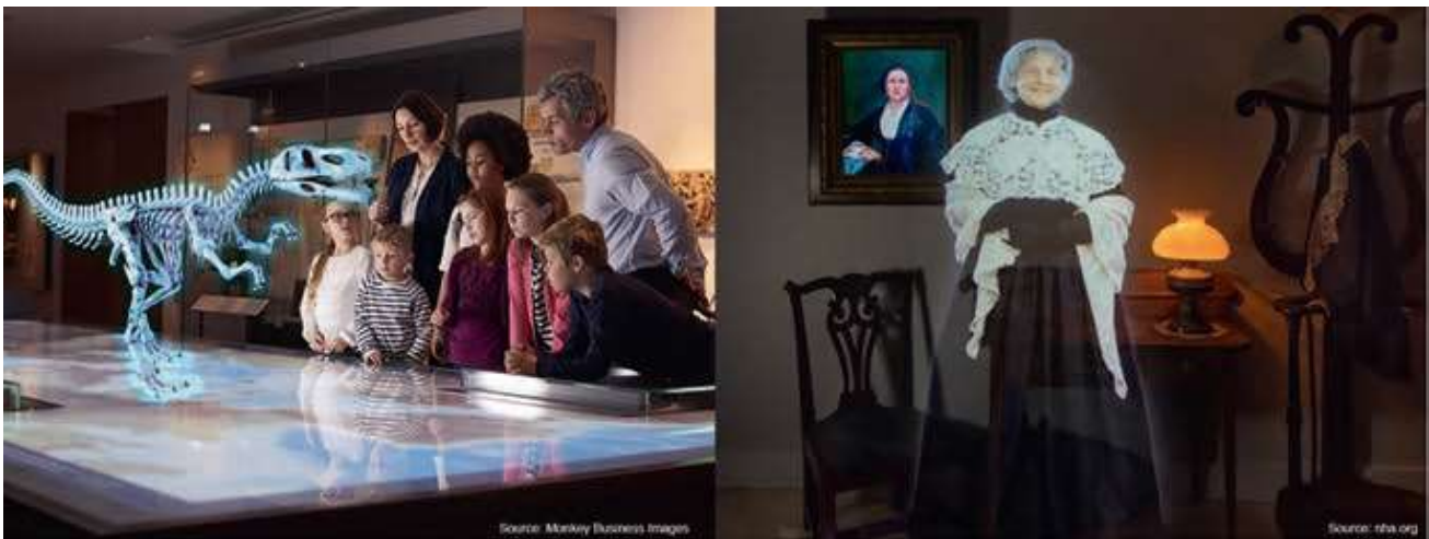
Fig. 5. Holograms in museums.

reality superimposed on a reconstruction of the past, accompanied with audio and video guide. An example of this is the solution implemented in the Roman archaeological park in Brescia 7 (fig. 4). This case proves how new technologies and targeted narrative techniques can play a crucial role in improving access to cultural heritage access and facilitating its appropriation. Holography is another effective tool for boosting learning through interaction and public engagement, especially when combined with narrative components and compelling animations. Although it is still scarcely used in museums due to high cost and complexity of implementation, three-dimensional images produced using this technique can replicate reality and produce fictitious representations thanks to optical illusion. Holograms can produce three-dimensional representations and animations of objects that were destroyed or lost, as well as archaeological findings, people, documents and other traces of the past 8 that are no longer visible (fig. 5).