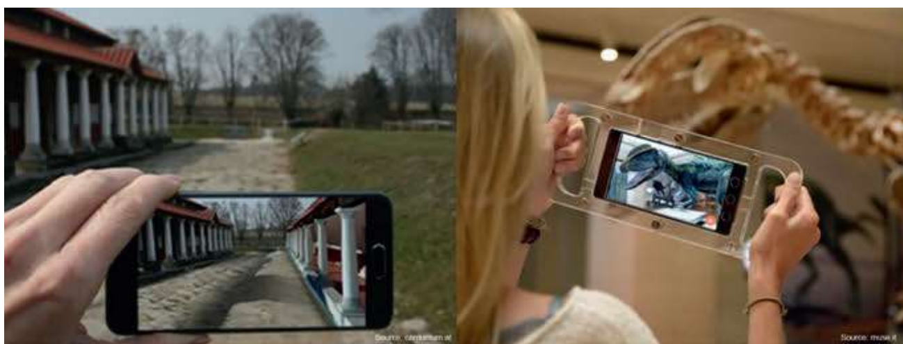
Fig. 2. Archaeological Park of Carnuntum (left), MuSe of Trento (right).

dimension with infinite possibilities and applications while keeping the real world at the centre. AR is undoubtedly the fastest growing technology of this type. It is implemented in many museums and archaeological sites thanks to its ease of use. For example, it can virtually reconstruct buildings that are now partially or totally destroyed, bring extinct animals back to life 3 , recreate ancient battles, or digitally restore precious paintings (fig. 2). Together with narrative techniques, AR can also bring heritage sites and events to life rationally and emotionally during tours. 4 Last but not least, among the applications of AR in museums we find video games 5 , which can stimulate the public, especially children and adolescents, and incentivize them to learn about culture. 6