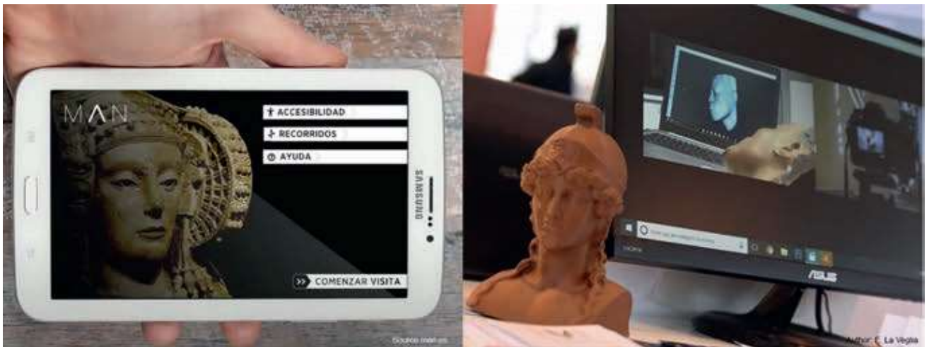
Fig. 6. Audio guide from MAN Madrid (left), use of 3D digital models in an archaeological museum (right).

One example of this is the multimedia guide and app at the National Archaeological Museum of Madrid 9 (fig. 6, left). Both offer a general tour of the museum, including audio commentary, images and videos with subtitles. They also suggest specific itineraries for people with visual impairments and link to videos with information in sign language. While traditional audio guides allow the user to listen to information and stories, new multimedia devices allow for much greater interaction, supporting and engaging different audiences that range from the youngest to the disabled.