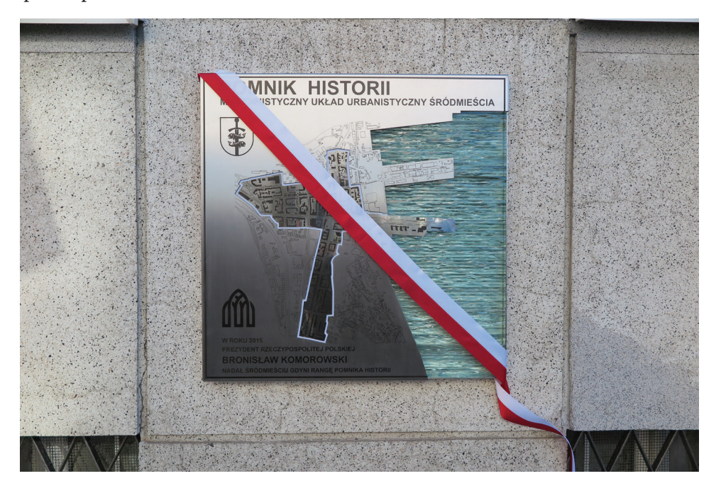
Fig. 1 Information board on the Gdynia City Hall building on Świętojańska Street, commemorating the status of the Monument to History, project: Marek Kaliński

Gdynia - Wojciech Szczurek. A commemorative plaque was also unveiled on the building of the City Hall of Gdynia, which shows the area considered to be a Monument of History and has a significant educational value (Fig. 1). Hundreds of people took part in the event. Special guidebooks on the new Monument of History were also published. An urban ensemble within the limits analogous to the borders of the entry in the register of monuments was declared a Monument of History (Fig. 2). It is therefore an area where three different forms of protection are in force: entry into the register of monuments, monument of history and local spatial development plan.