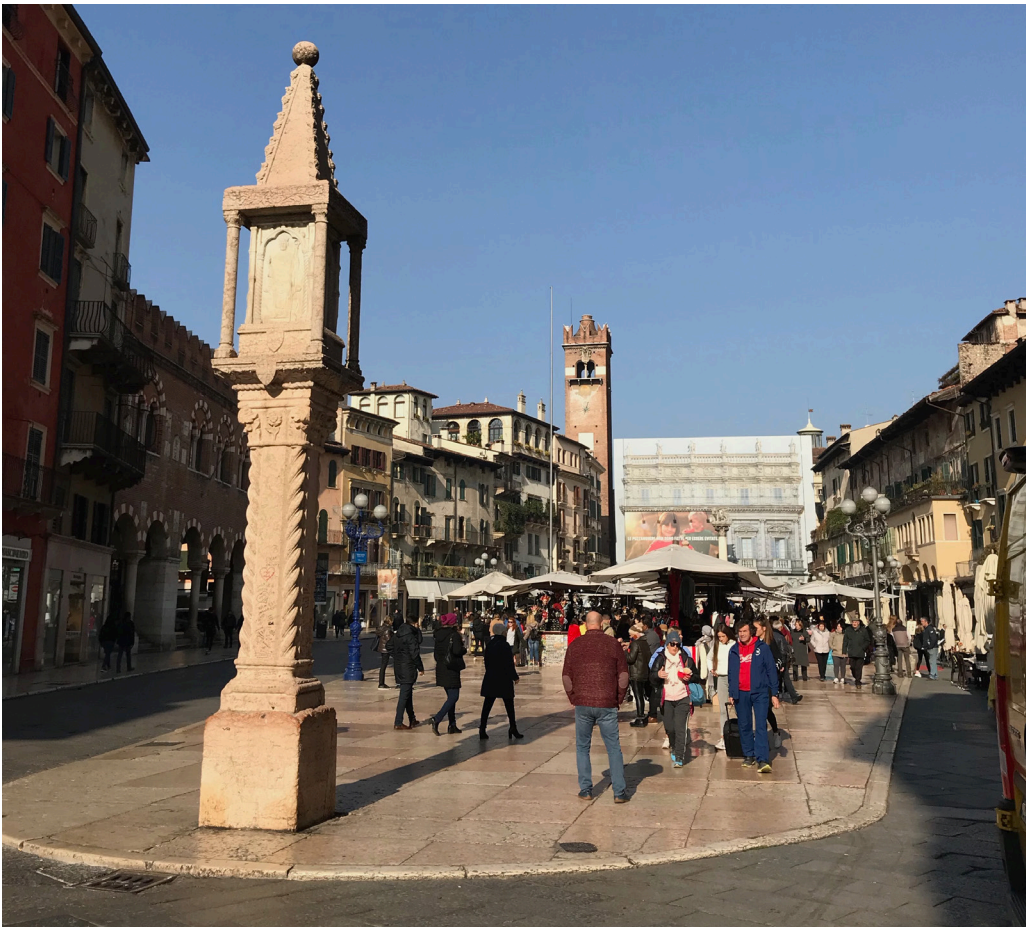
Fig. 4. Piazza delle Erbe, Verona

The above metaphor of collage dates back at least to the 1970s, when the failures of modernist urbanism were becoming increasingly evident, most obviously in Colin Rowe and Fred Koetter's seminal book Collage City ([1978] 1993). Strongly critical of modernist urbanism, they speak of a "solid-void dialectic" and a "crisis of the object," suggesting that "it might be judicious, in most cases, to allow and encourage the object to become digested in a prevalent texture or matrix" (Rowe & Koetter [1978] 1993, 83). Indeed, they frame their discussion as an appeal "for the joint existence of [...] the private and the public, of innovation and tradition, of both the retrospective and the prophetic gesture" ([1978] 1993, 8). The relation of figure and ground can thus be seen as critical to the shaping of competing urbanisms, and thus also to the conservation of historic public spaces.