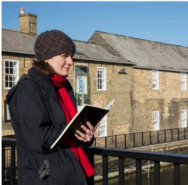
Fig. 1. Cover of Understanding Place (Historic England 2017a)

Understanding Place (Historic England 2017a; fig. 1) is a separate document that defines Historic Area Assessment (HAA) and outlines how to carry one out. HAAs are a practical tool developed to establish the character of a historic area, often in anticipation of proposed redevelopment; the opening summary states that their purpose is to help planners, developers, communities and heritage professionals, among others, in “understanding how the past is encapsulated in today’s landscape, explaining why it has assumed its present form and highlighting its more significant elements” (Historic England 2017a, II).