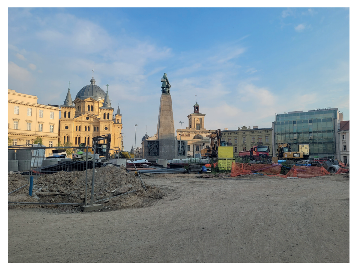
Fig. 4. Manufaktura Square

After the Second World War, the reconstruction of the square was continued. For example, a monumental theater was built, dominating over this part of the city. A representative yet lively space was created, with a fountain, greenery and benches. In addition, a large transport hub was organized at one of the square's frontages.