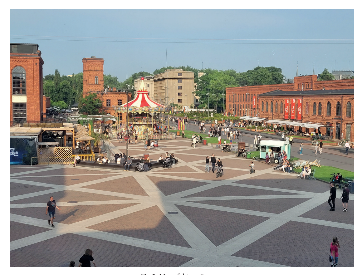
Fig.3. Manufaktura Square.

After WWII Łódź had no main square, unlike other cities in Poland. The heart of the city was located in the northern section of Piotrkowska Street. In this light, the spontaneous creation of the Manufaktura Square can be regarded positively. On the other hand, it is worth remembering that this is in fact private space, created by a private investor. It thus constitutes another