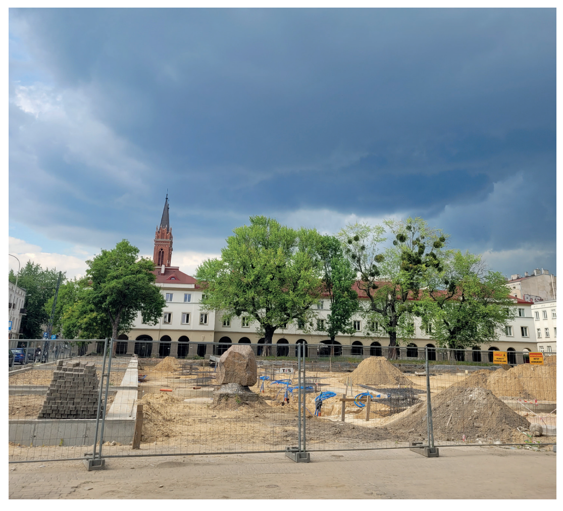
Fig. 1. Old Town Market.

300 meters west of the Old Town Square, in the valley of the Łódka River, the nearly thirtyhectare area housed a factory complex with its own gasworks, fire station and railway siding. The owner's palace (today the Museum of the History of Łódź) and some office buildings were built in the south-eastern part. To the south of the factories, quarters of worker houses were constructed (Stefański 2001). It was in fact a city-within-city situated just west from the Old Town. After 1945, the factory was nationalized and operated until 1997, becoming one of the largest textile factories in Poland. However, the fall of communism also led to the collapse of the entirendustry in Łódź. Today, abandoned and decaying post-industrial areas have been designated for transformation as part of one of the largest revitalization projects in Europe. Nowadays, the complex has an area of approximately 27 hectares and includes a shopping center, restaurants, museums, cinemas, fitness clubs, etc. Although the center is a modern construction, certain nineteenth-century, historic, post-industrial buildings have been