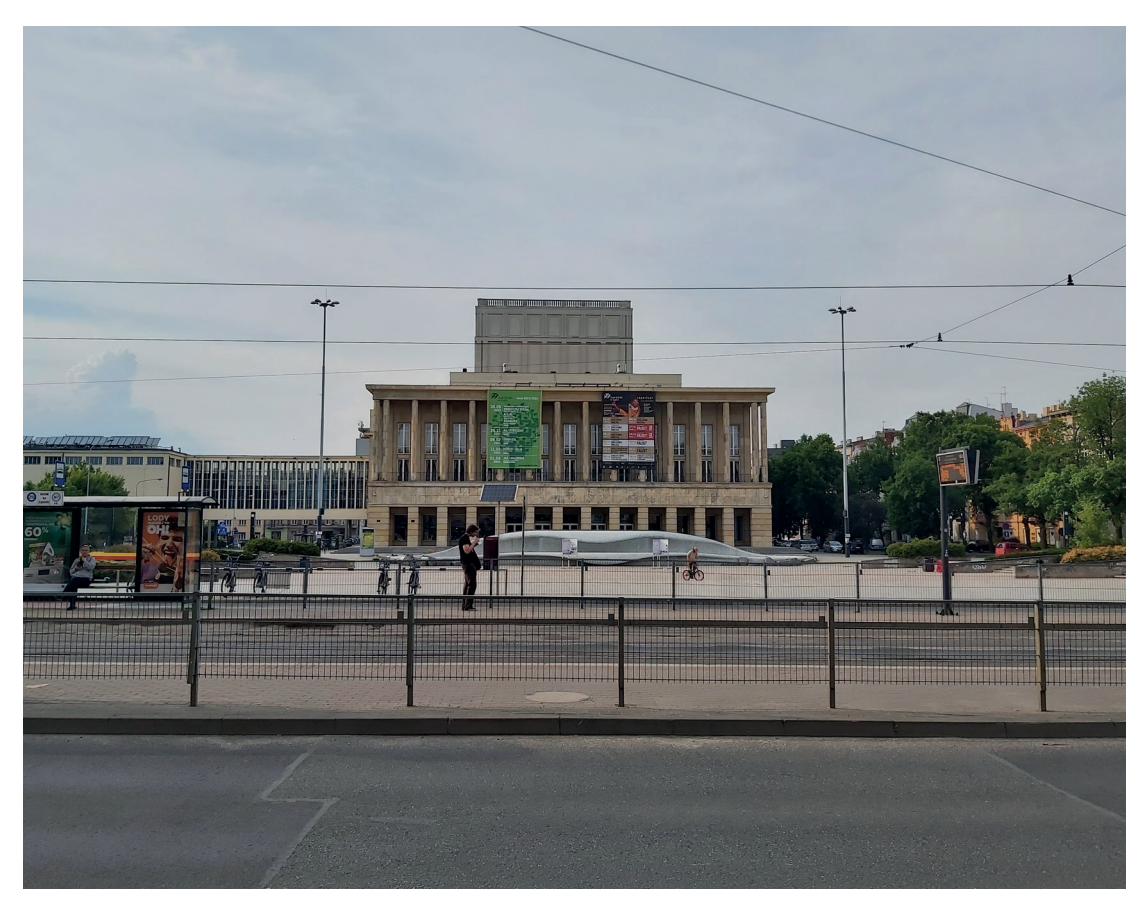
Fig. 5. Dabrowski Square.

differ only in the volume of vegetation. In an online vote, held between 16 and 27 December 2022, residents chose the greenest concept<sup>8</sup> (fig. 5).