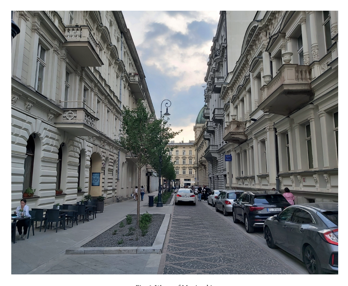
Fig. 6. Woonerf Moniuszki.

have been positive, the funds helping to move traffic out of city centers, restore historical objects and monuments as well as introduce more greenery.