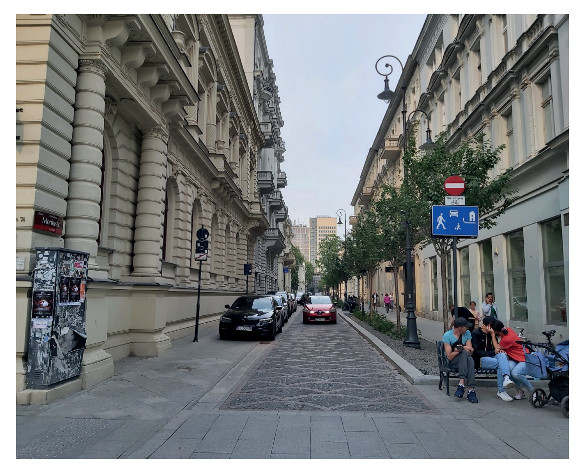
Fig. 7. Woonerf Moniuszki.

planners, architects and art historians notice the risks involved and publicize this issue. Some of the legal regulations could be also amended. In view of these emerging trials, revitalization processes will certainly challenge experts in the near future, demanding serious discussion.