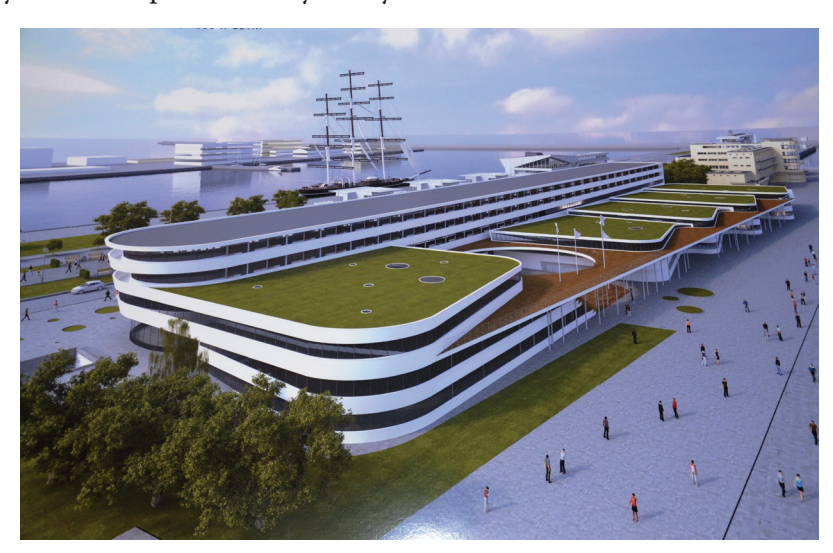
Fig. 5 One of the four entries for the "Nowa Marina in Gdynia" closed competition from 2014, clearly showing that the long, 190-metre four-storey frontage along Jana Pawła II Avenue, designed in accordance with the current local plan of the area, is a complete mistake and does not fit the landscape layout of the Southern Pier

It should also be emphasized that the current local development plan does not formulate any indications concerning the temporary development of the entire area of the South Pier – shoddy gastronomy outlets and various advertising and exhibition installations - which is being developed on a massive scale in the entire area of the South Pier. These objects, theoretically temporary, are still unpleasant, daily reality of the area.