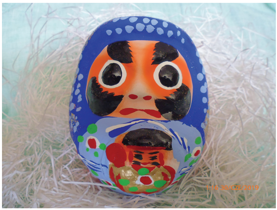
Fig. 12 The paper pulp figure of blue bearded Daruma with bushy eyebrows and big eyes is a typical souvenir from Sendai - an amulet to guard the prosperity of the whole family and household.

Fifty such different cultural and natural heritage sites are connected by a single narrative about the historical figure of Masamune Date and his achievements, the cultivation of tradition by his successors and the results of today - isn't this an example of Beautiful Harmony... After all, since May 1, 2019, the Japanese Empire has been in the era of Reiwa<sup>17</sup>. Certainly, it is a kind of Japanese Monument of History.