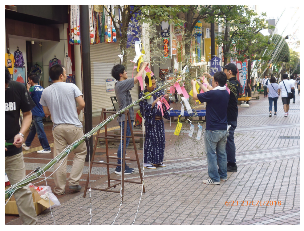
Fig. 9 Sendai, preparing the decoration for the Tanabata festival; attaching colourful strips of paper with written greetings to the top of a bamboo branch.