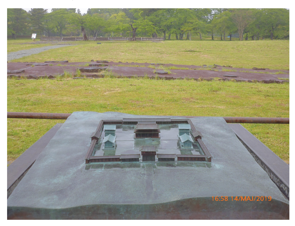
Fig.5 Tagajo, a historic site of the 8th century castle. - In the foreground there is a metal model showing the phases of the development of the complex, then the reconstruction of the base stones of the column gate structure, in the distance there is a foundation platform of the main building with a similar arrangement.