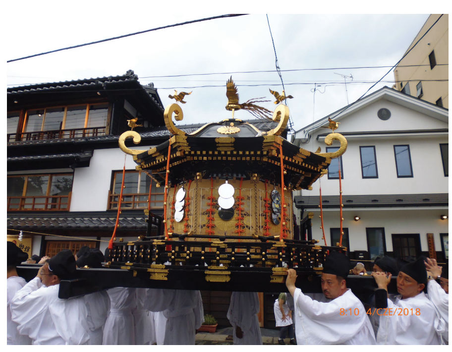
Fig. 10 Shiogama, city procession with a portable mikoshi chapel at the annual Minato Matsuri festival in 2018.