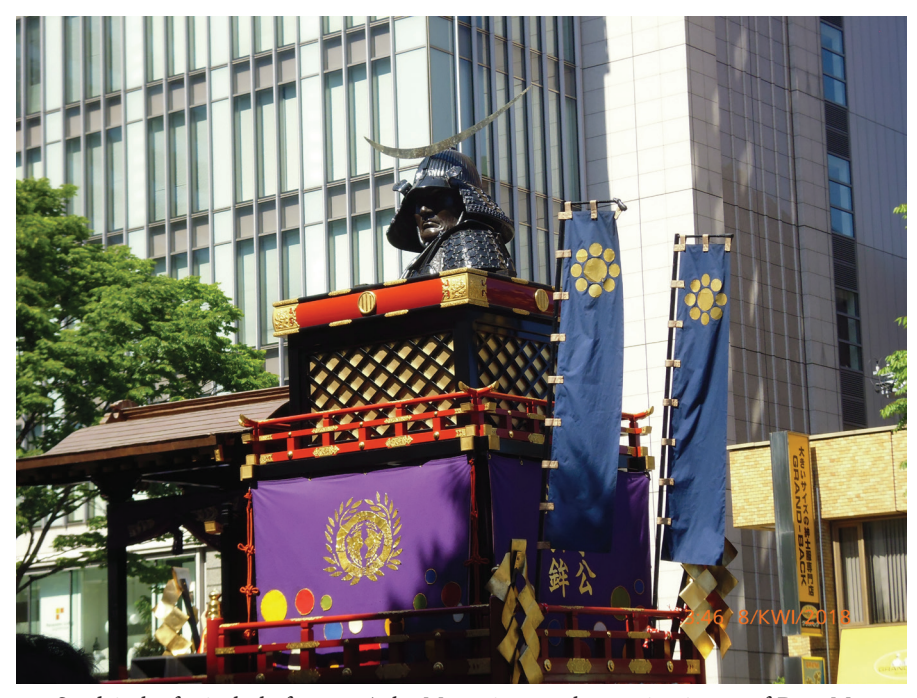
Fig. 11 Sendai, the festival platform at Aoba Matsuri 2018; the moving image of Date Masemune floats and greets the audience with the sound of fanfares; below, against the violet background is the Date family monogram "Two Sparrows and a Bamboo", and on the blue pennants there is Kuyo-mon symbolizing 9 planets of Buddhist cosmology that affect nature and human destiny.