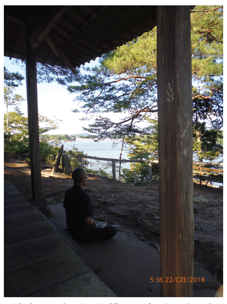
Fig. 7 Oshima Island in Matsushima Bay, a Buddhist priest from Zuiganji's temple immersed in meditation at the forefront of the archaic pavilion.