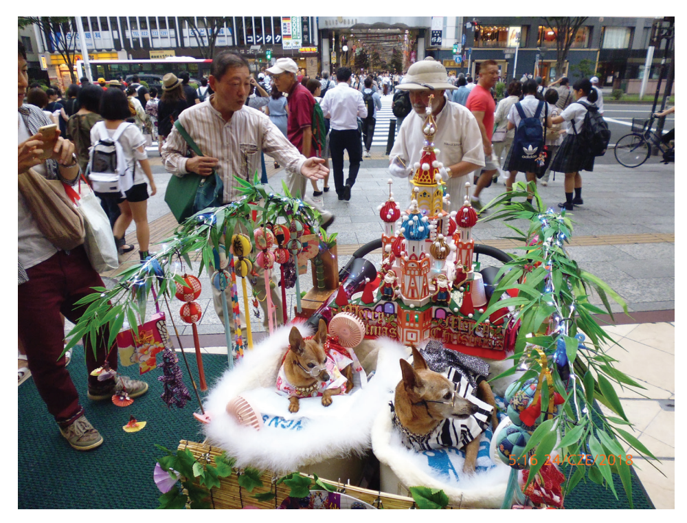
Fig. 14 Sendai, an individual version of the celebrating the Tanabata festival; a local joker placed two dressed up dogs on a moving platform made of a pram and decorated it with bamboo twigs with hanging mini lanterns, and in the back he positioned a miniature of a building reminiscent of a nativity scene from Krakow (Szopka).

PS. The author would like to thank Yukie Kumasaka and Mayumi Kikuchi for their help in organizing the stay in Matsushima, and Masumi Horino, curator of the Zuiganji Temple Museum, for giving permission to photograph the interiors of the temple and museum exhibits.