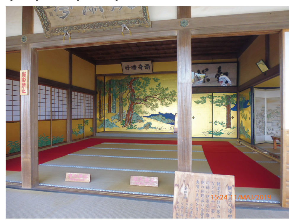
Fig. 4 Matsushima, Kanrantei teahouse pavilion, moved from Kyoto by Tademuna, the second ruler of Sendai, serving as a villa for guests to observe the waters of the Gulf and the moon.