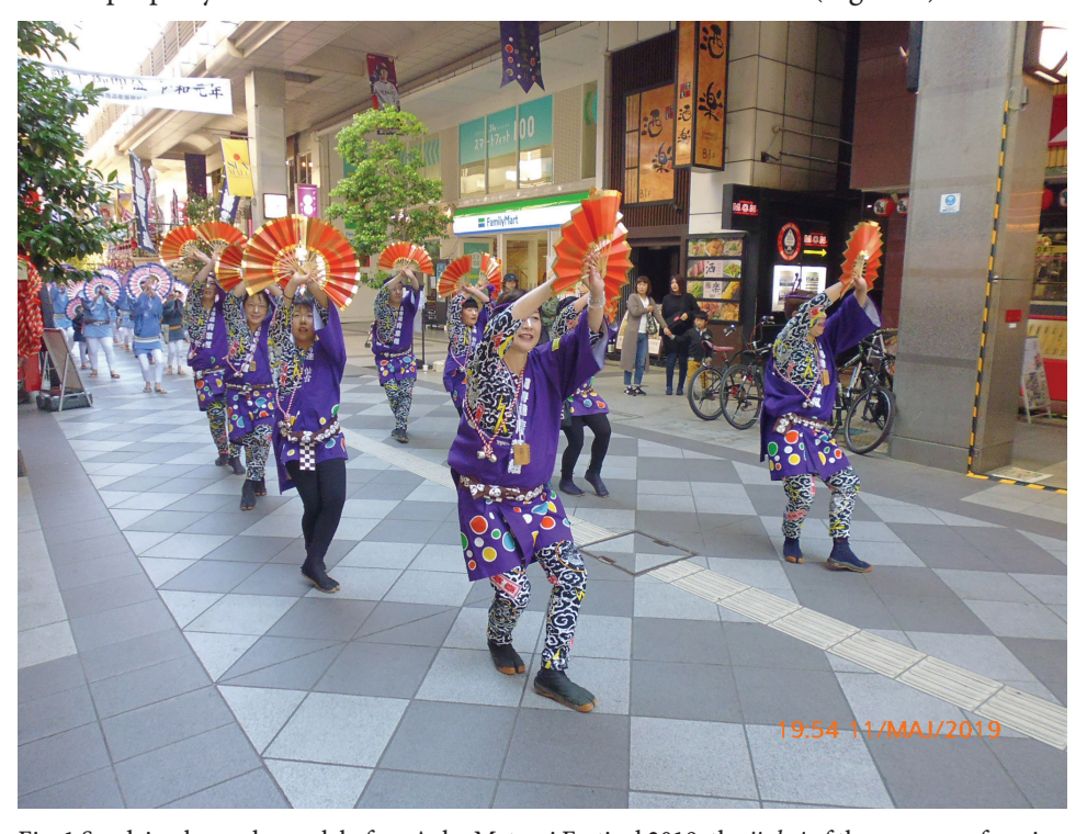
Fig. 1 Sendai, rehearsal a week before Aoba Matsuri Festival 2019; the jinbei of the group performing the Suzume-Odori dance is inspired by the purple jinbaori coat of Date Masamune (cf. figure 2).