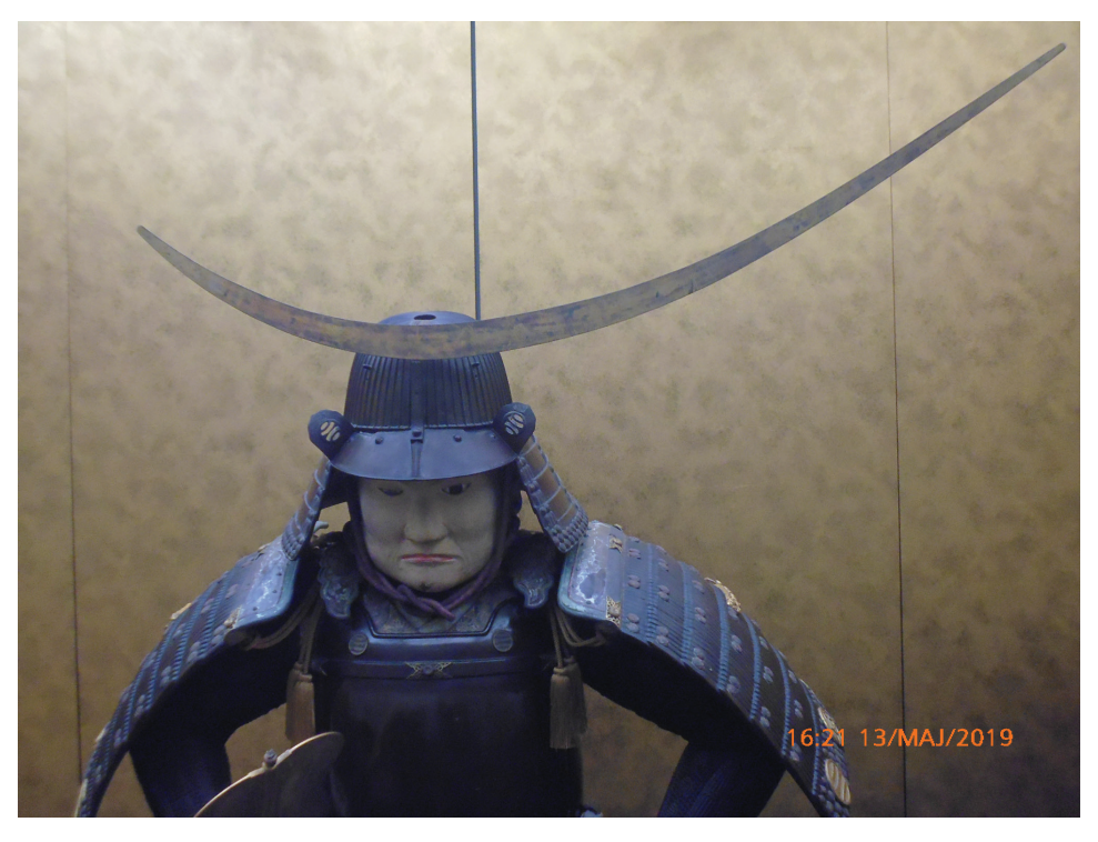
Fig. 2 Matsushima, Zuiganji Temple Museum, a wooden sculpture of a figure of Date Masamune sitting in armour, from 1652, depicting him in a helmet with his favorite gold-plated half-moon maetate ornament.