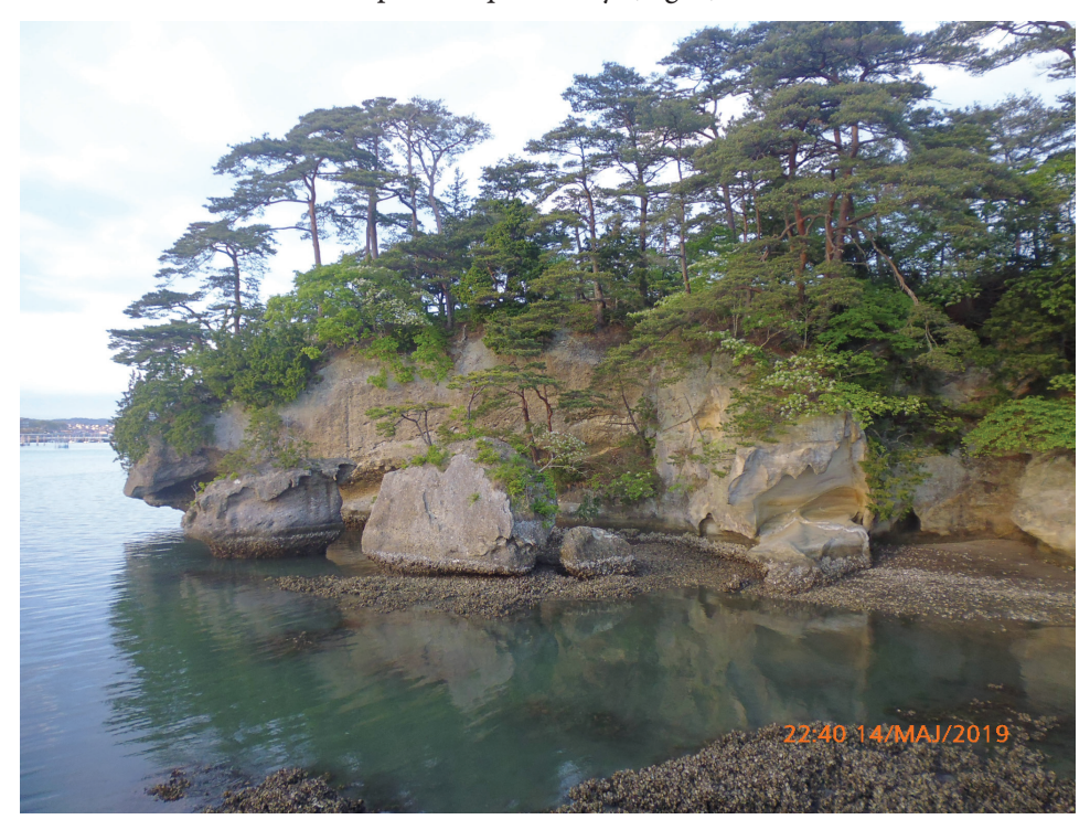
Fig. 8 Fukuura Island in Matsushima Bay; the low tide reveals an irregular outline of the rock and oyster habitats for which the site is famous.

34. The landscape of Matsushima Bay is one of the three most beautiful landscapes of Japan according to Hayashi Gahō (1618-1688), a neo-confuscianist and head of government education. The entire coastline of the bay and 262 islands constitute a place - this time very extensive one with an area of 9717 hectares - of picturesque beauty. (Fig. 8)