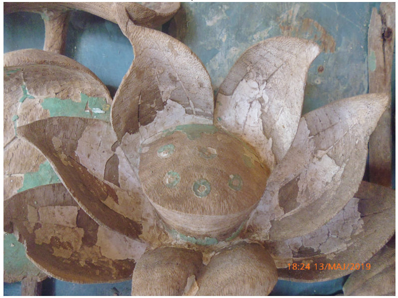
Fig. 3 Matsushima, Zuiganji Temple, Lotus Flower - carving decorative detail of the Sanctuary door after conservation.