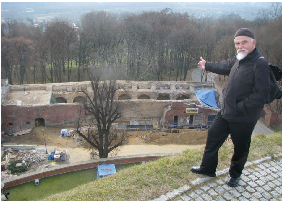
Fig. 5 Curtain after the trees have been cleared and the soil has been removed.