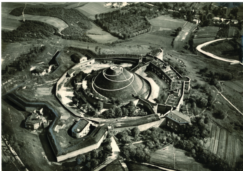
Fig. 2 Mogiła Kościuszki and Fort "Kościuszek" from the bird's eye view from the west side.