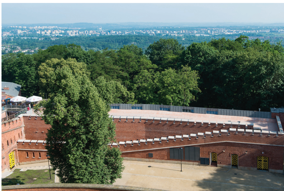
Fig. 6 Curtain after renovation. Collection of the Kościuszko Mound Committee