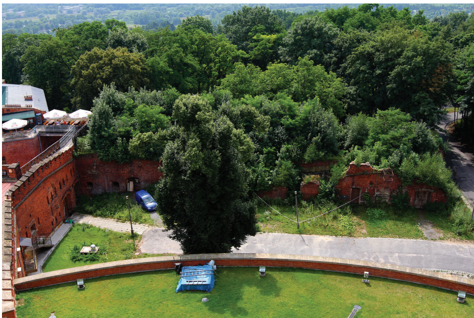
Fig. 4 The Curtain before conservation and adaptation renovation. Collection of the Committee of Kosciuszko Mound