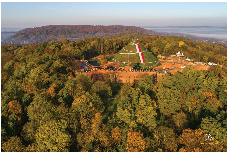
Fig. 9 This is what the Kosciuszko Mound looks like on national holidays and solemn days.