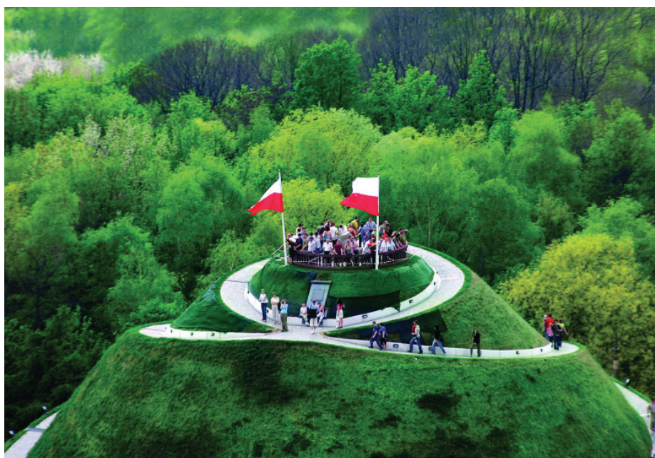
Fig. 10 The top of the Kosciuszko Mound on a weekday.