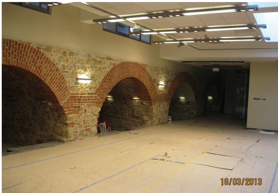
Fig. 7 A fragment of the Curtains's interior in the process of renovation.