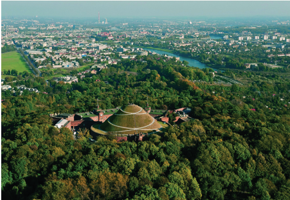
Fig. 3 Kosciuszko Mound has been overgrown with self-seeded forest for over half a century.