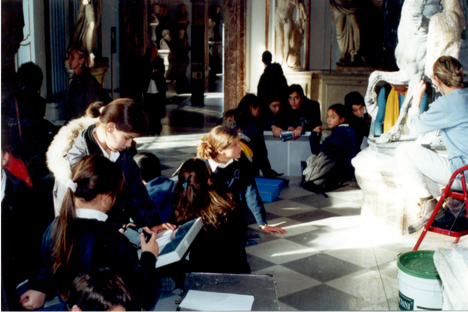
Fig. 7 2000-2002: Conservation Project “Aperto per Restauro”, Centauri Capitolini. For the first time the schoolchildren were asked to take part in a competition, taking the conservation project as their starting point

We also organised two public contests, for best written and graphic presentations concerning the heritage conservation. The whole project received the Keck Award in 2004.