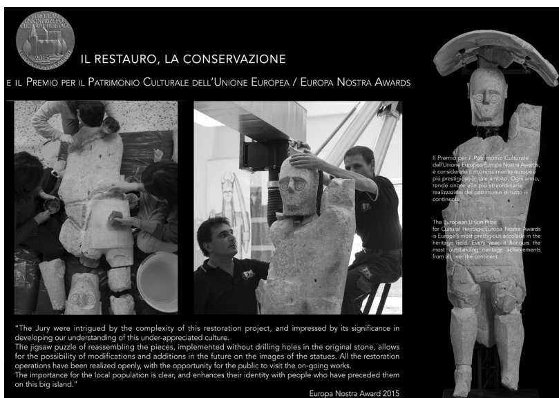
Fig. 9 2015, the project “Nuragic Sculptures of Montè Prama” was awarded the European Union Prize for Cultural Heritage / Europa Nostra Awards in the category “conservation”. The award is europe’s most prestigious accolade in the heritage field. Every yer, it honours the most outstanding heritage achievements from over the continent. Panel in the Museum of Cabras, Sardinia.

The public opinion developed by our project was fundamental to nomination for the Europa Nostra Awards (European Union Prize for Cultural Heritage), for the best European conservation projects. The CCA project for the Montè Prama sculptures then won the Public Award for 2015.