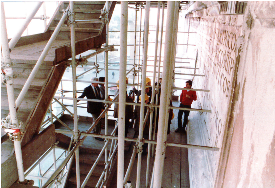
Fig. 3 1980-82, Arch of Septimius Severus in Rome: guided tours were organized bringing visitors on the scaffolding