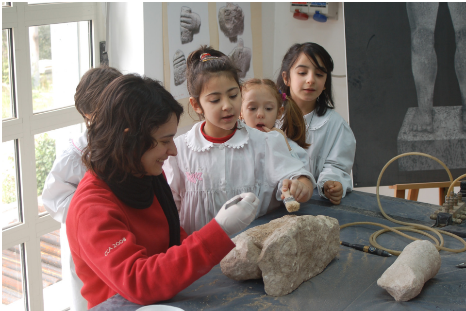
Fig. 8 2007-2011, Interactive visits for children were organized during the conservation project of the Mont'è Prama sculptures

In the course of the conservation project for the Mont'è Prama Nuragic sculptures, we organized the workplace in a manner that reproduced the original habitat of the sculptures. In effect, we transformed the laboratory as a museum display. Conservators, curators and restorers need to recognise new cultural behaviours as they develop, and to develop their laboratories in ways that draw attention to cultural heritage, through newly available channels of communication. Museum conservation serves as the springboard to spread the heritage information that today's audiences are seeking. We need to use our activities, and the information we hold, to raise awareness on concepts of fragility and heritage conservation, particularly among younger visitors.