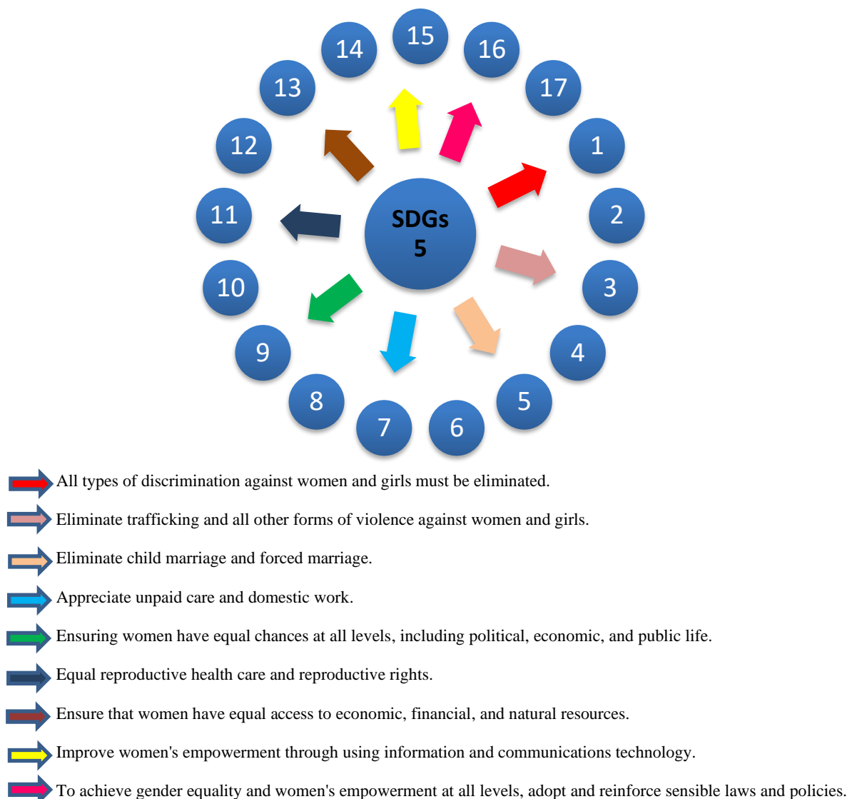
Figure 1. SDG5 with Sub-goals, source: https://sdgs.un.org

– partnerships for the goals). Similarly, when it comes to educational attainment, India's rank stands at 114. The two indices where India fared the worst, however, are the health and survival sub-index, with the rank of 155 (a spot ahead of China), and the economic participation of women. With respect to the Economic Participation and Opportunity sub-index, India is among the bottom ten globally because the estimated earned income of women in India is only one-fifth that of men in the country (SDG 17 – partnerships for the goals). UN, suggest collaboration to achieve the goal of SDG and gives a call to business organizations. Business organizations play a vital role in minimizing gender inequality. Business organizations are a platform that affects our society a lot. UN proposes that business organizations adopt and modify some strategies with the goals of SDGs. The situations need collaboration basically from the government and organizations. The business organization has a great impact to minimize the gender equality gap. For that, we analyze the impact of business organizations and business leaders in achieving gender equality in the next sections. Business organizations and those who run business organizations have a great impact on our society. Several studies support that the goal has numerous benefits that help to achieve Sustainable Development Goals through SDG 5.