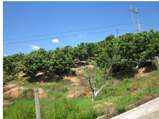
Figure 2. Photographs of abandoned red bayberry orchards(Top) and intensive managed red bayberry orchards(Bottom) in Sanzhou Town, Changting County.

Given data availability, we choose the most profitable orchard management – red bayberry management – to show the overall economic benefits of orchard investment in Changting County. The intensive orchard management would need extremely more input than extensive management. To gain comparability and scientific results, we solely selected red bayberry orchards which were developed in 2001 and intensively managed since 2001 for survey. The interviewed householders recalled the input and output of their orchards during the past management by memory or account books. After detailed face-to-face interviews, we obtained the ultimate cash flow data of red bayberry management in Changting County. The specific survey data could be seen in subsequent parts. To promote the comparability of data in different years, all prices were converted to comparable prices of 2012 to remove the effect of inflation.