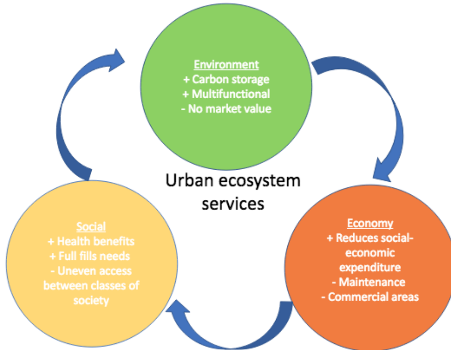
Figure 2. Flow picture for how urban ecosystem services can correlate with the three aspects: Economy, social and environment