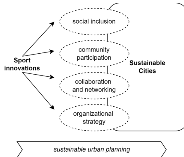
Figure 2. Sport innovations areas of influence on sustainable cities