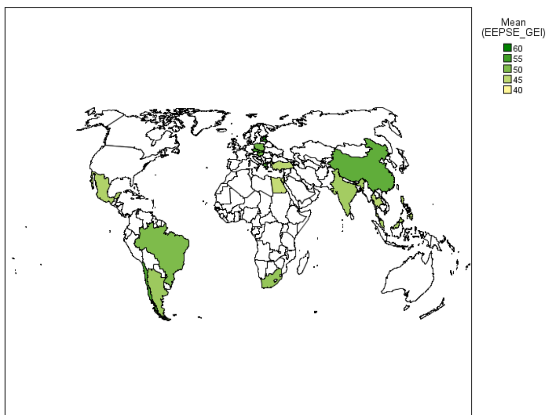
Figure 1. The emerging countries by EEPSE GEI in 2022 (authors' presentation)

According to the research results (Figure 1), Estonia is the highest ranked country on the list of observed emerging countries, with EEPSE GEI equal to 59.02, while the lowest ranked country is Egypt, with EEPSE GEI equal to 44.50. Apart from Estonia, countries with EEPSE GEI scores above 50 include Latvia (55.81), Czech Republic (55.32), Greece (54.21), Slovakia 54.10), Chile (53.78), China (52.40), Hungary (51.94), Poland (51.67) and Brazil (50.07). The EEPSE GEI score of other emerging countries is less than 50.00.