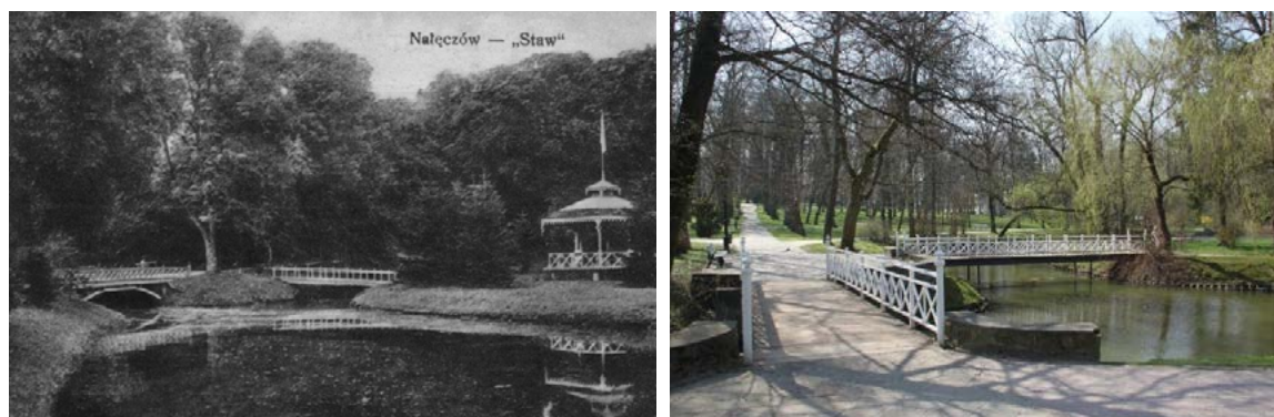
Fig. 6. A – Garden bridges leading to the island and a gazebo for an orchestra, a postcard, the beginning of the 20 th century, B – Garden bridges leading to the island, author's own photography, 2018