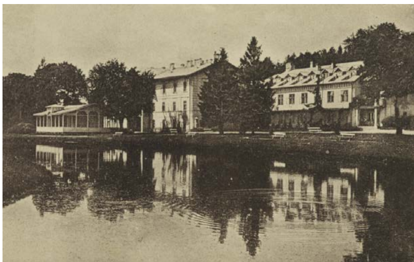
Fig. 5. The spa park, the pond, 1927–1935, Album of Nałęczów:- Pub. By. Jadwiga Cholewińska w Nałęczowie

One of the attractions available for the patients was boats rental in the little harbour at the south part of the pond. Other was free of charge tennis court located at the descent between the palace and the maple tree alley. From 1935, the spa resort went into decline [Żelechowski 1998] (Fig. 5).