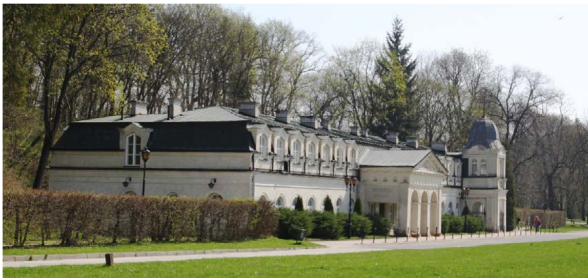
Fig. 4. Łazienki with the first “Celiński's source”, author's own photography, 2018

Apart from the source of love, there was another source in the vicinity of Domek Biskupi (Little Bishop's House) or Domek przy źródle (Little House by the Source) was built in the beginning of the 19 th century, and then “Łazienki kąpielowe” (Bath building) was built in 1816 [Sołdek 1997]. (Fig. 4) It was so-called Celiński's source, “ferruginous acidic water” , used both for drinking and for bath [Nałęczów...1891]. It was very efficient source – around 120 liters / minute. It fulfilled the needs of the patients and related therapies at that time [APL] Unfortunately, the grandness of the former source is now a history. Nowadays, the Celiński's source is still active, but there is no access to it. Its history is described on the information board. “The source of love” is in much worse shape. The former grandness from the beginning of the 20 th century is long gone. There is only concrete frame with devastated stairs and the inscription “Drinking of water is forbidden” .