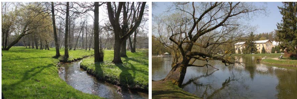
Fig. 1. A – Bochoćniczka River in the park, 2018, autor's photography, B – The park pond, 2018, autor's photography

The borders of the park didn't change much except from the west border, where the former palace – lean-in was located in the fruit garden [Tarka 1983]. The outbreak of the November Uprising and later consequences resulting from it was descriptive for the estate. As a result, the Nałęczów complex was sold by the heirs of Ludwik Małachowski. At the end, the palace together with park was covered by lease in 1877 by Fortunat Nowicki. One year later, a new administrator started general transformation of the complex – probably it was the time when the big pond was removed and at that place was dedicated for a garden [Olszewski 1998]. At the same time, Nałęczów was bought by Michał Górski, who resold it in 1880 to the Spółka Udziałowa – Zakład Lecznicy (treatment intitute – holding company). That year was a start of "the golden period" of the resort, which lasted until 1914. At that time, the whole park and buildings in its area were substantially transformed. The new buildings were erected for the needs of the health resort, eg. hydropathy unit.