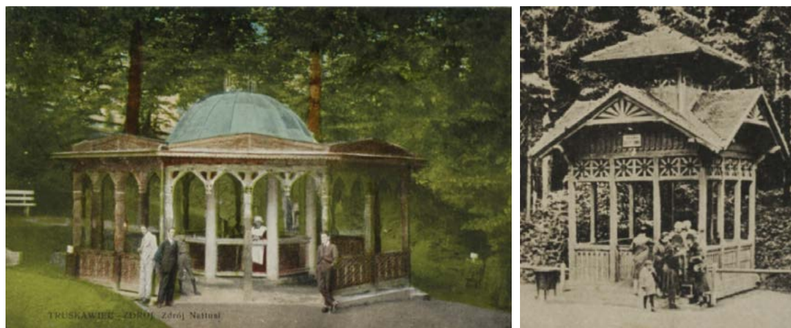
Fig. 2. The Naftusia and Bronisława Sources in Truskawiec, the inter-war period.

The sources in Truskawiec were decorated with wooden gazebos, bricked gloriettas (the Naftusia source) and the pavilions in the form of garden pavilions. The pump rooms were often key elements of so-called covered promenades. (Fig. 2)