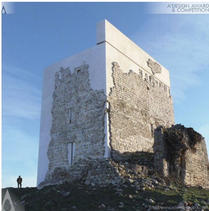
Fig. 15. Photo 15. Consolidation of the tower of the Castle of Matrera, Villamartin, Spain, source: https://competition.adesignaward.com/design.php?ID=48588