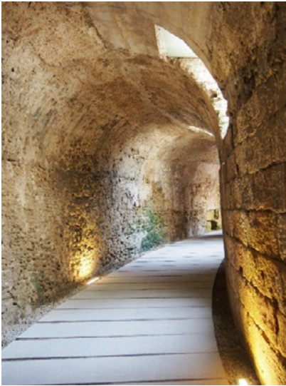
Fig. 13. Vaults of the gallery of Teatrum Balbi, Cádiz, 2018.