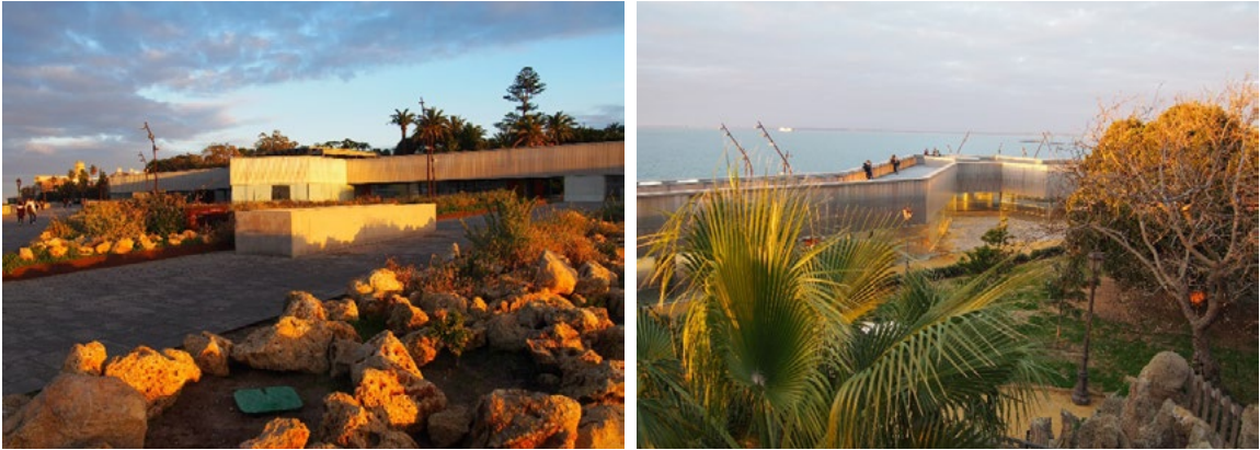
Fig. 5, 6. View promenade and structures of Genoves Park, Cádiz, 2018.

steel, link the character of this building with the previously discussed project Entre Catedrales . Although they have been conceived by different authors, both solutions are connected by the concept of a transparent, modern architectural form, which does not impose itself, which is not imitative, and at the same time which is not in conflict with the existing historical architecture and is functional in terms of urban planning. Both projects share an emphasis on the making use of the existing view perspectives and creating new ones, taking full advantage of the picturesque location of the city and the fact it faces the bay.