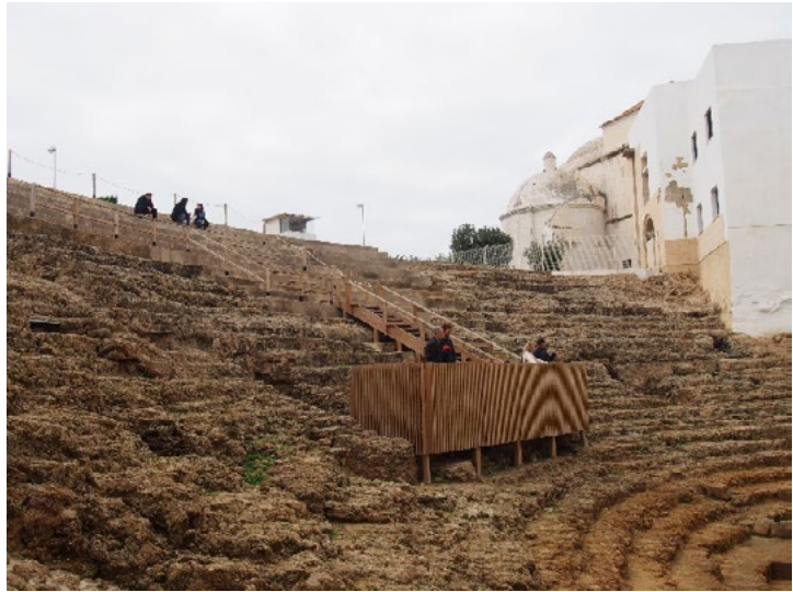
Fig. 14. Teatrum Balbi, Cádiz, 2018.