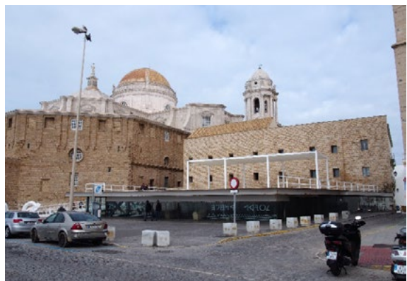
Fig. 3, 4. The platform "Between the Cathedrals", Cádiz, 2018.