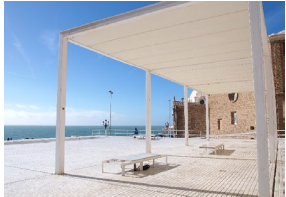
Fig. 1, 2. The platform "Between the Cathedrals", Cádiz, 2018.