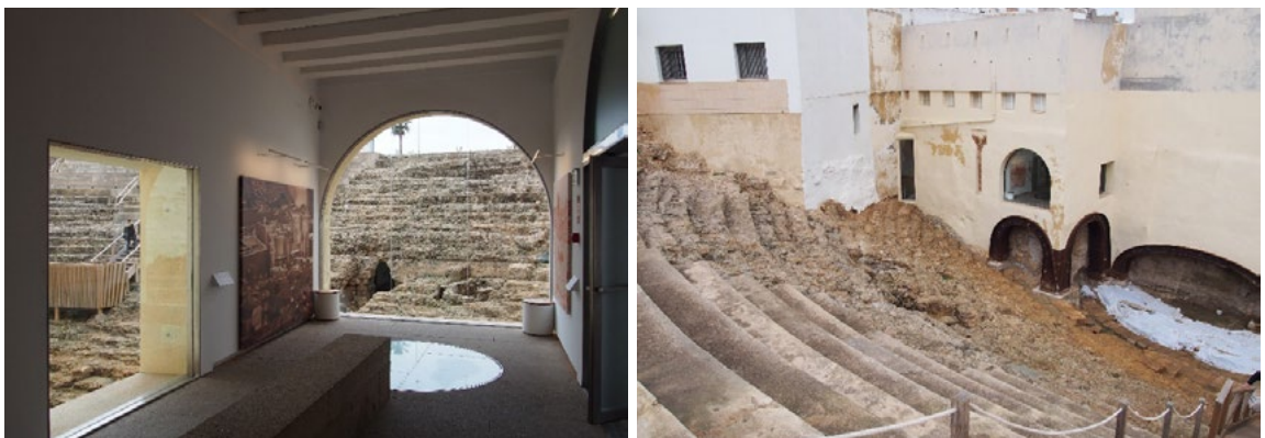
Fig. 11, 12. Teatrum Balbi , Cádiz, 2018.

In Centro de Interpretación , via advanced interactive audio-visual solutions, viewers take a trip in time, from the views of El Pópulo in Room A, through modern views and plans of Cádiz in Room B, Room C devoted to Teatrum Balbi itself and its architecture, to Room D, which undertakes the topic of the meaning of theatre in the Roman society 18 . Visitors can see a model of the original building, and four round glazed openings in the floor allow to admire fragments of uncovered sections of the excavations. In the vestibule – Room A – you can see a fragment of scaenae frons , in Room B – proedria and a part of the section cavea , and in Room D – orchestra . Room C presents also the found fragments of decorative stonework, for instance a stone which is a part of one of the seats, with an inscription " Latro Balbo " (Balbo the thief), which was most probably the work of one of dissatisfied builders of the theatre 19 . The exhibition is arranged in a minimalist, modern form, dominated by wood and whites, enhanced with skilfully designed lighting arranged in slots in the ceiling and LED backlights illuminating the exposition itself, e.g. large-format photographs. The Interpretation Centre demonstrates the ancient remains not as something separate, but in the context – the social one, the context of architecture history, and most of all in the context of the history of the city to the present day.