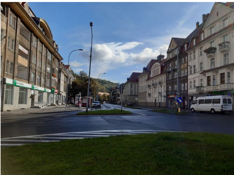
Fig. 8. The center of Wałbrzych.