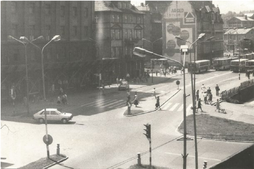
Fig. 3. Grunwaldzki Square in the 1980s – the center of Wałbrzych.

Over the many years of their parallel development, Wałbrzych and Szczawno became mutually connected in several ways, which was especially apparent in the second half of the 20 th century. Wałbrzych became a commercial, economic and administrative base for the spa. Szczawno-Zdrój became more than a weekend recreation area for the residents of Wałbrzych.