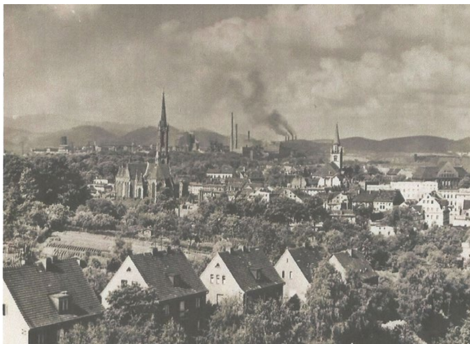
Fig. 6. View of downtown Wałbrzych. The turn of the 1960s and 1970s.

The image of the town, which had been largely shaped by its historic spa buildings and landscape values, started to be seen through the prism of the polluted, smoky, and troublesome city of Wałbrzych. Such was the image that was recorded in the memory of tourists, particularly in the last decades of the late 20 th century, which diminished the popularity of this spa town.