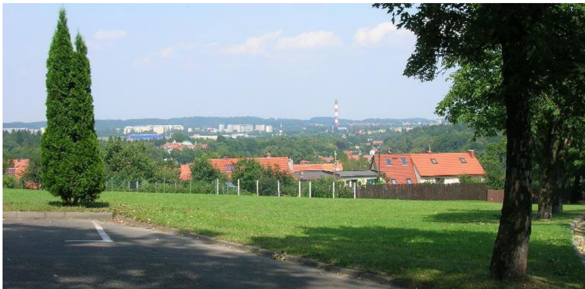
Fig. 5. The landscape of Szczawno-Zdrój. Wałbrzych's Podzamcze housing estate is visible in the background.

When viewing Szczawno from the surrounding hills, one can see a spa landscape set against the background of apartment blocks and housing estates of Wałbrzych districts, which upsets the traditional landscape of the town. [4, s. 37–44].