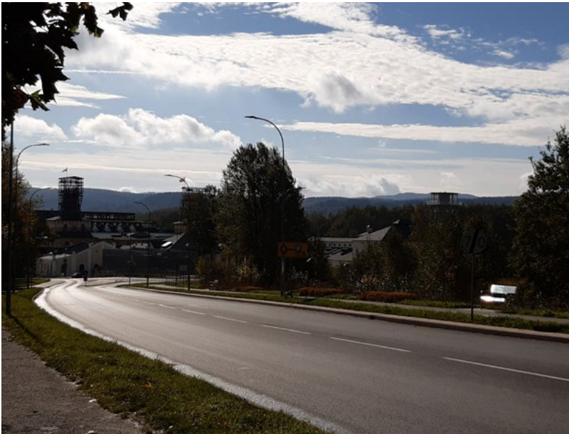
Fig. 7. “Stara Kopalnia” (Old Mine) in the landscape of Wałbrzych. (photo by author).

Wałbrzych started to change at the beginning of the 1990s. The character of the city and its landscape changed. The political and economic transformations led to the closing of mines, coking plants and most of the onerous industrial plants. The city's industry structure changed. The quality of air over Wałbrzych and the region changed. Already in the 1990s (largely as a result of the restructuring of Wałbrzych's industry) dust pollution in Szczawno was significantly reduced to a level that was acceptable by the spa town. Since the beginning of the 21 st century, Wałbrzych has undertaken many projects aimed at rebuilding and organizing subsequent parts of its built development. The projects also include the modernization of road infrastructure. For Szczawno-Zdrój, the most promising investment is the recently started construction of Wałbrzych western bypass which will connect the northern residential districts with the city center, bypassing Szczawno-Zdrój.