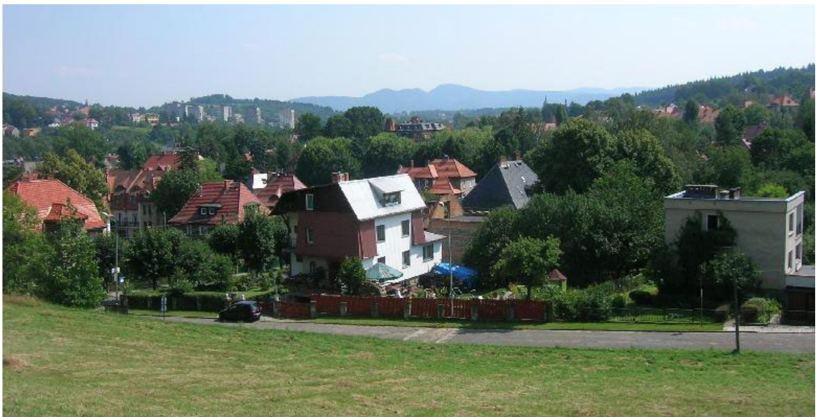
Fig. 4. The landscape of Szczawno-Zdrój. Wałbrzych's Biały Kamień housing estate is visible in the background.

Despite this close relationship, Szczawno has retained its uniqueness in terms of the scale and character of its buildings.