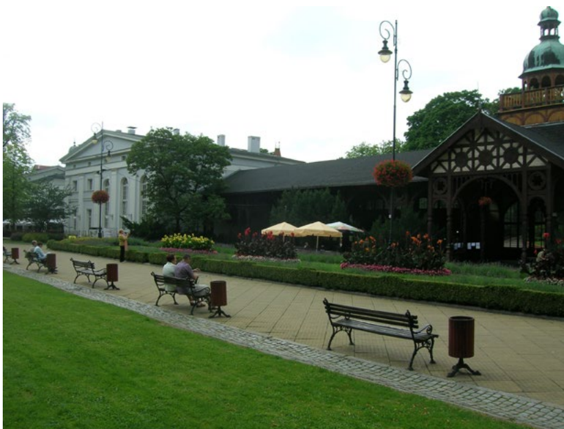
Fig. 1. Szczawno-Zdrój.

Owing to the high standard of facilities and their good condition, it was possible for the spa town to quickly resume operation. In 1946, Szczawno (then Solice-Zdrój 1 ) admitted its first civilian patients [2, s. 99]. On July 1, 1945, Szczawno-Zdrój (then Solice-Zdrój) received municipal rights.