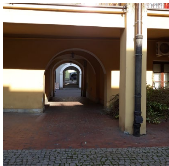
Fig. 5. Courtyard No. VI, Access to the courtyard spaces provided by gateways (1-2)