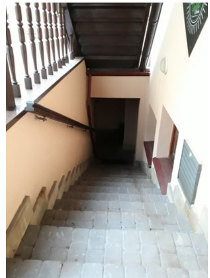
Fig. 11. Courtyard No. IV Steep basement staircases