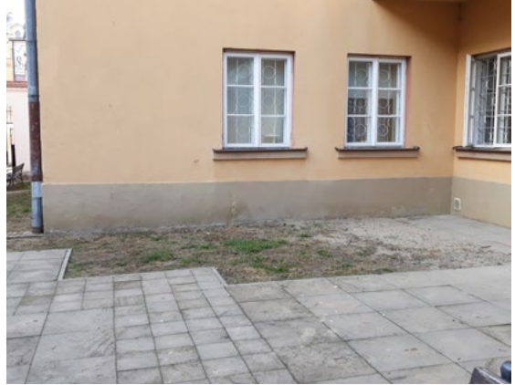
Fig. 17. Courtyard No. VI; Unused green space suitable for the introduction of rain garden