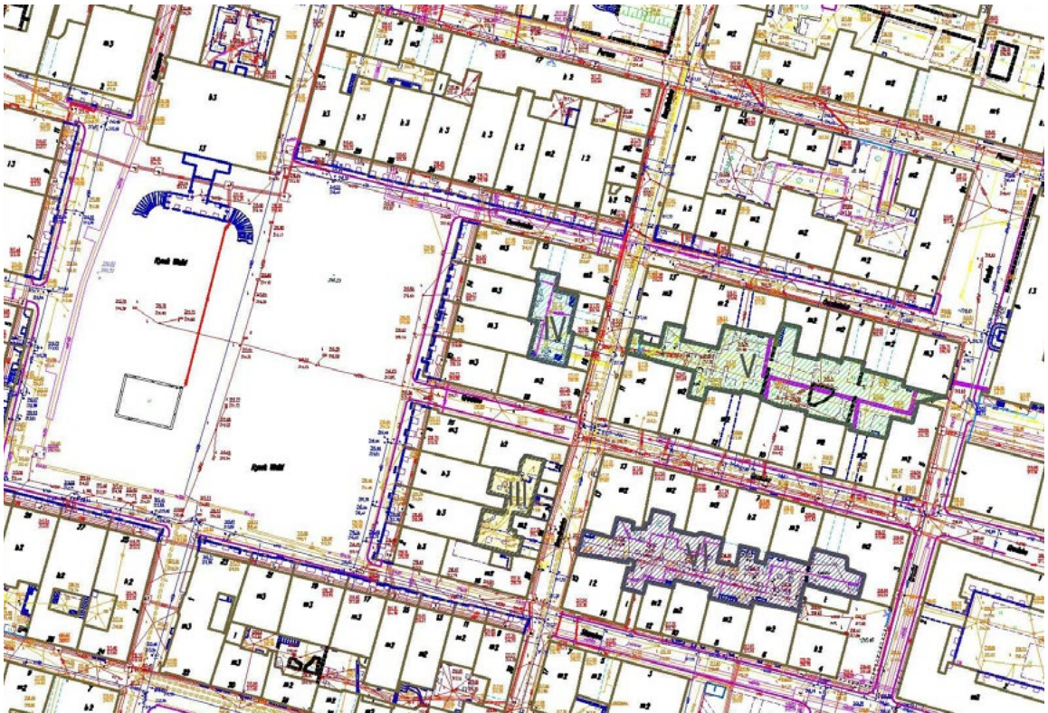
Fig. 1. Courtyards; Source: author's own material

One of the most characteristic features of the Zamość town centre is the existence of inward courtyards located primarily on the east side of the Great Market Square. Despite their undoubted potential, their function is largely undetermined, unclarified. Tenement houses surrounding the courtyards provide residential spaces for the citizens who do not make enough use of the space they have at their disposal. The buildings and the courtyards are accessible from the outside streets, via gateways. The ground floor parts of the houses provide small vending and service spaces (accessible from the main streets) with the residential units being situated on the upper floors. Social interactions within the courtyards tend to be scarce, random. No sense of community could be observed, reflected in taking care of the space around.