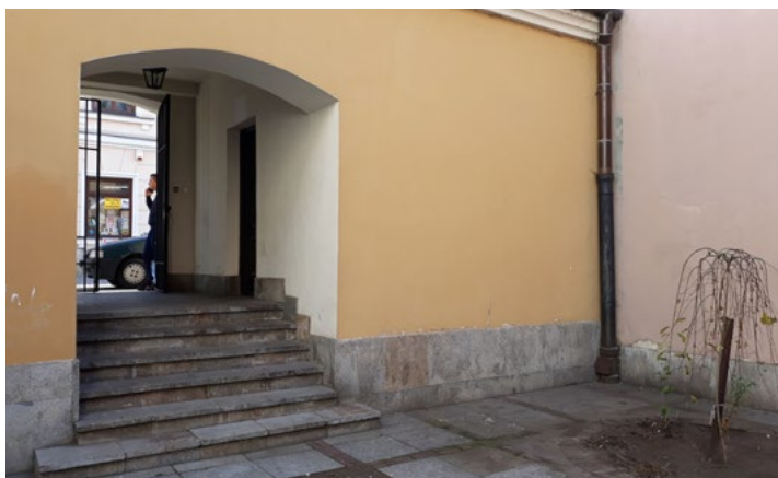
Fig. 2. Courtyard No. III, Lowered surface of the courtyard; Source: author's own photo