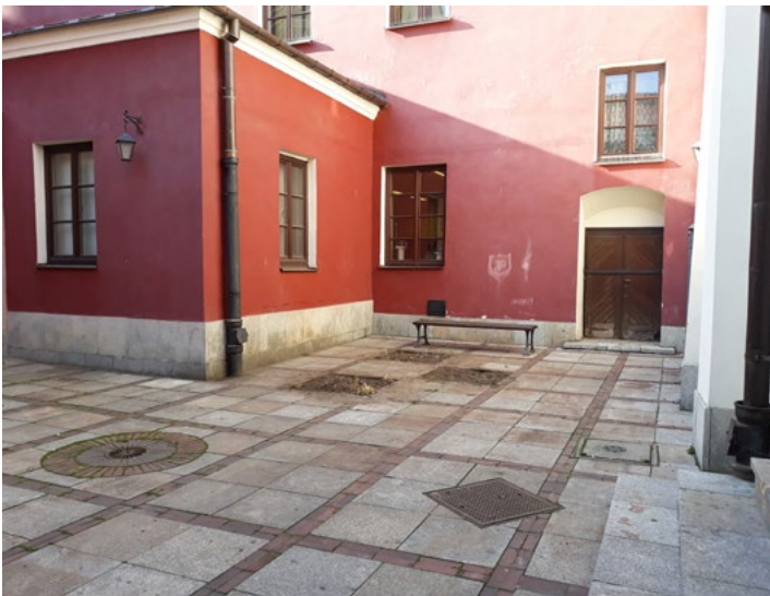
Fig. 10. Courtyard No. III, Extensive pavement contributes to more rapid water run off