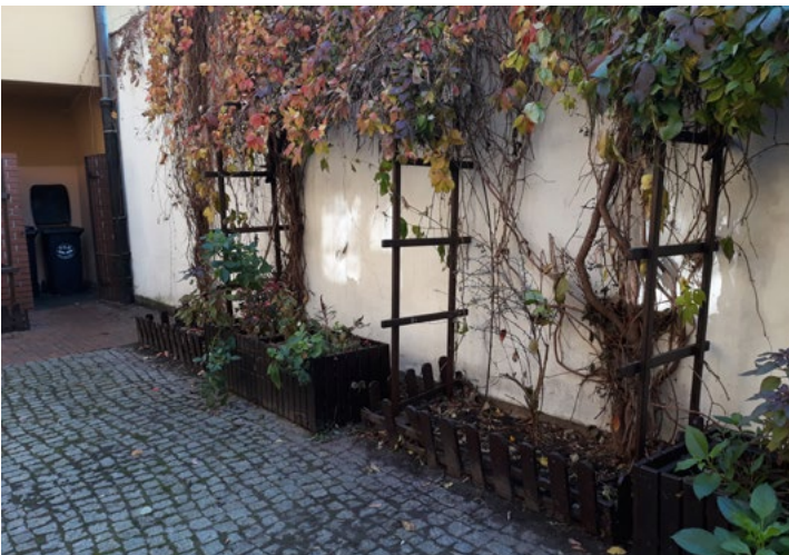
Fig. 18. Courtyard No. VI The existing greenery, the possibility of supplementing it with hydrophyte species of plants; Source: author's own photo