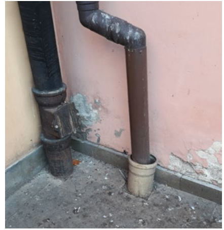
Fig. 9. Courtyard No. VI Down pipes 'sinking' beneath the ground connected to sewerage closed system; Source: author's own photo