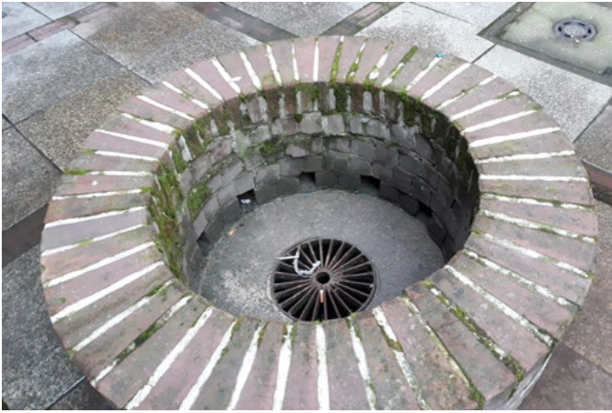
Fig. 8. Courtyard No. III, sewerage inlet built over by a brick circular piece of small architecture; Source: author's own photo

Terrain work related to the common features and spatial organisation of the courtyards were carried out in October and November 2018. The location of the analysed places is presented on the map showing the Zamość historical centre.