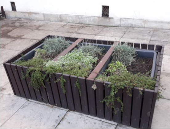
Fig. 16. Courtyard No. VI, The existing containers for plant cover and prospective rain garden implementation