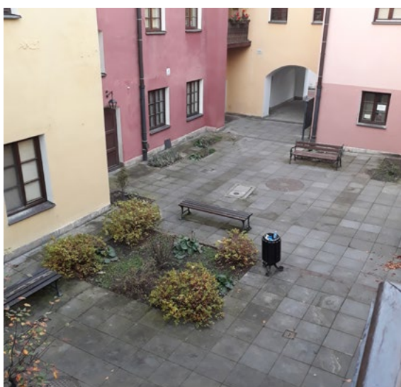
Fig. 4. Courtyard No. IV, Bird's-eye view on the Courtyard and the positioning of green slots; Source: author's own photo