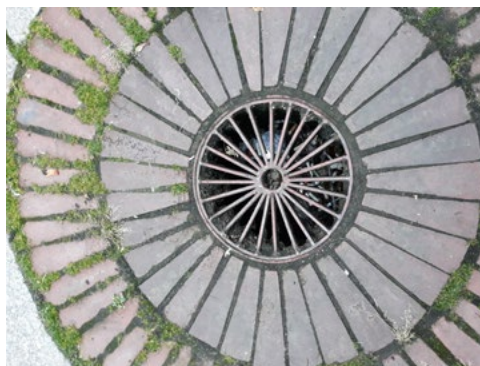
Fig. 12. Courtyard No. III, Clotted, 'blocked' inlet to the existing water drain; Source: author's own photo