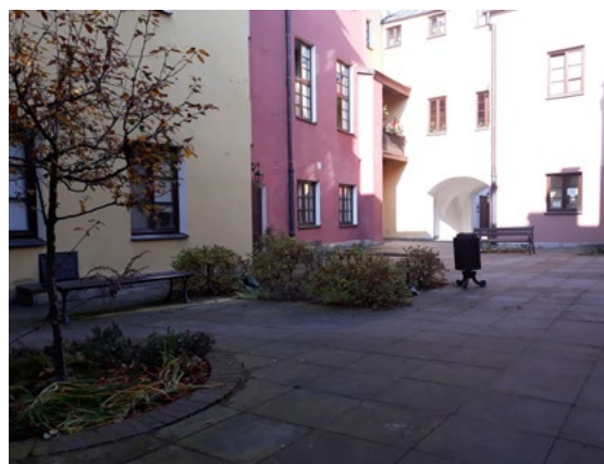
Fig. 7. Courtyard No. IV, Sun exposure; Source: author's own photo