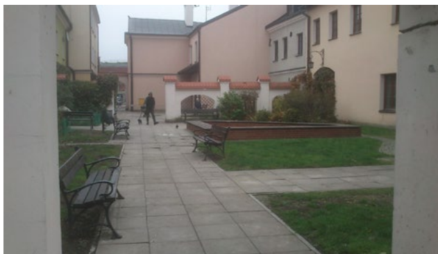
Fig. 13. Courtyard No. V, paved impermeable surfaces of the sidewalks; Source: author's own photo