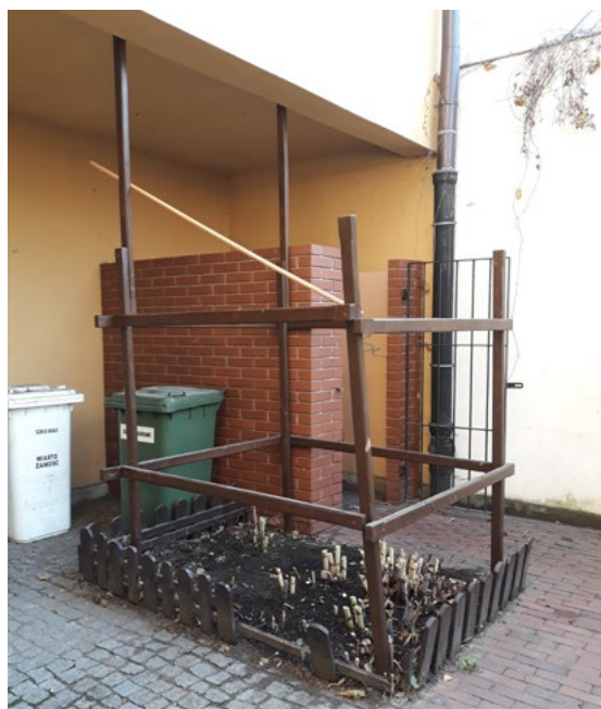
Fig. 15. Courtyard No. VI, Possible location for rain garden; Source: author's own photo