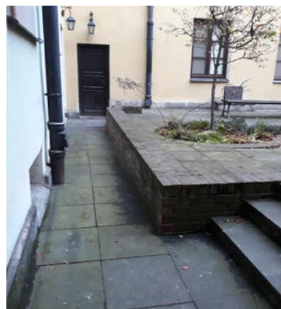
Fig. 3. Courtyard No. IV, Lowered parts of the courtyard; Source: author's own photo