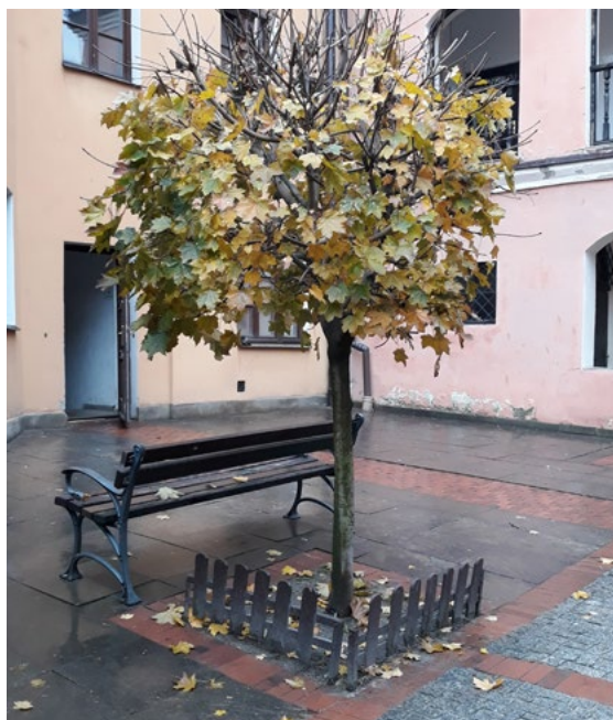
Fig. 14. Courtyard No. VI, Possible tight, infiltration reservoir; Source: author's own photo