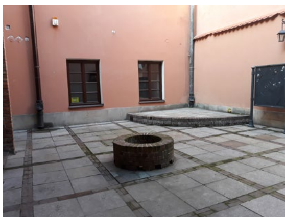
Fig. 6. Courtyard No. III, Enclosed space, potentially high risk of urban flooding; Source: author's own photo