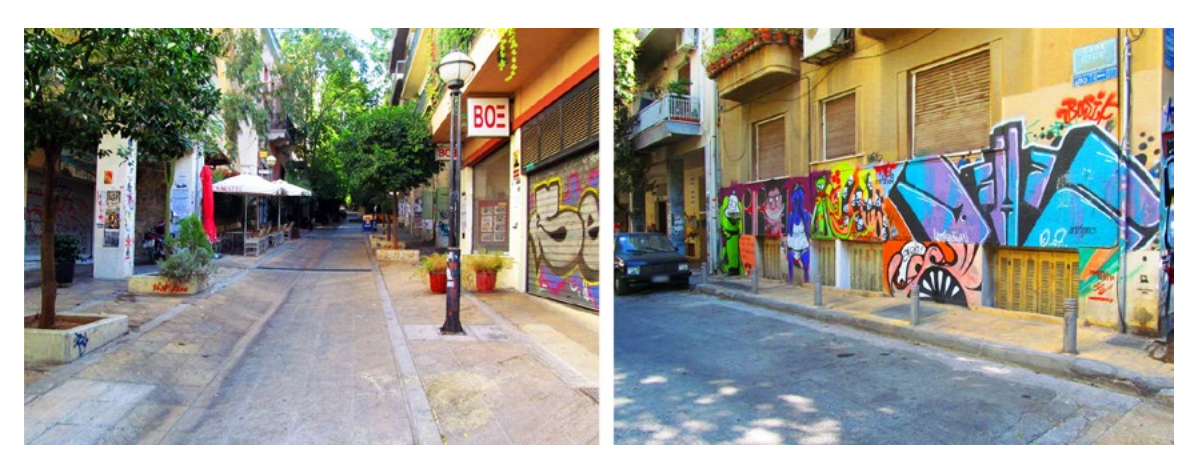
Fig. 5. Athens, Greece – city centre, residential development with abandoned service premises, with visible acts of vandalism on the façades.

Ateny, Grecja – centrum miasta, zabudowa mieszkaniowa z opuszczonymi lokalami usługowymi, z widocznymi na fasadach aktami wandalizmu.