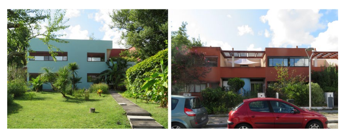
Fig. 1. Original modernism – villas designed by Le Corbusier in Pesac, France. Pierwotny modernizm – wille projektu Le Corbusiera w miejscowości Pesac, Francja.