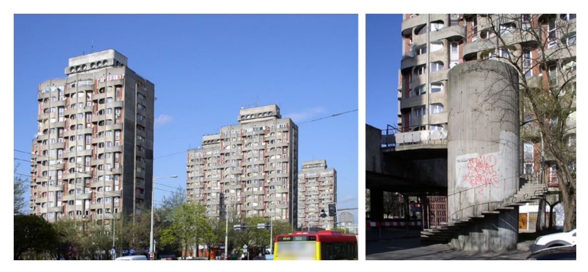
Fig. 2. Modernism in Wroclaw, Poland, housing estate by designed by Jadwiga Grabowska-Hawrylak – humanization of buildings in high prefabricated buildings – technical condition from before renovation (beginning in 2015). Modernizm we Wrocławiu, Polska, osiedle wg. proj. Jadwigi Grabowskiej–Hawrylak – humanizacja zabudowy w wysokich obiektach prefabrykowanych – stan techniczny z przed remontu (poczatek w 2015 r.).

Inhabitants of high apartment blocks feel more vulnerable to crime than residents of other types of buildings. [4] The concern is, unfortunately, confirmed by statistics – research made by Oscar Newman [5] indicates that the height of the building is positively correlated with the number of crimes committed in it. However, this correlation does not specify a cause-and-effect relationship between these two variables. Newman's study was conducted in the 1970s in the United States of America when high-risers were often inhabited by people with very low income. Additionally, many of them were parts of social housing projects.[6]