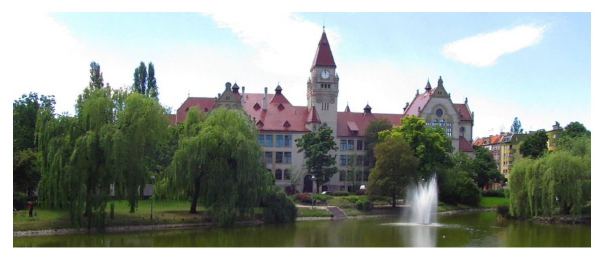
Fig. 4. A housing estate with a "defensive space" – Verde 25, Turin, Italy, clearly defined architectural and urban identity of the place outside and inside the complex.

Osiedle z "przestrzenią obronną" – Verde 25, Turyn, Włochy, wyraźnie określona architektoniczno-urbanistyczna tożsamość miejsca na zewnątrz i wewnątrz zespołu.