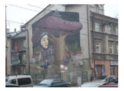
Fig. 1. The mural located on Lubartowska street in Lublin, 2017 Mural znajdujący się przy ul. Lubartowskiej w Lublinie, 2017