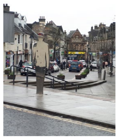
Fig. 5. The sculpture located in a predestrian way in a small town Alloa in Scotland, 2018

Rzeźba znajdująca się przed budynkiem Samodzielnego Szpitala Klinicznego przy ul. Jaczewskiego w Lublinie, 2018