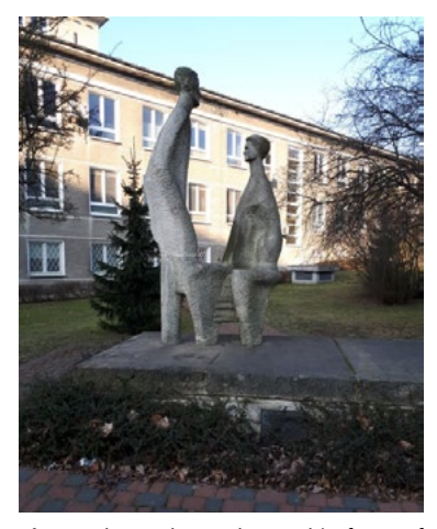
Fig. 4. The sculpture located in front of the Samodzielny Szpital Kliniczny on Jaczewskiego street in Lublin, 2017, author's photo

Art in urban space takes on various forms, where on the one hand it creates "street art", in the form of multi-format murals, and on the other hand, it presents full-size installations that enliven the "urban tissue". Art in different forms brings peace and serenity, to many people, increasing their sense of satisfaction with their everyday life and teaching them the openness to others. At present, elements of art in urban space can be encountered in many places in Poland or abroad. (Fig. 4,5,6) Thanks to the spread of art in urban space, it is no longer necessary to visit museums to admire it, but it is enough to keep one's eyes wide open and discover it in everyday life.