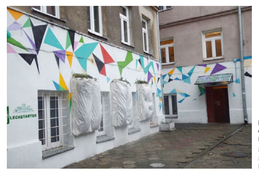
Fig. 11. The backyard located in one of the gates on Lubartowska street in Lublin, 2017

Both consensual and agonistic visions of the public sphere treat public space as one of its dimensions, which implies that it is governed by different laws than private space. We can also distinguish many semi-public spaces, such as backyards, playgrounds, housing estate interiors or even the facades of buildings that belong to private owners or housing communities. Introducing elements of art into such spaces, brings together and assimilates the community living there, who often use it as an element of discussion. More and more often closed backyards are also becoming a space for artistic activities, which leads to the change of their status into a more open, "friendly" and socially acceptable form. (Fig. 11)