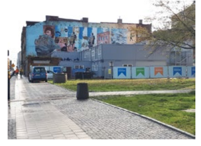
Fig. 3. The mural located on the wall in Łódź, 2017

Mural na murze os. Kalinowszczyzna Lublin, 2018