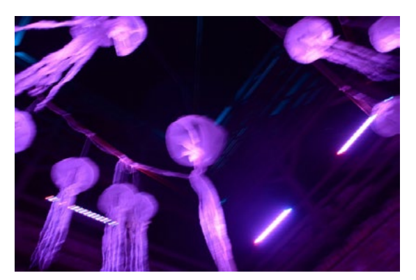
Fig. 8. Cultural night in Lublin 2018, author's photo Noc Kultury Lublin 2018, fot. autora

Social art associating citizens may concern different areas of artistic creativity and take place in different fields of social and civic activity. The city of Lublin may serve as a good example for social gatherings in public space. The creative activities of the city authorities undertaken in recent years are conducive to social integration and are implemented through cyclical organisation of cultural and entertainment events taking place in