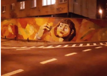
Fig. 2. The mural located on the wall in Kalinowszczyzna estate in Lublin, 2017

Mural na murze os. Kalinowszczyzna Lublin, 2018