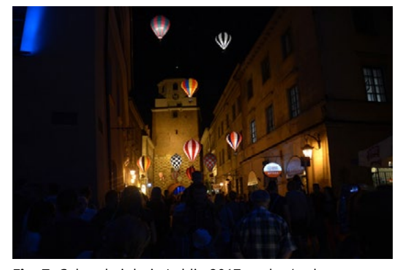
Fig. 7. Cultural night in Lublin 2017 Noc Kultury Lublin 2017

The aim of every artistic creation is to show a certain truth. Art "speaks" for itself, materializes the value of truth and beauty, and allows to enter the world of the artist's experiences. It is particularly important for people with disabilities, for whom it is one of the most important channels of communication with the outside world. This is because "a work of art takes us by the hand and leads to what is hidden deeper, to the essential truth. It shows us that truth with its entire itself. In a nutshell, it shows the wonderful synthesis, which allows the viewer to reverie."