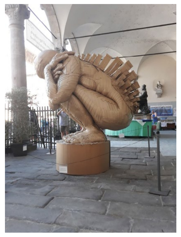
Fig. 10. Paper sculpture in the urban space, which previewed exhibition in one of the gallerie, Florence 2018, photo Katarzyna Kielin

Stalowa rzeźba znajdująca się przy jednej ze stacji klejowej w Alloa w Szkocji 2018, fot. autora