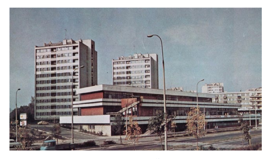
Fig. 5. Comercial buildings along the General Władysław Anders avenue in Lublin. Author: Zbigniew Zugaj

Rita and Tadeusz Nowakowscy were given the task of designing a coherent, modern and functional district. The duo was renowned for e.g. their project of the City Hall office building at the Wieniawska 14 street (in 1978), completed in cooperation with Jerzy Androsiuk, Stanisław Fijałkowski and Janusz Makowiecki. According to the new district's plan, the buildings were to blend into the natural landscape. The large gorge was to serve as the walking area for inhabitants and the "green lungs" of the estate. It was also important to create collision-free vehicle and pedestrian traffic, and this was achieved by means of the footbridges over the Lwowska and Gen. Władysław Anders<sup>17</sup> streets protruding through the estates.