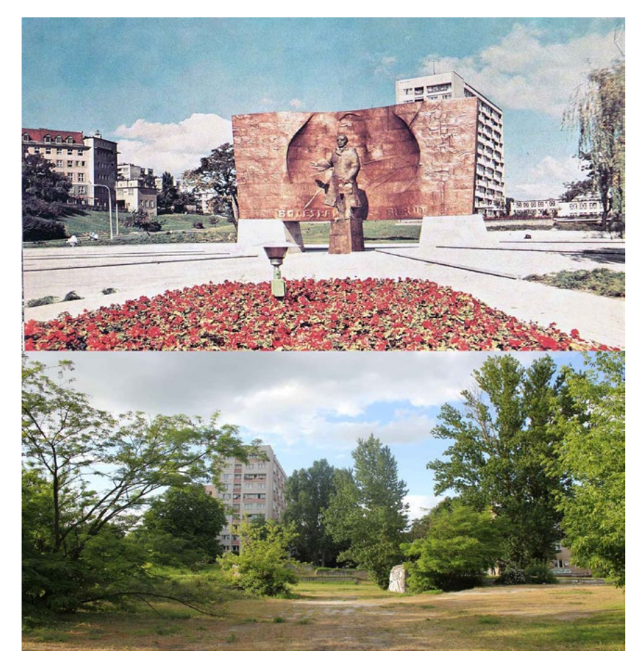
Fig. 8. No-longer-existing monument of Bolesław Bierut at the Singer's square in Lublin and present view (06/06/2017).