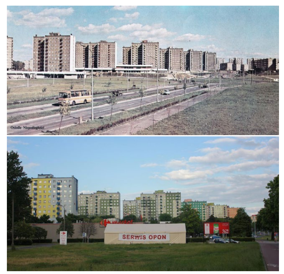
Fig. 9. Niepodległości district in Lublin – original condition and the current state.