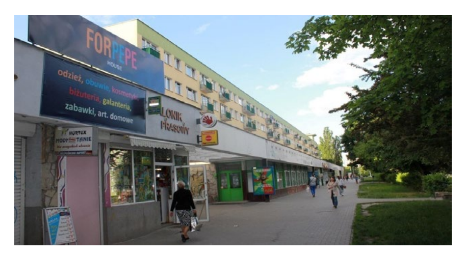
Fig. 6. Block of flats with shops on the ground floor, near the Lwowska street in Lublin