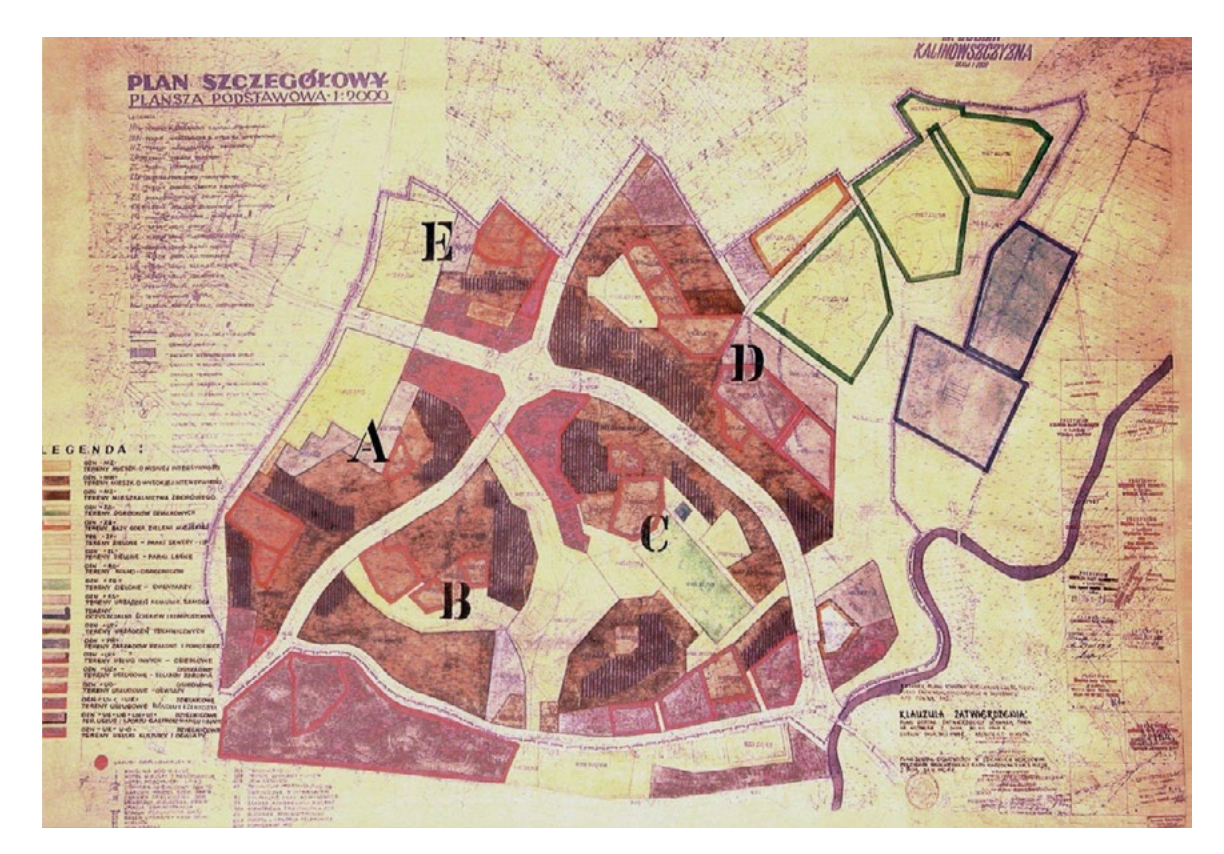
Fig. 3. The division of the Kalinowszczyzna district into housing estates, according to the detailed plan of 1964.