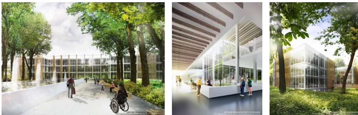
Fig. 4. A design concept of the Rehabilitation Centre in Poznan being part of the rehabilitation and orthopaedic centre within W. Dega hospital (28 Czerwca 1956 Street)

development, they need to be provided with green areas. In case of such hospitals, it is a good practice to so design the departments that the hospitalised patients could face the green areas. Furthermore, hospitals need to be provided with large windows as natural views have therapeutic effects on the patients both as regards their mental condition and physical recovery. The research has shown that the patients who watched the trees through the windows recovered faster than patients with views to the city centre or traffic (Bell., Greene, Fisher, Baum, 2004). [Fig.4]