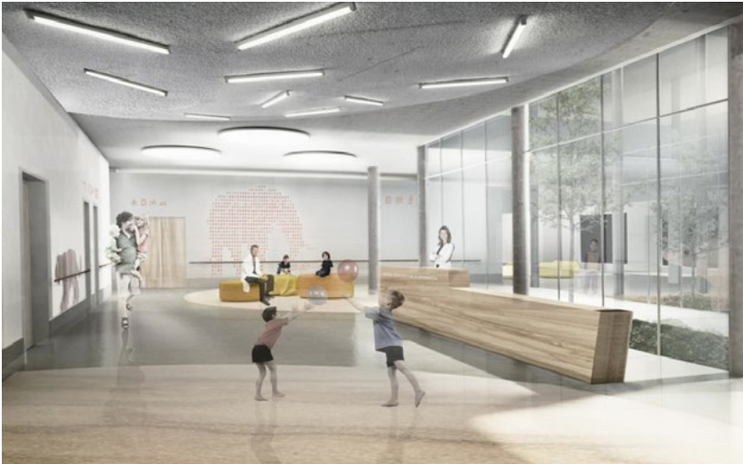
Fig. 3. Interior design of the admission room in a paediatric hospital.