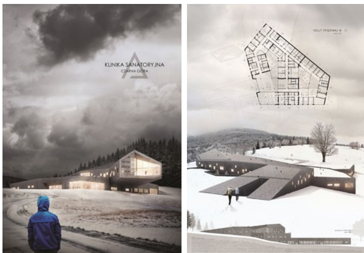
Fig. 5. Diploma design of a sanatorium clinic facility in Czarna Góra in Kotlina Kłodzka (The Kłodzko Valley),