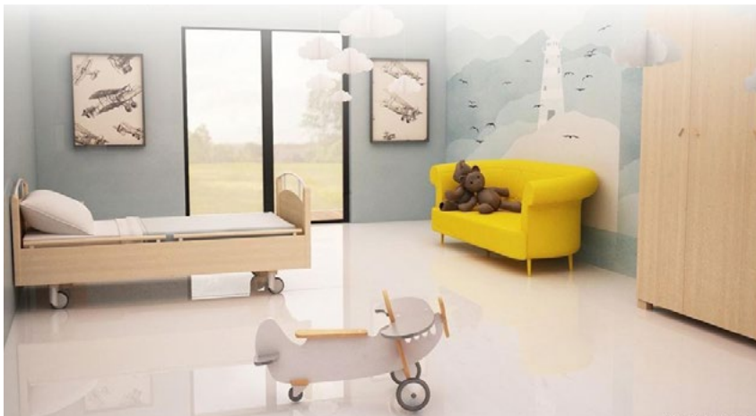
Fig. 1. Interior design of the hospital room in a paediatric hospital.

As early as in the middle of the previous century, paediatric hospitals were recommended to be designed to create optimum conditions for the patients, thus allowing for optimum daylight, accounting for green areas and suitable colours to create positive and stimulating environment for the hospitalised children separated from their families, not to scare them with white and unfamiliar interiors. [Fig.1]