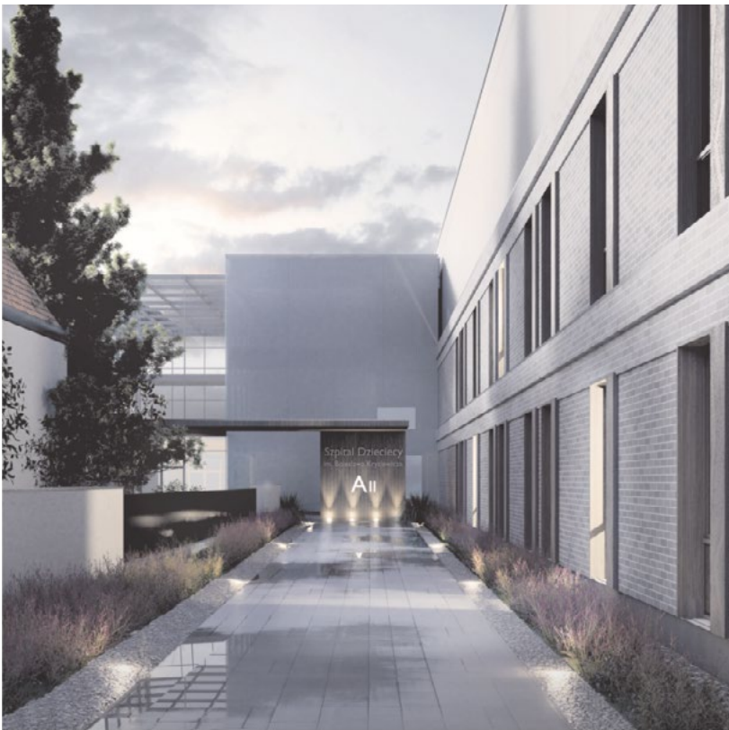
Fig. 6. Design concept of the extension of the hospital at ul. Szpitalna in Poznan.

Elimination of a gap in the aesthetics of hospital architecture and the architecture of residential development or recreational facilities has changed the sociological and psychological perception of hospitals (they are now less secluded from the urban structure and contradict the stereotypical images of hospitals, old people's homes, etc.) More and more often hospital architecture diverges from the previous practise of hardly accessible, anonymous, huge size buildings, where a user feels alienated. [Fig.6]