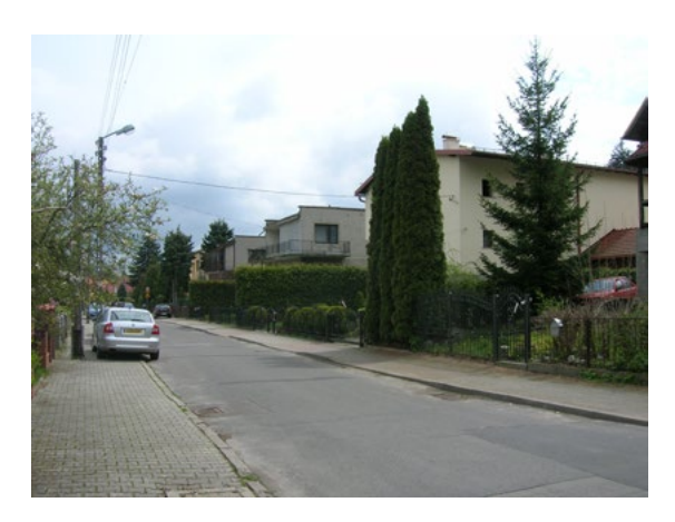
Fig. 5. Single-family housing complex (B – in Fig. 2).