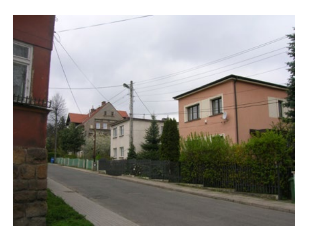
Fig. 3. Single-family homes – "cubes" among the existing development.

In the seventies and eighties, a period of intensive construction of single-family housing, the free plots in the vicinity of existing houses were filled with new residential development. The cube-shaped buildings stand out among the historical development. They are distinguished by flat roofs which are different than the traditional, steep roofs covered with tiles. Apart from the roof, their shapes and sizes do not differ significantly from those built earlier.