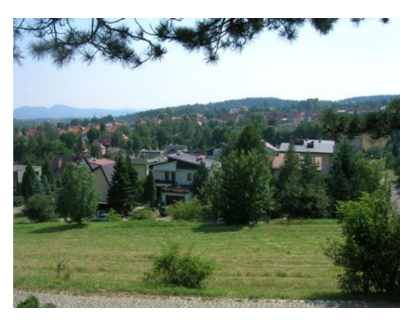
Fig. 6. Single-family housing complex (C – in Fig. 2).