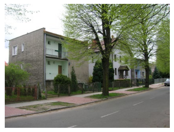
Fig. 4. Single-family housing from years 70 of the 20^{th} century (A – in Fig. 2).