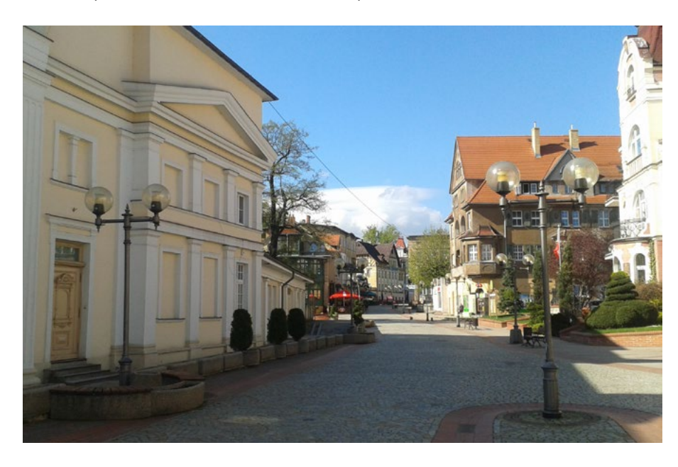
Fig. 1. Walking route in the central part of the spa town.

The year 1873 is a landmark date in the history of the Szczawno resort, when the nearby spa town of Stary-Zdroj (currently a district of Wabrzych with the same name) shut down its services. In this year, as a result of intensive mining operations at a neighboring coal mine, the last of the local mineral springs disappeared. Until then, Szczawno-Zdroj, despite its steady development, had been in the shadow of the more popular Stary-Zdroj. In 1873 about 40 publications were issued about Szczawno and its mineral waters, excluding press articles [4]. In the period following these events, which ended when World War II broke out, the spa town reached its peak of development and became famous in Europe.