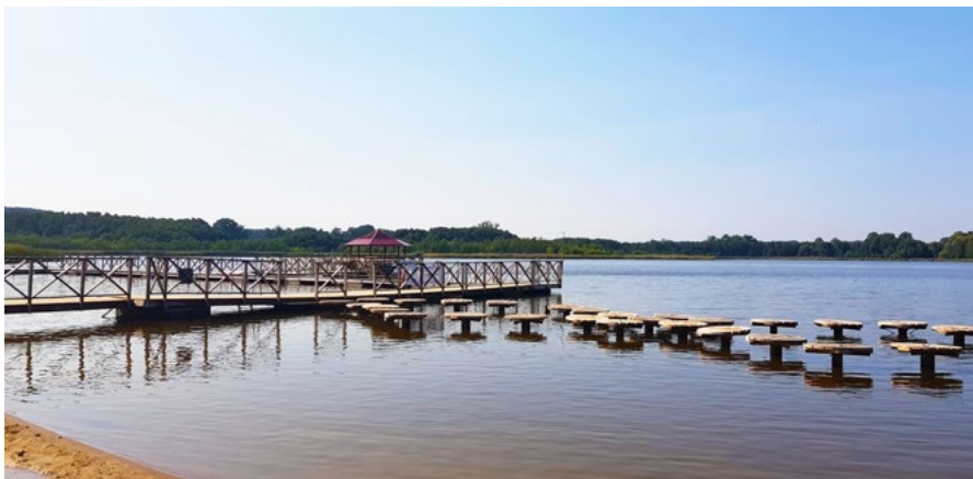
Fig. 3. Osieczna – Contemporary pier and walking path of circles (photograph taken 15.09.2020 by the author).

Osieczna, located in the Krzywiński Lake District, (part of the Leszczyński Lake District) due to its location is favorable for the development of tourism. The Municipality contains ten lakes, the largest – Łoniewskie Lake (102 ha, zander type) is located in the town [16]. The earliest mention of Osieczna's summer resort comes from the second half of the 19 th century. Originally the bathing area (located on the Łoniewskie Lake peninsula) did not have a beach, as there was no tradition of sunbathing (lake baths were used for therapeutic purposes). Access to the water was provided by the stairs leading directly from the bathroom building (which was later on destroyed during World War I). Few years after the war, it was decided to continue the development of the resort. In 1924, the town authorities bought plots of land by the lake, where a new summer resort was planned. In place of the former bathrooms, there was created a complex containing bath building (destroyed at the end of World War II), beach and piers. A restaurant and a hotel were also raised at that time. In the 1950s, a new, larger beach with imported sand was formed. In the 1990s, the restaurant building was demolished and started a tendency to build Employee Centers, now privatized [5,9].