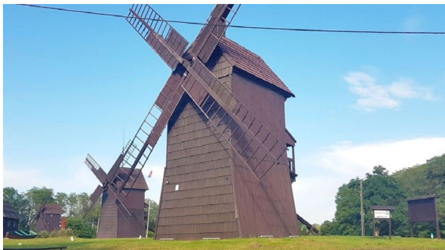
Fig. 2. Osieczna – Group of historic windmills.