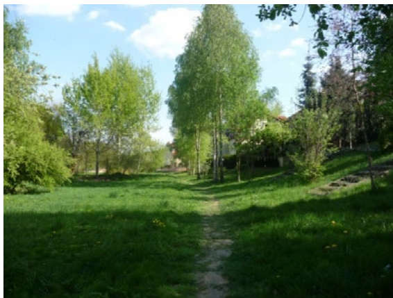
Fig. 1. Views of the undeveloped part of the ravine