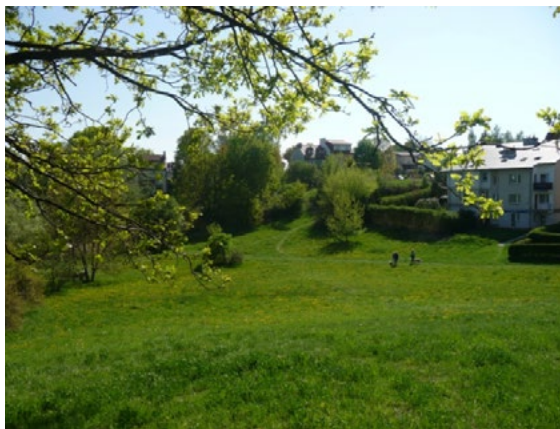
Fig. 2. Views of the undeveloped part of the ravine