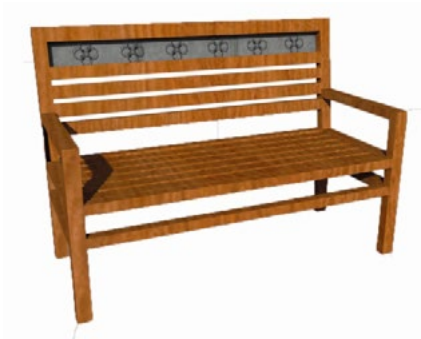
Fig. 4. Original design of the bench (by M. Kowalczyk)