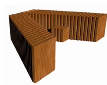
Fig. 5. Original design of the A-shaped bench (by M. Kowalczyk)