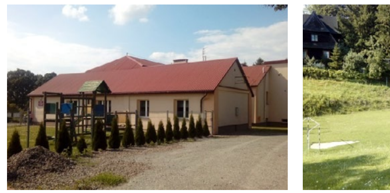
Fig. 3. Building of the Elementary School (by M. Stefanek, 2017) Fig. 4. School playground (by M. Stefanek, 2017)

The study area is located in the town of Stasin in the suburban area of Lublin, in the Konopnica commune. The elementary school building is located on a plot of 5730 m<sup>2</sup> area. The property is surrounded by individual housing and open countryside. The first information about the existence of the school in Stasin dates back to 1817. The current building dates back to 1993, after the previous one burned down in a fire. There is a fenced playground in front of the school. There is a car park on both sides of the square, and a grass pitch was located in the northern part of the area. The area around the object will be intended for children between 6 and 15 years old.