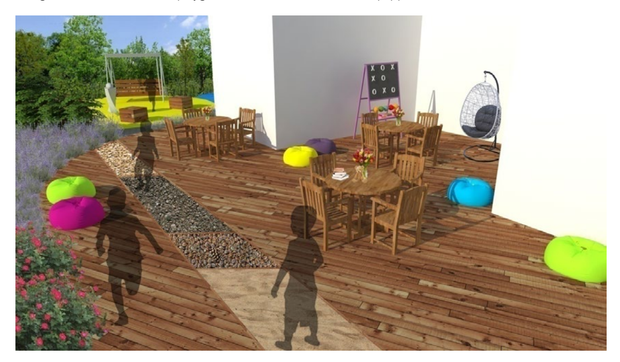
Fig. 6. Concept of sensory garden at the Elementary School in Stasin (authors)

for a vegetable garden where children can grow plants. In the northern part, the location of the grassy field has been preserved and a hearing zone with tree and shrub plantings has been added. In the western part of the garden, elevated lawns have been designed with plants with special fragrances. The car park is separated from the fragrance zone by a gravel bed with ornamental grasses. There is a gymnastic cube, a tic-tac-toe board, swings and a sandbox on the playground. And the whole area is equipped with benches and bins.