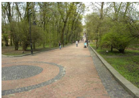
Fig. 6. The wide main avenue leading through Franki Park towards the Old Town