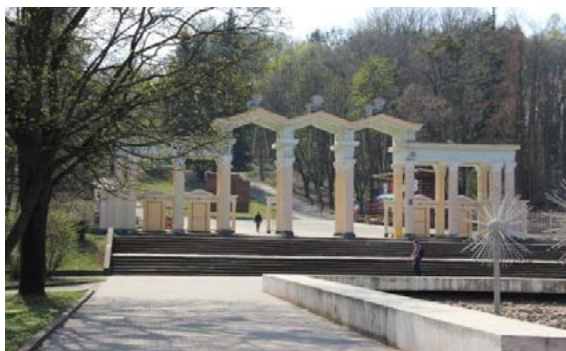
Fig. 8. The main entrance to the park from ul. Stryjska

of 5,000 seats, cultural and entertainment center "Romantic", central stage, as well as numerous attractions for children, among others, dry toboggan run and rope park (Fig. 9). In summer, there are many concerts, city holidays and mass celebrations. The property has a very good cycling route.