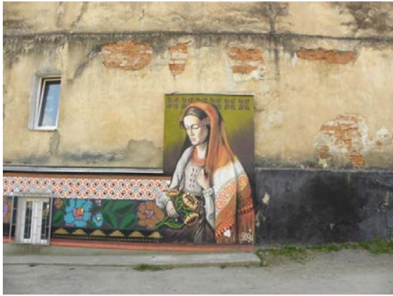
Fig. 4. Mural with folk motifs, ul. Krzywonosna (M. Dudkiewicz, 2017)