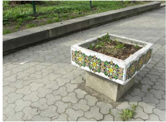
Fig. 5. Graffiti with a folk motif on the flowerbed in Franki Park (M. Dudkiewicz, 2017)