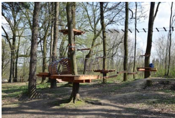
Fig. 9. Rope park in the Khmelnytsky Park (W. Durlak 2017)