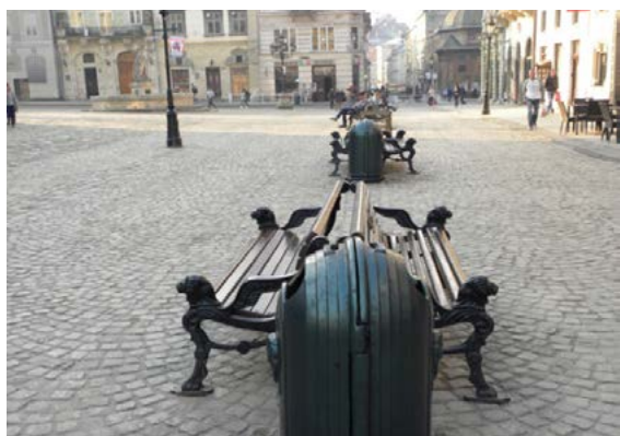
Fig. 2. Stylized Lviv city benches and garbage bins (M. Dudkiewicz, 2017)