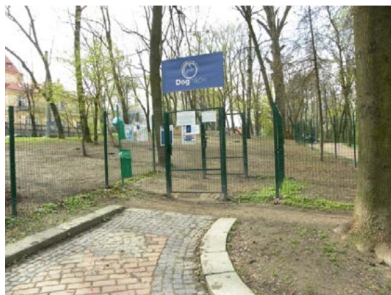
Fig. 7. Entrance to the dog paddock (M. Dudkiewicz, 2017)