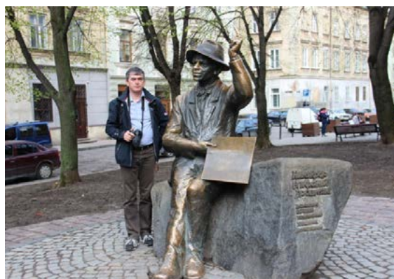
Fig. 3. Monument to Nikifor Krynicki near the Dominican Church (M. Szmagara, 2017)